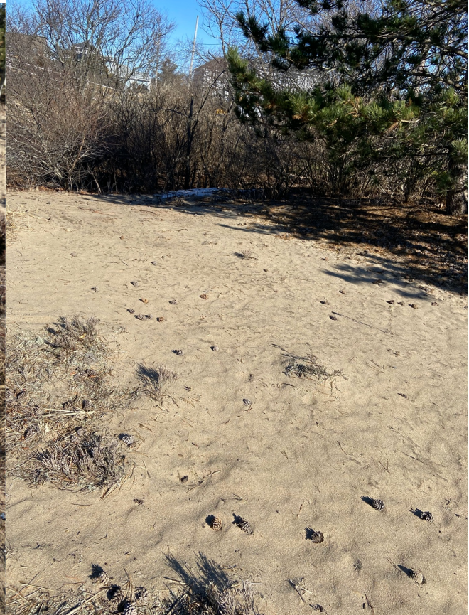
Covered Area (mitigation area can be seen in distance)