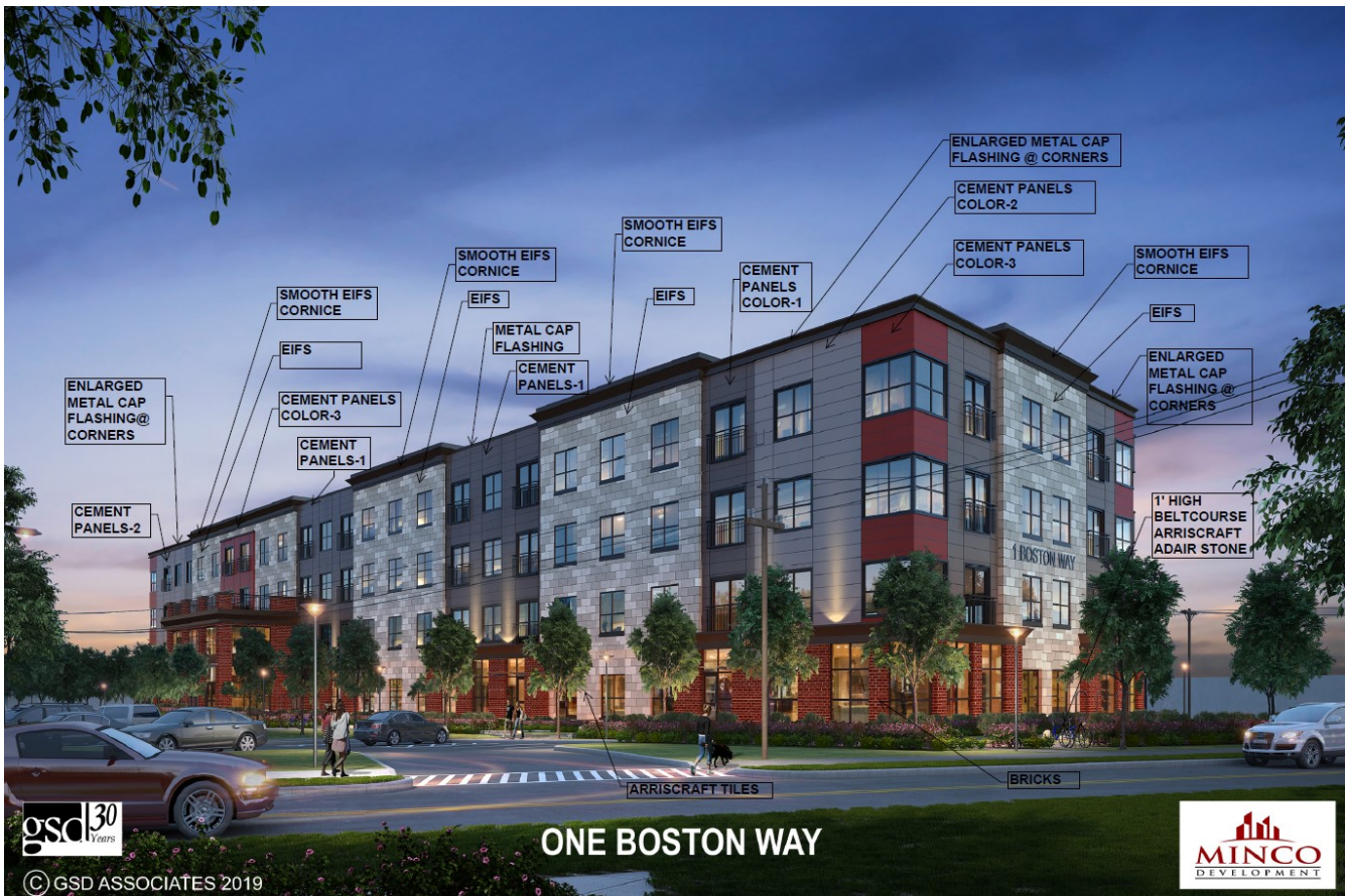
PROPOSED ELEVATION WITH MATERIALS

CLARIFICATION AND DESCRIPTION OF FINISHES. ALL PRODUCTS DESCRIBED BELOW MAY BE REPLACED WITH AN EQUIVALENT PRODUCT: