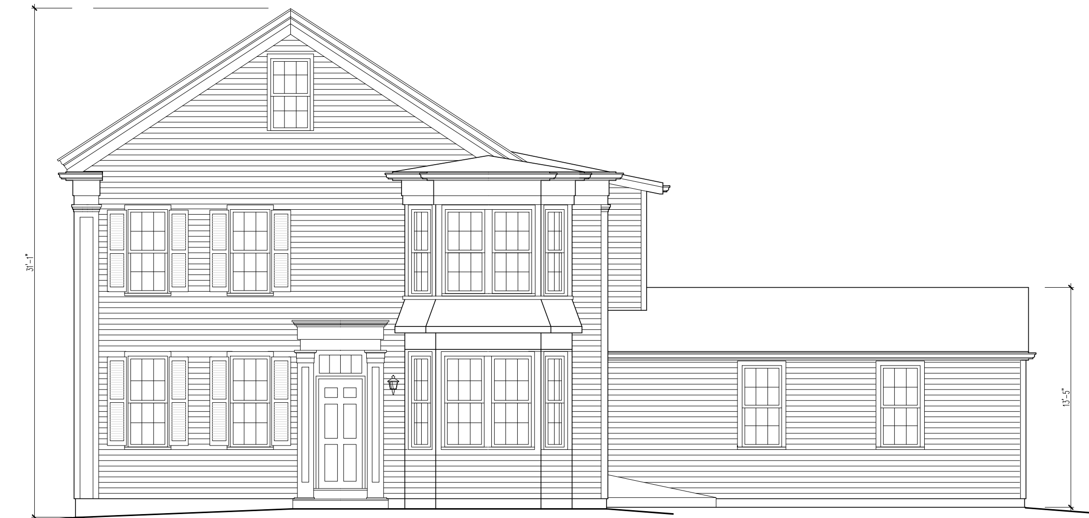
EXISTING RIGHT SIDE ELEVATION

JMA ARCHITECTS + PLANNERS Four New Street, Unit 101 Newburyport, Massachusetts 01950 [phone] 978. 465. 2263 [mobile] 978.621. 0811