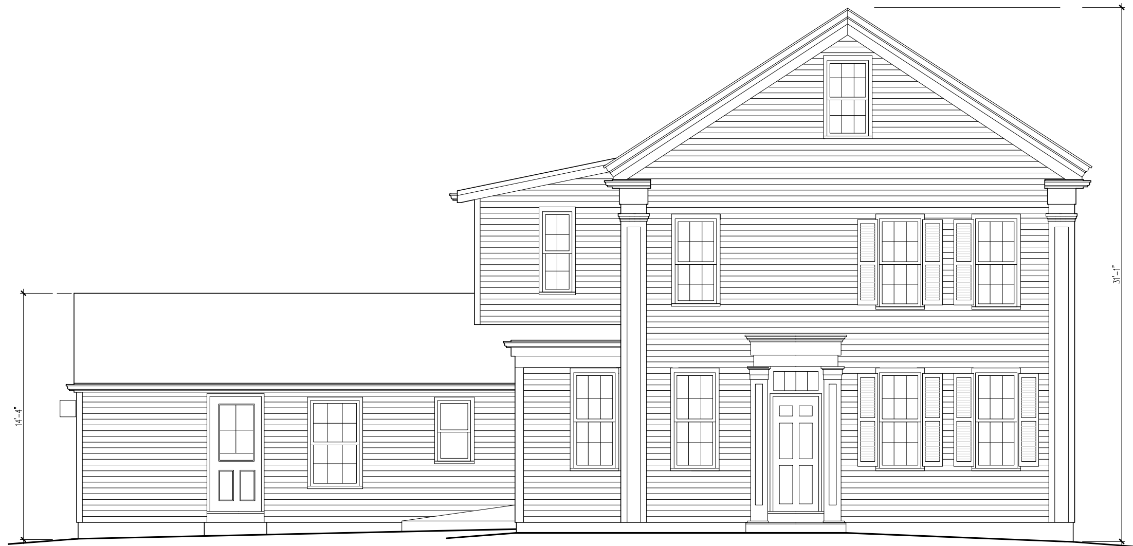
EXISTING LEFT SIDE ELEVATION

JMA ARCHITECTS + PLANNERS Four New Street, Unit 101 Newburyport, Massachusetts 01950 [phone] 978. 465. 2263 [mobile] 978.621. 0811