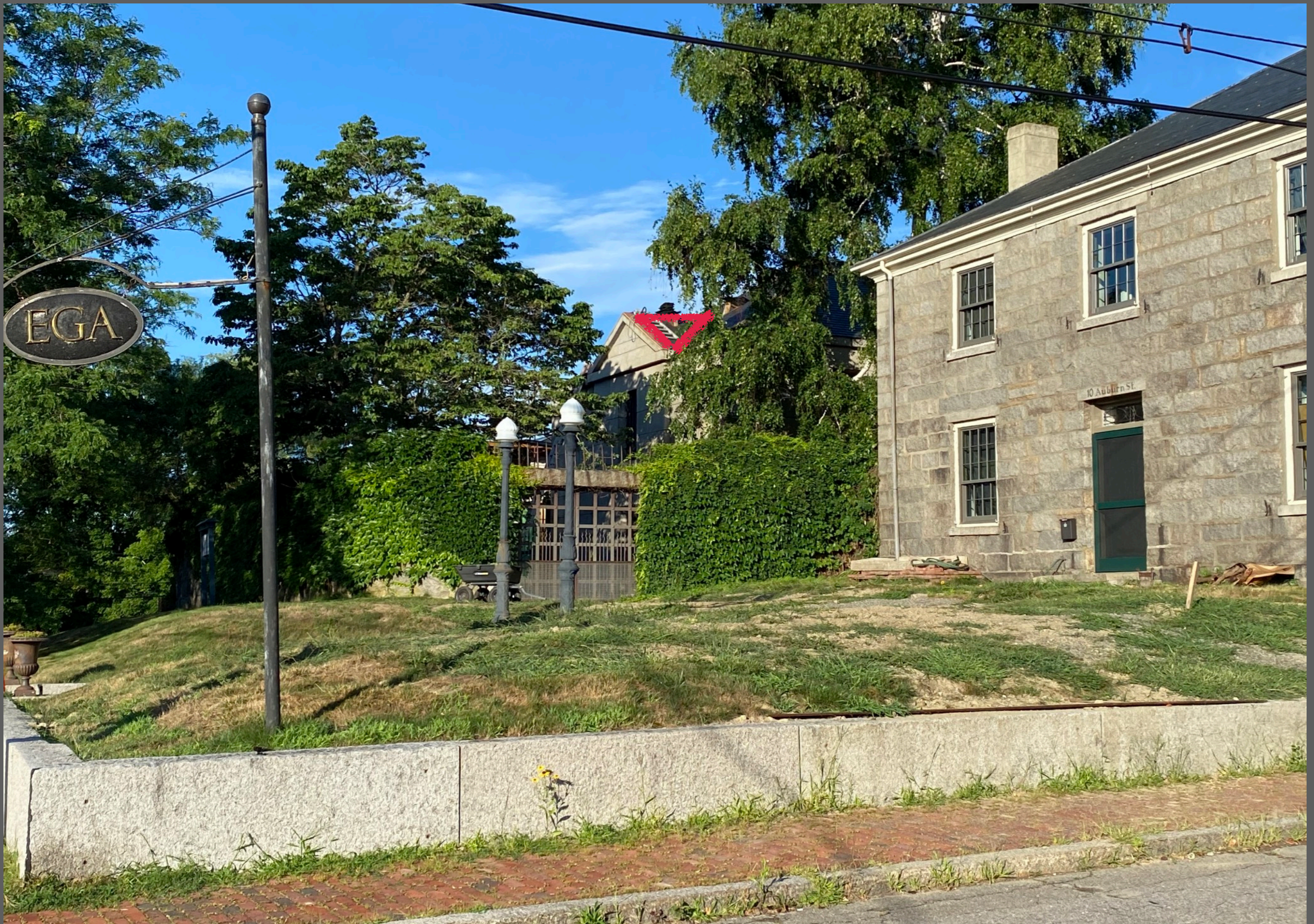
DORMER VISIBLE FROM VERNON STREET