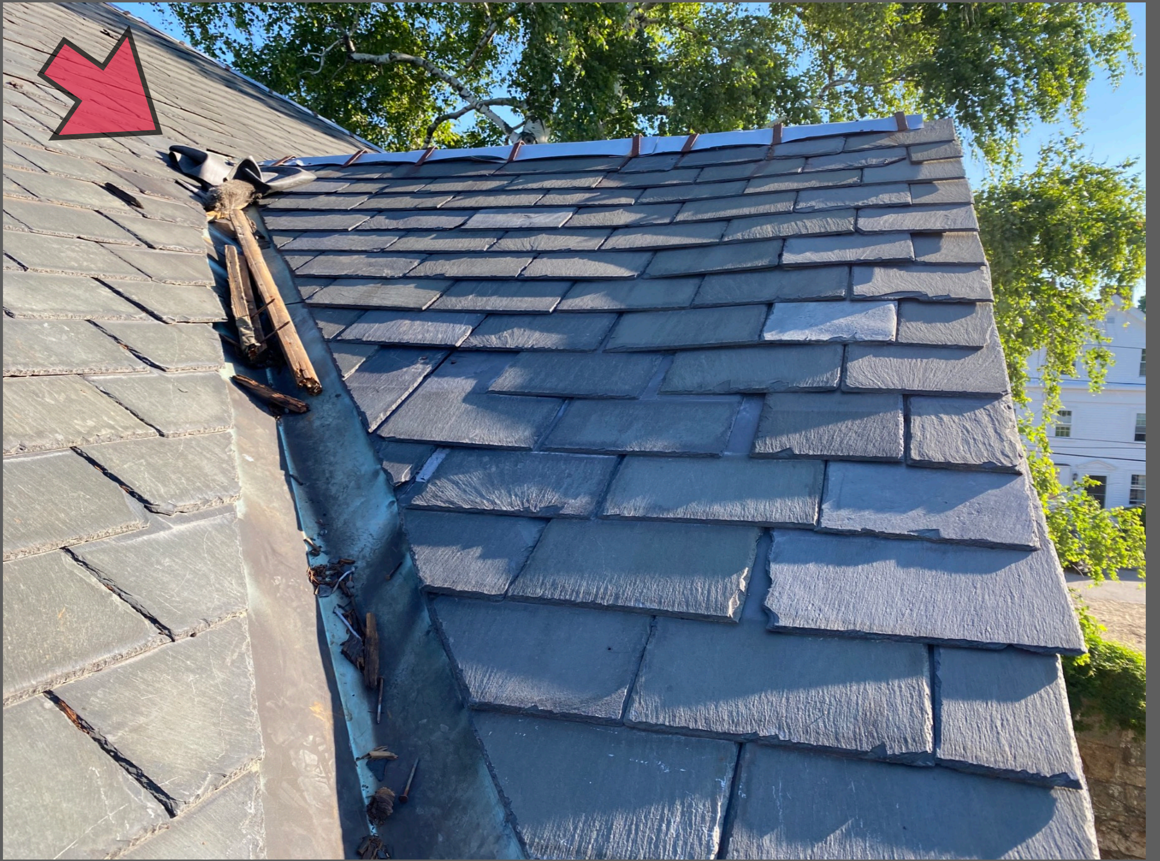
SNOW SLIDES FROM ABOVE DAMAGE ROOF JUNE 19 2020