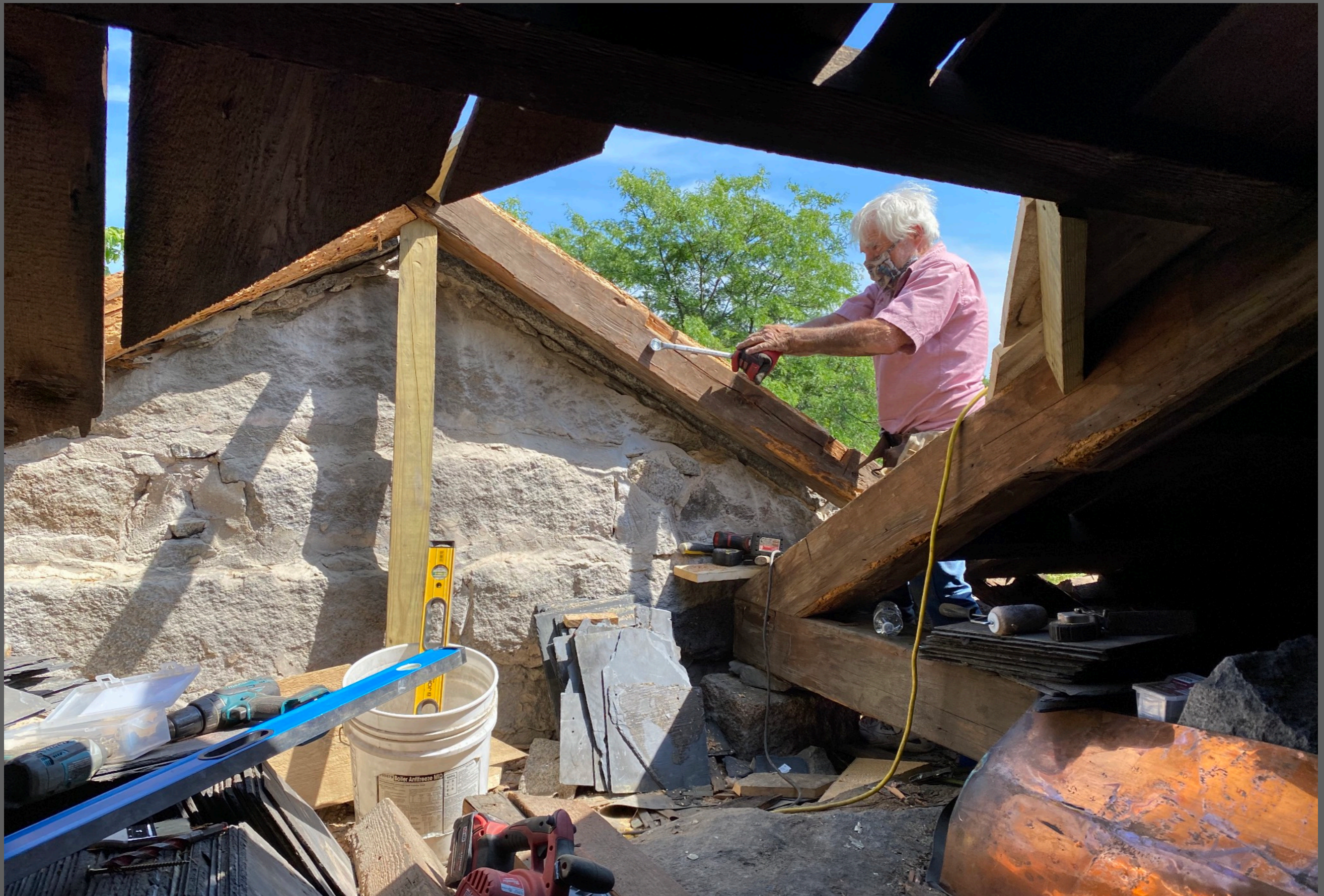
GAOL ATTIC WARREN FASTENING WOOD FRAME TO STONE PEDIMENT