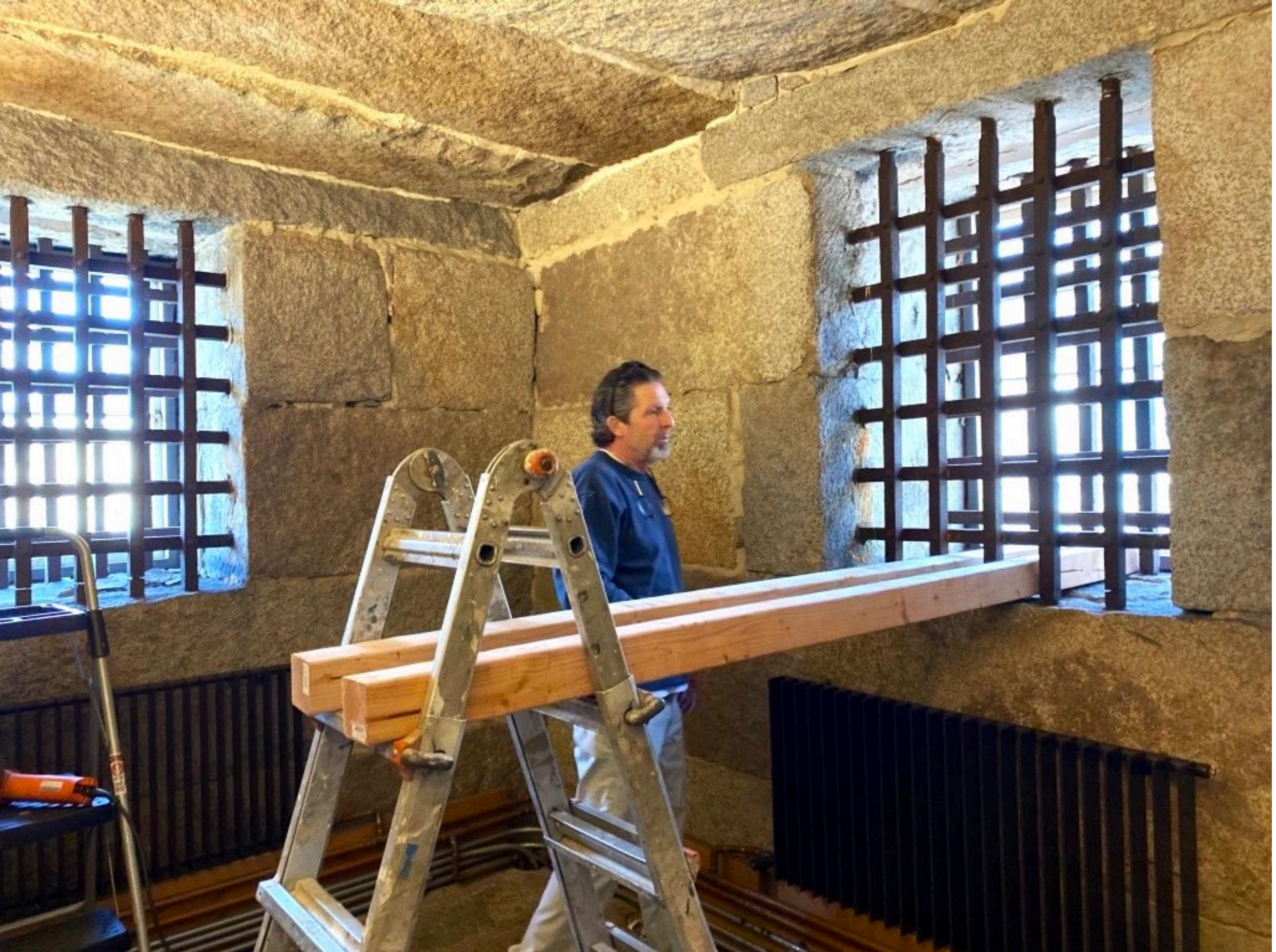
First bars removed from window. Mar 9