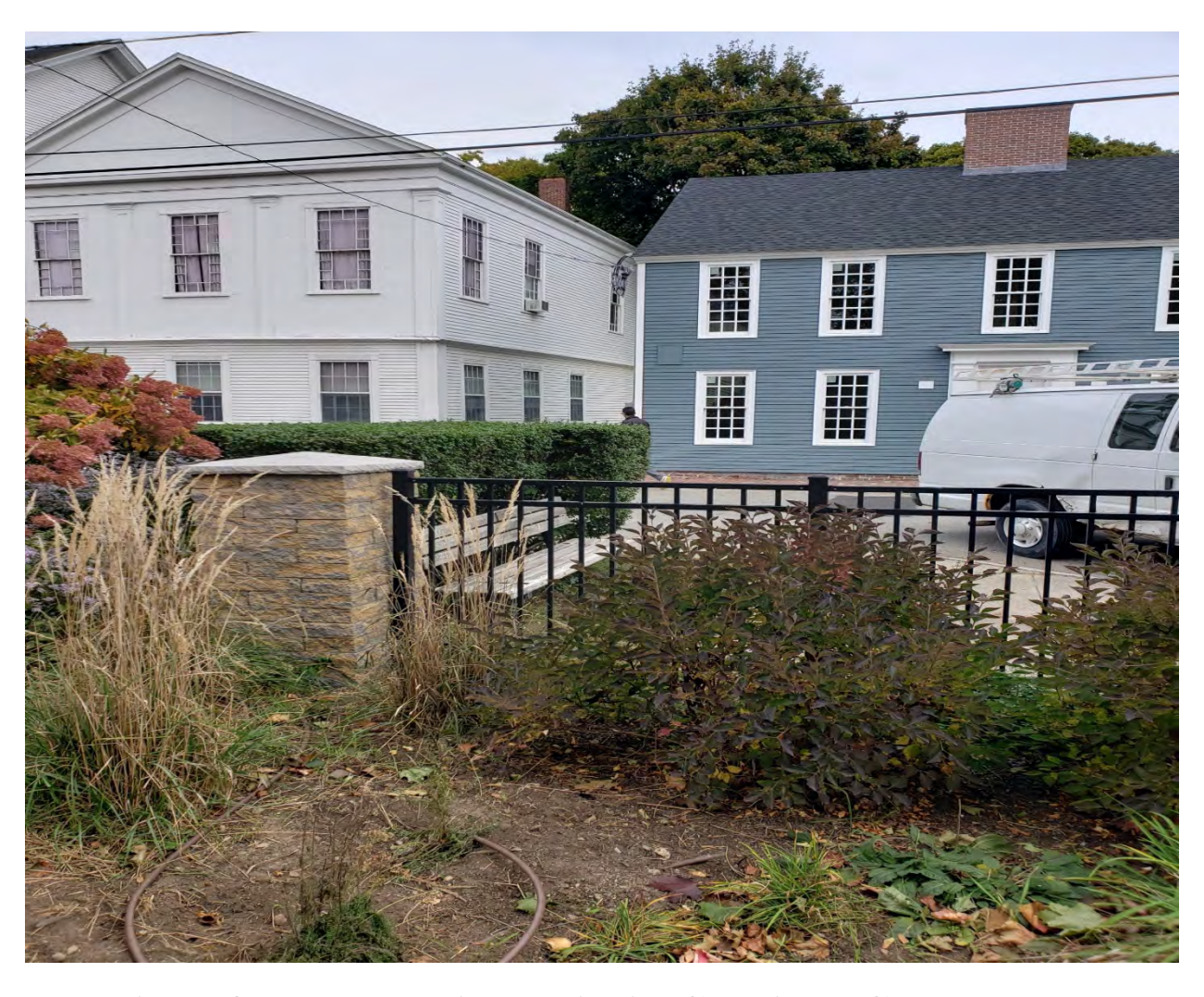
Location of proposed signs within Garrison Gardens, landscaped border