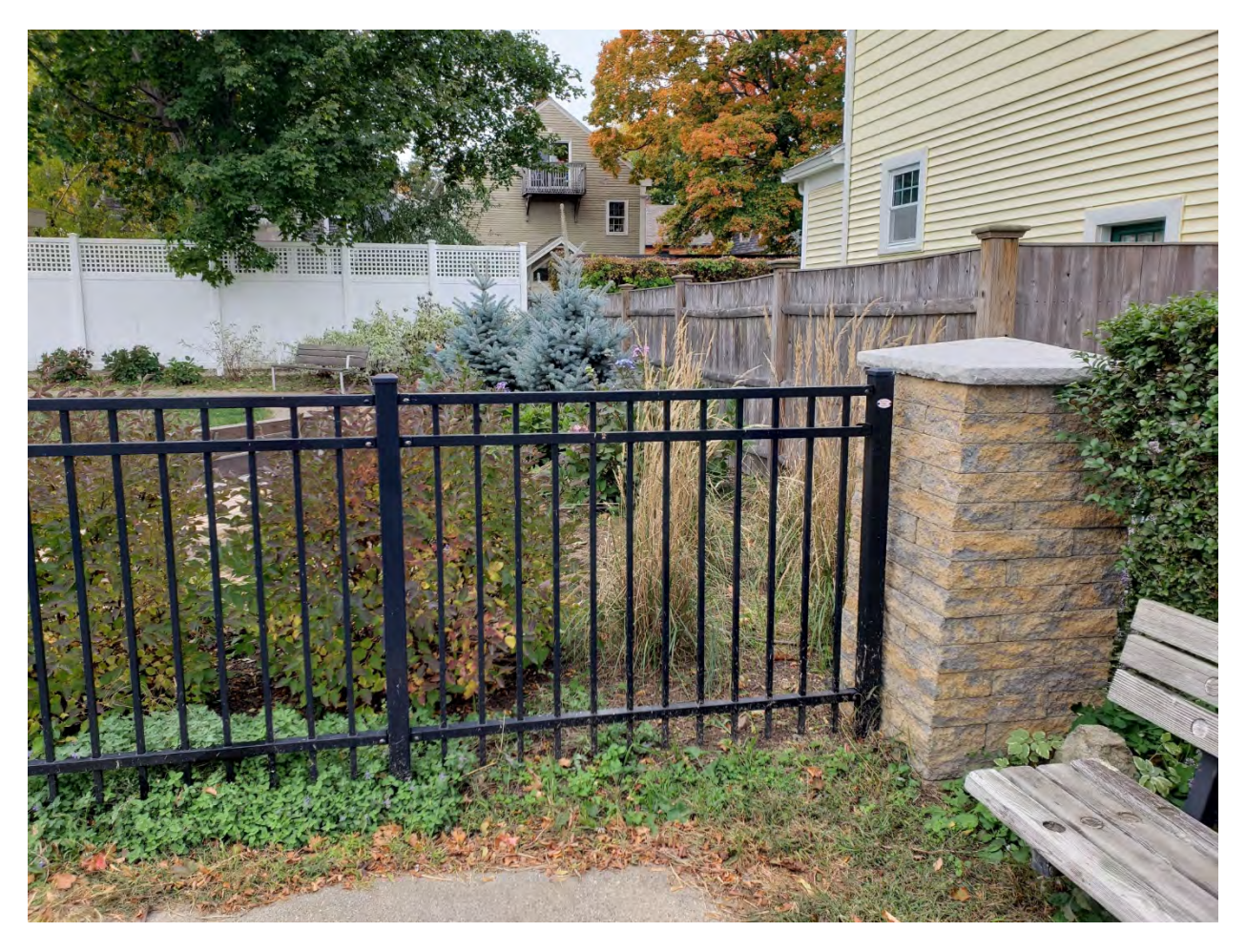
Looking back towards Garrison Gardens where the signs will be located