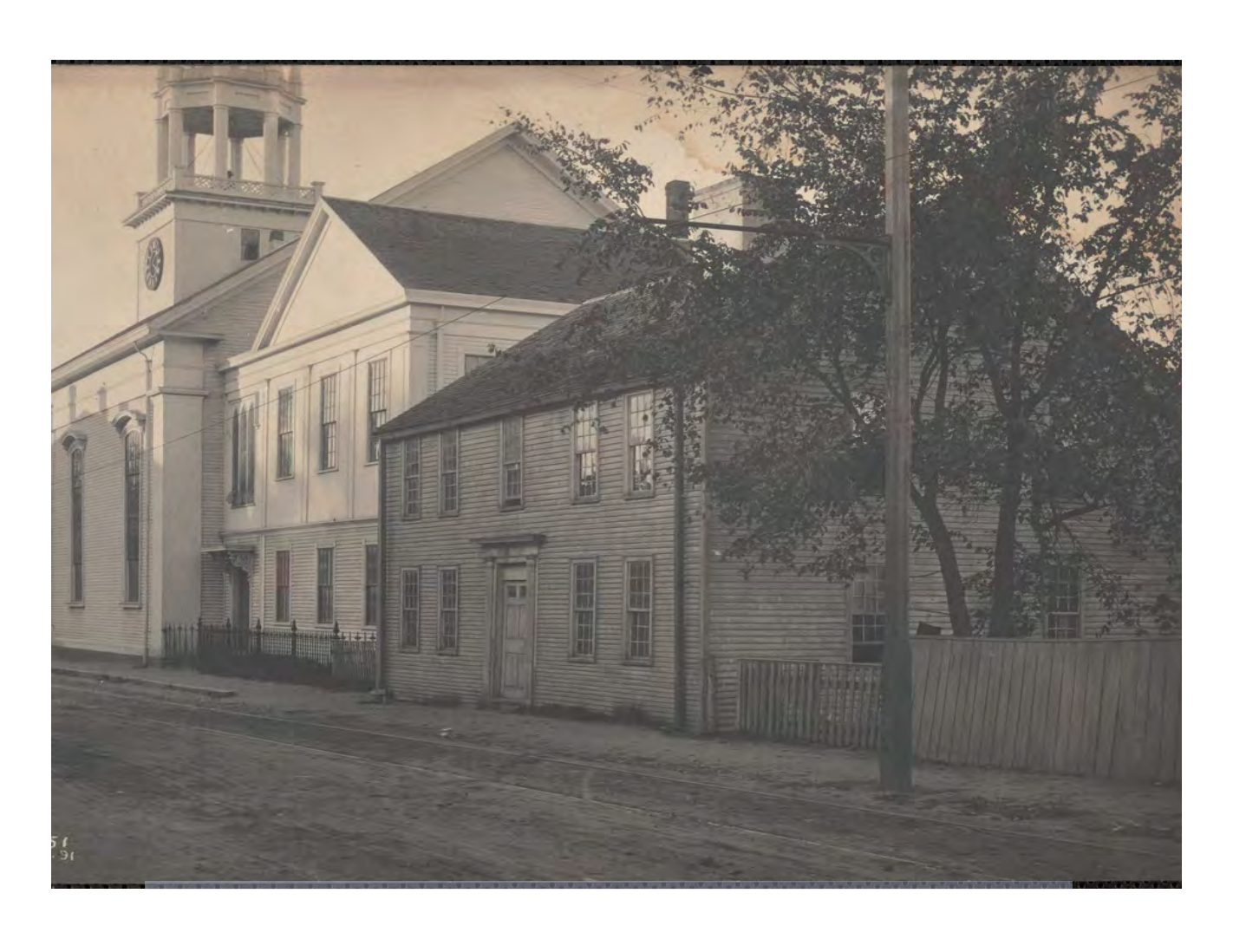
William Lloyd Garrison Birthplace, 3-5 School Street, Historical Photo