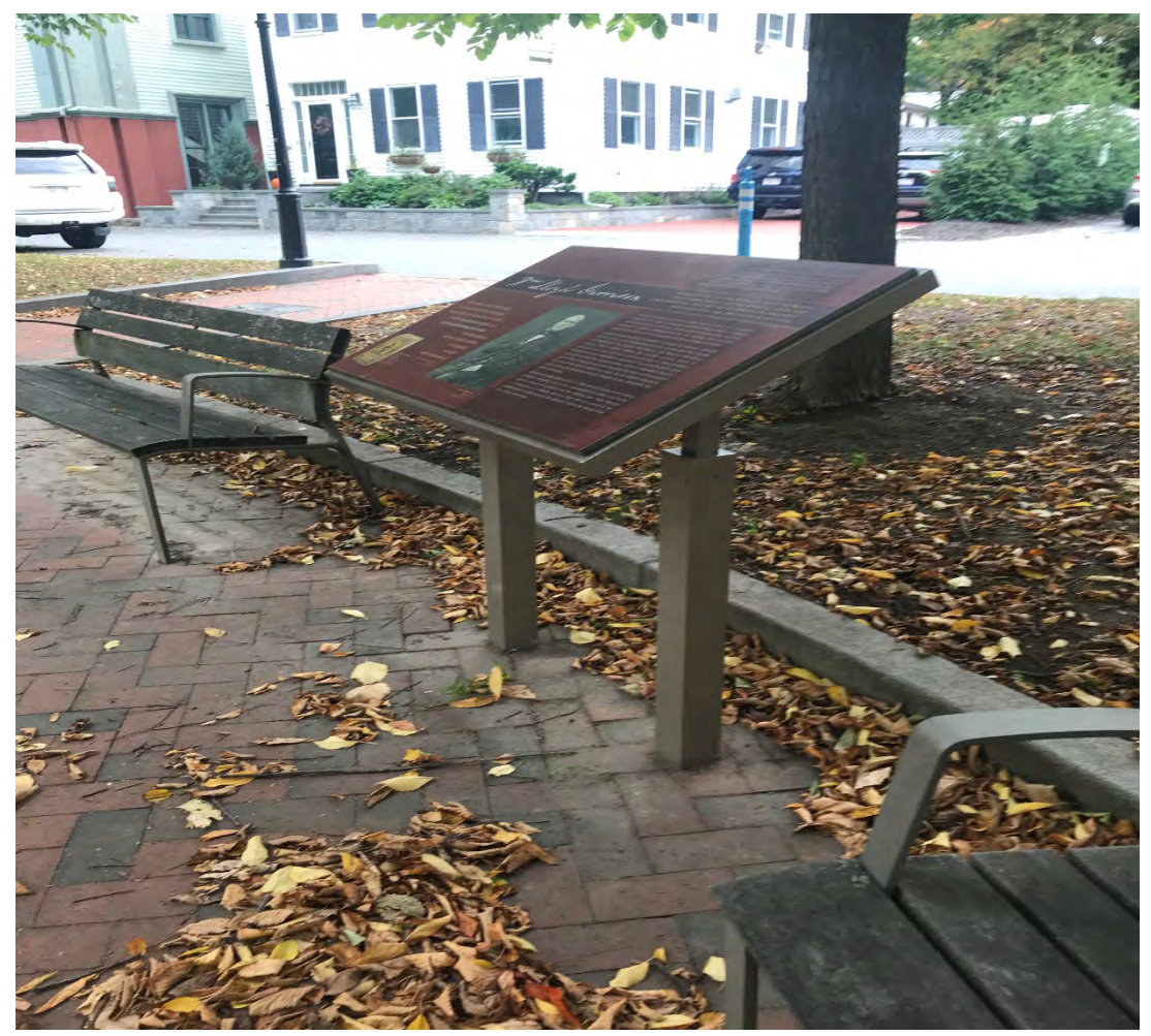
Style of sign to be installed at Garrison Gardens