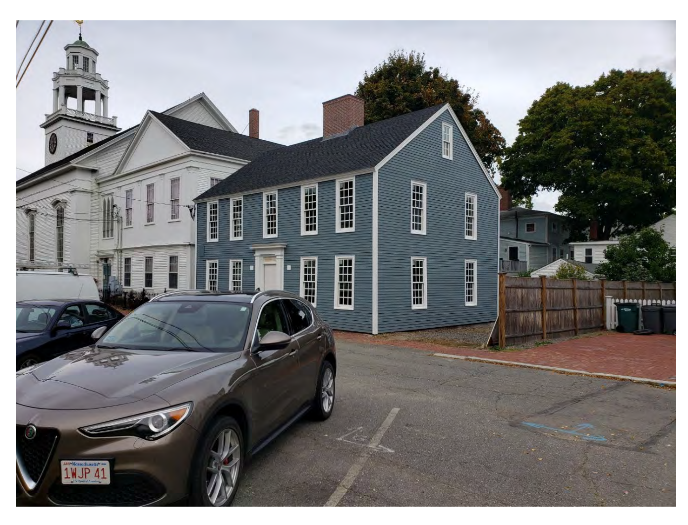
3-5 School Street after renovation