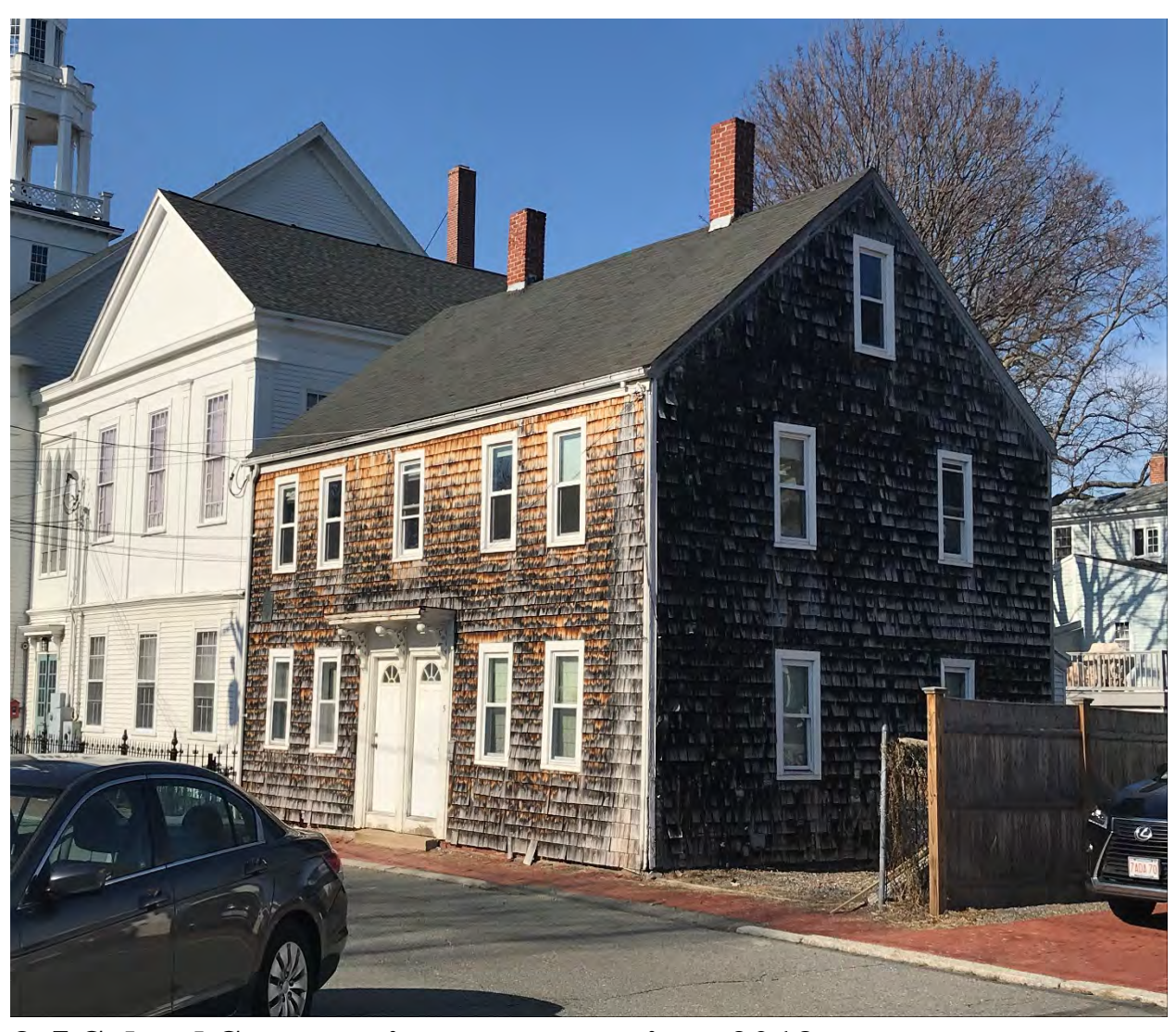
3-5 School Street prior to renovation, 2019