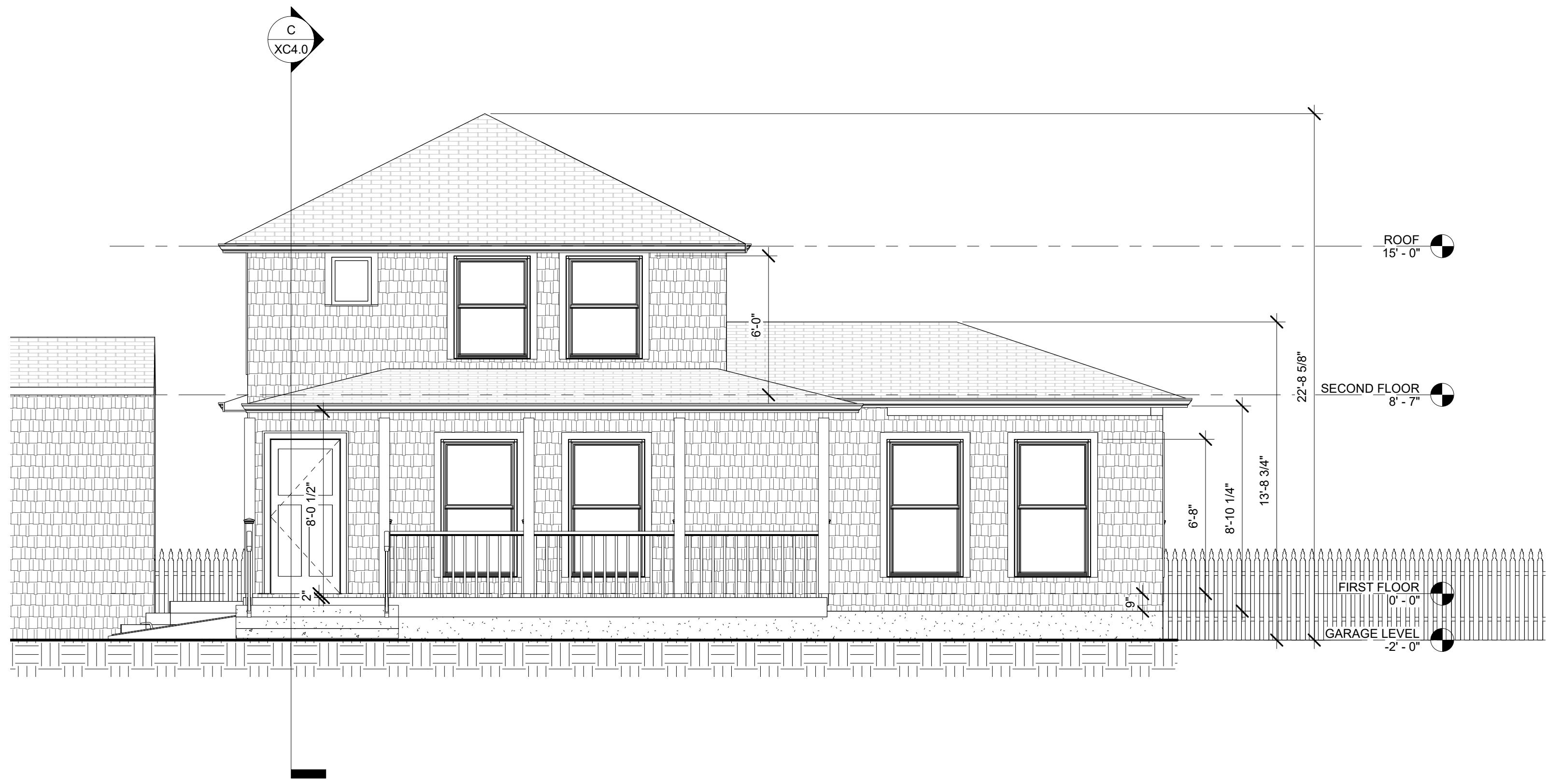
1 EXISTING FRONT ELEVATION XC5.0 1/4" = 1'-0"