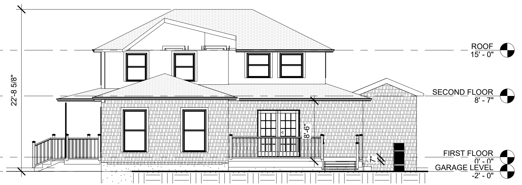
1 EXISTING SIDE ELEVATION. XC5.1 1/8" = 1'-0"