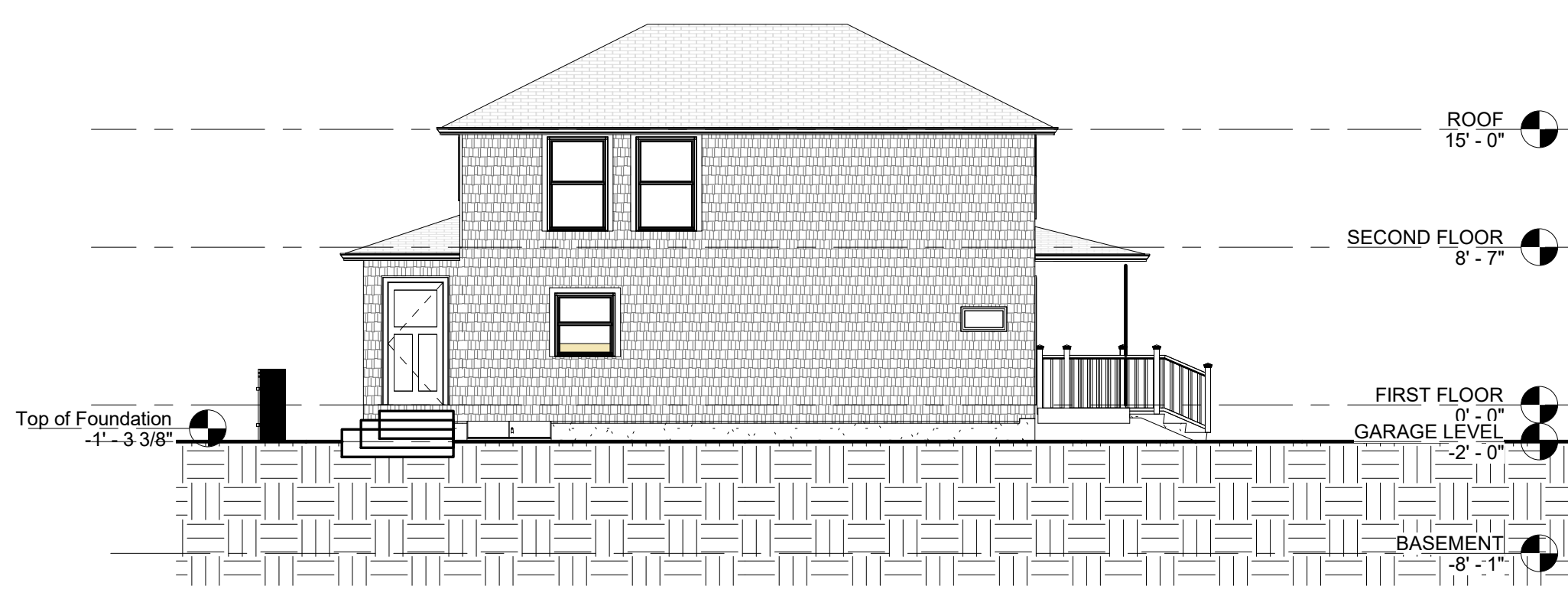
2 EXISTING SIDE ELEVATION XC5.1 1/8" = 1'-0"