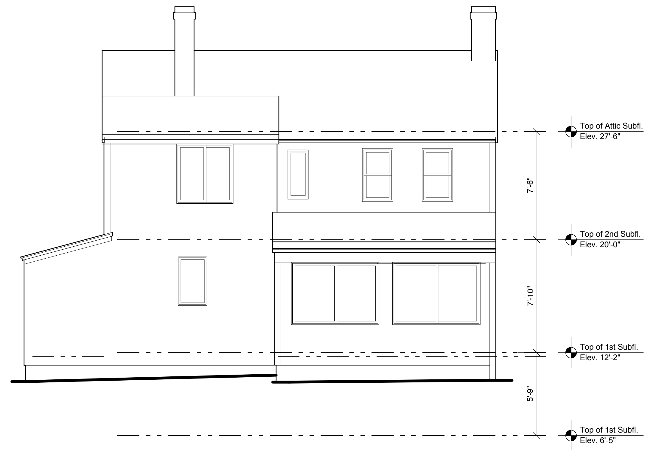
Existing North Elevation Scale: 1/4" = 1'-0"