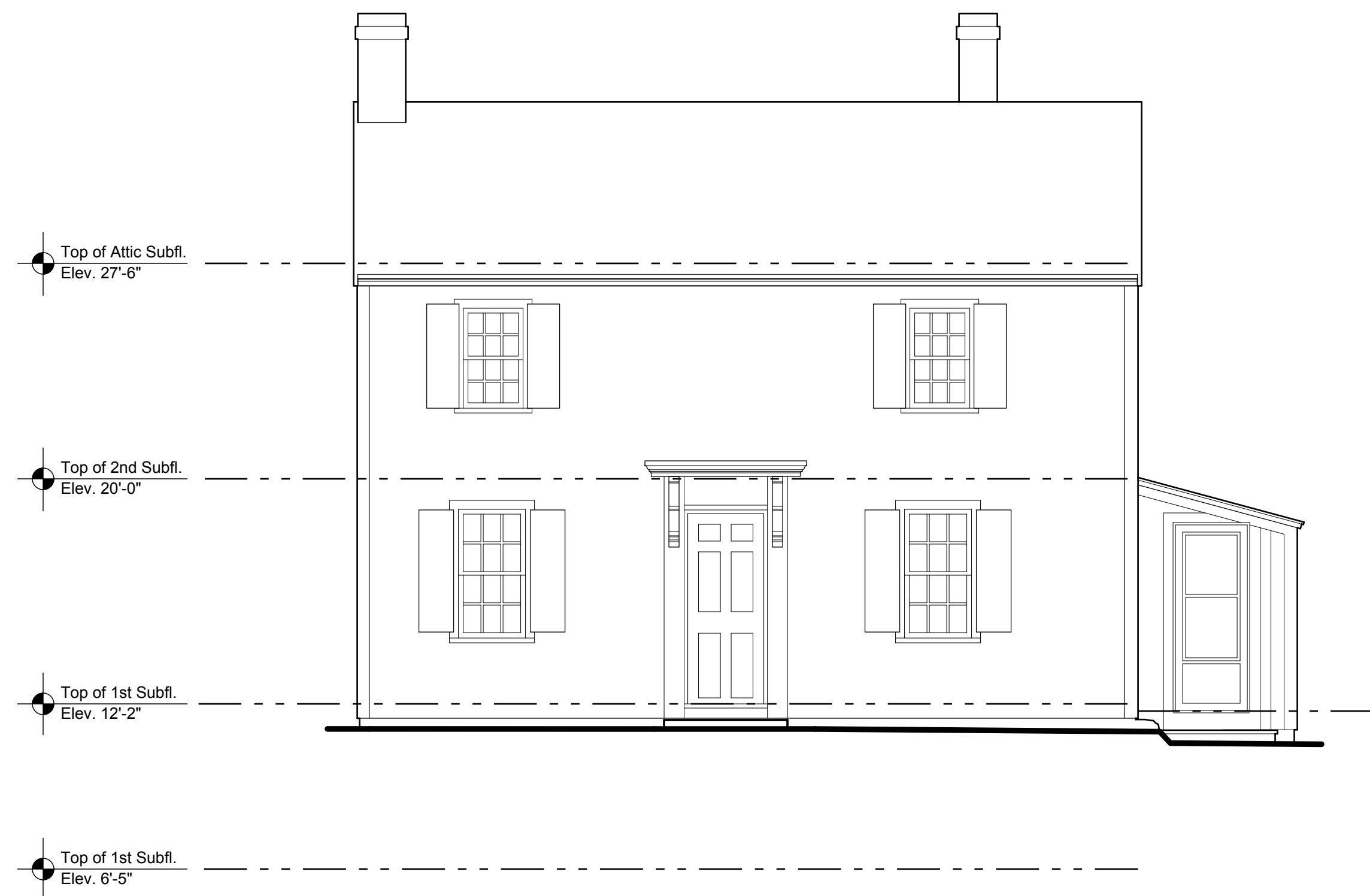
Existing South Elevation Scale: 1/4" = 1'-0"