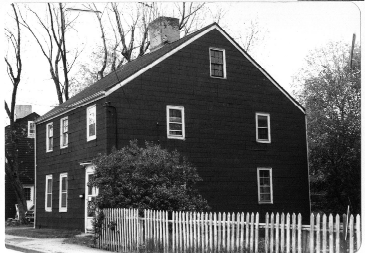
18 UNION ST. (NWB.702)