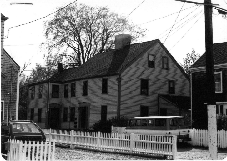
182 WATER ST. (NWB.2502)