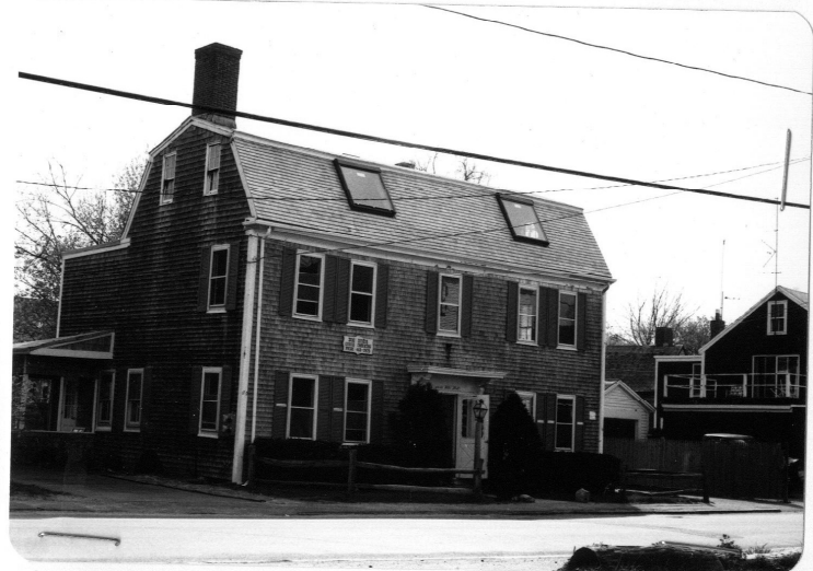
168-170 WATER ST. (NWB.724)