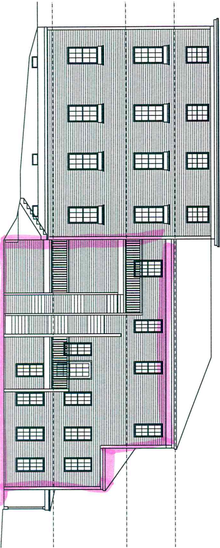
RIGHT SIDE ELEVATION SCALE 1/8" = 1'-0"