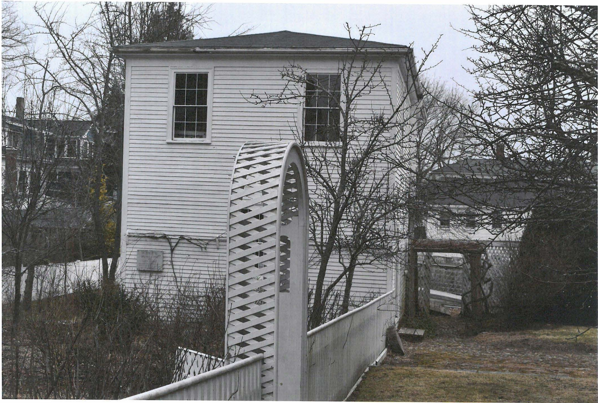
CUSHING HOUSE - CARRIAGE BARN - 98 HIGH ST.