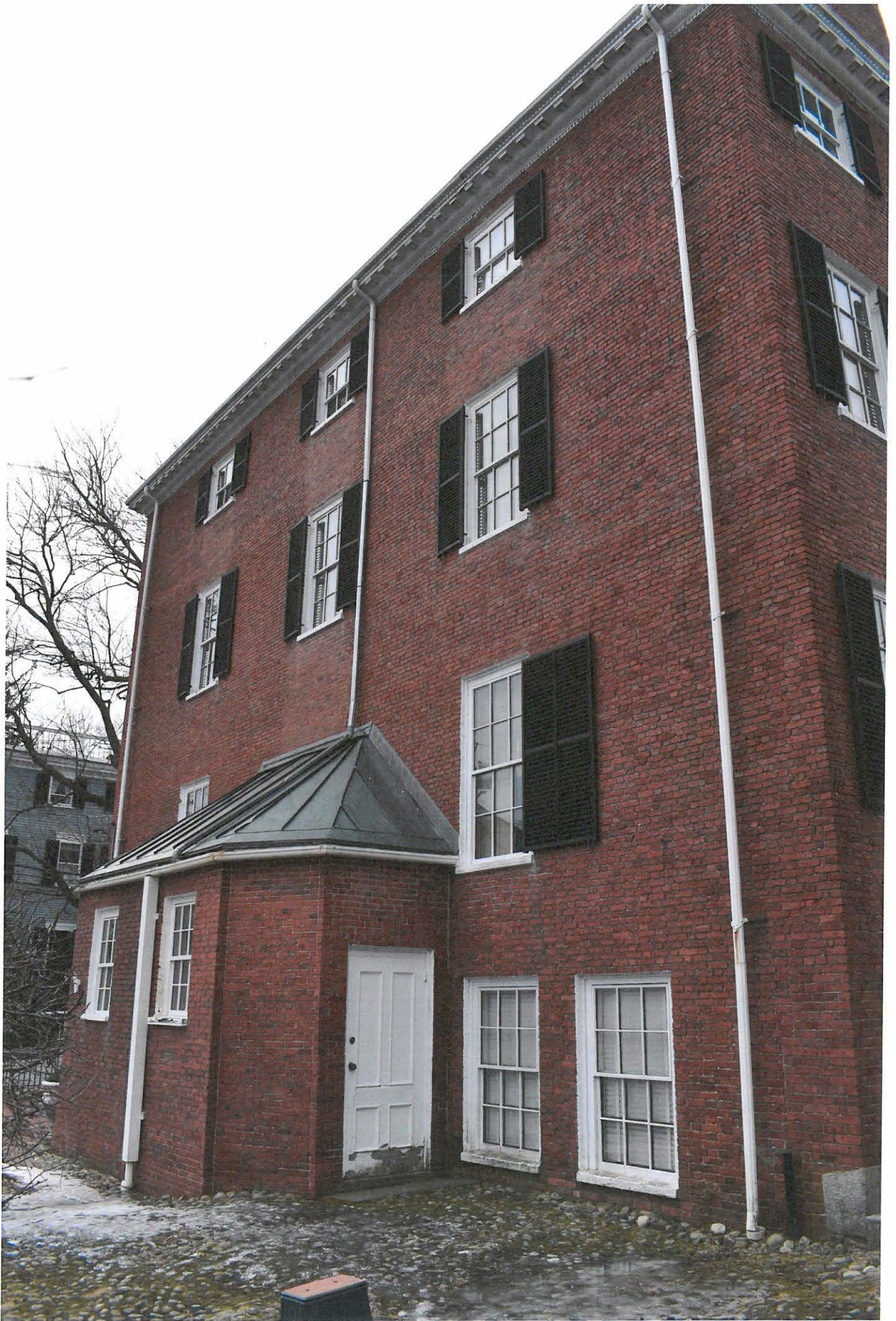
CUSHING HOUSE - NORTH FACADE