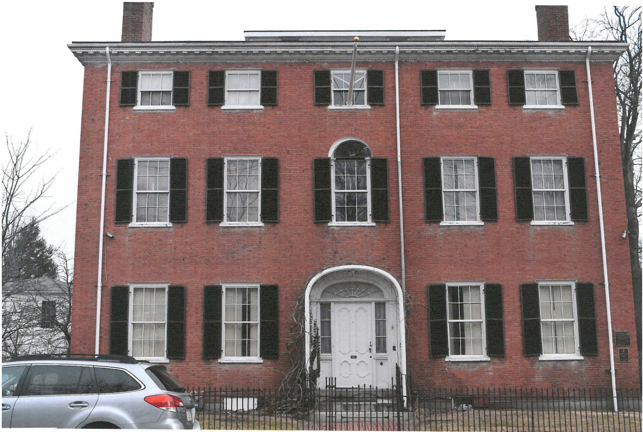
CUSHING HOUSE - SOUTH FACADE - 98 HIGH ST