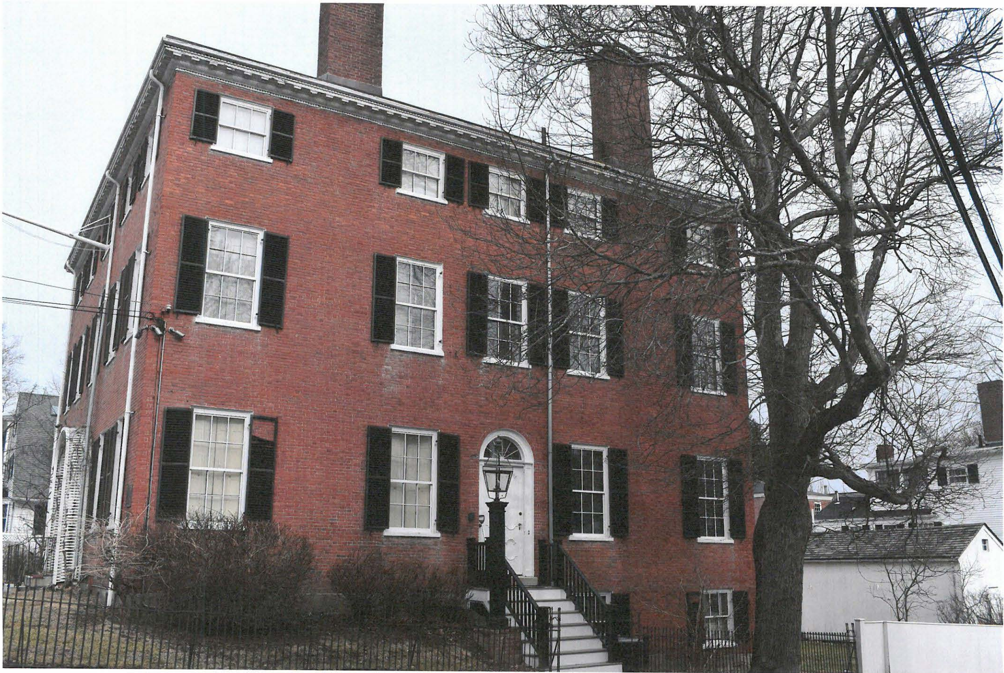
CUSHING HOUSE - EAST FACADE