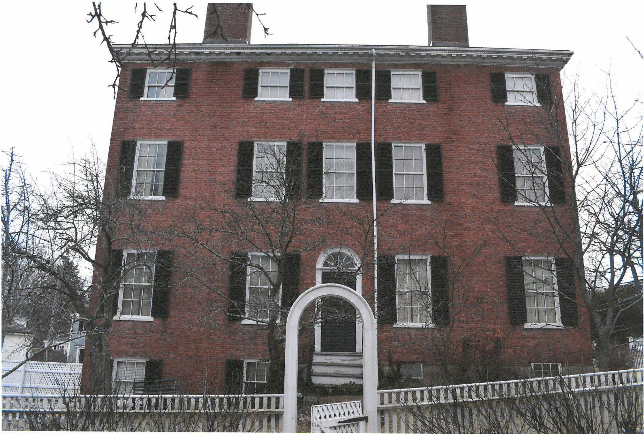
CUSHING HOUSE - WEST FACADE