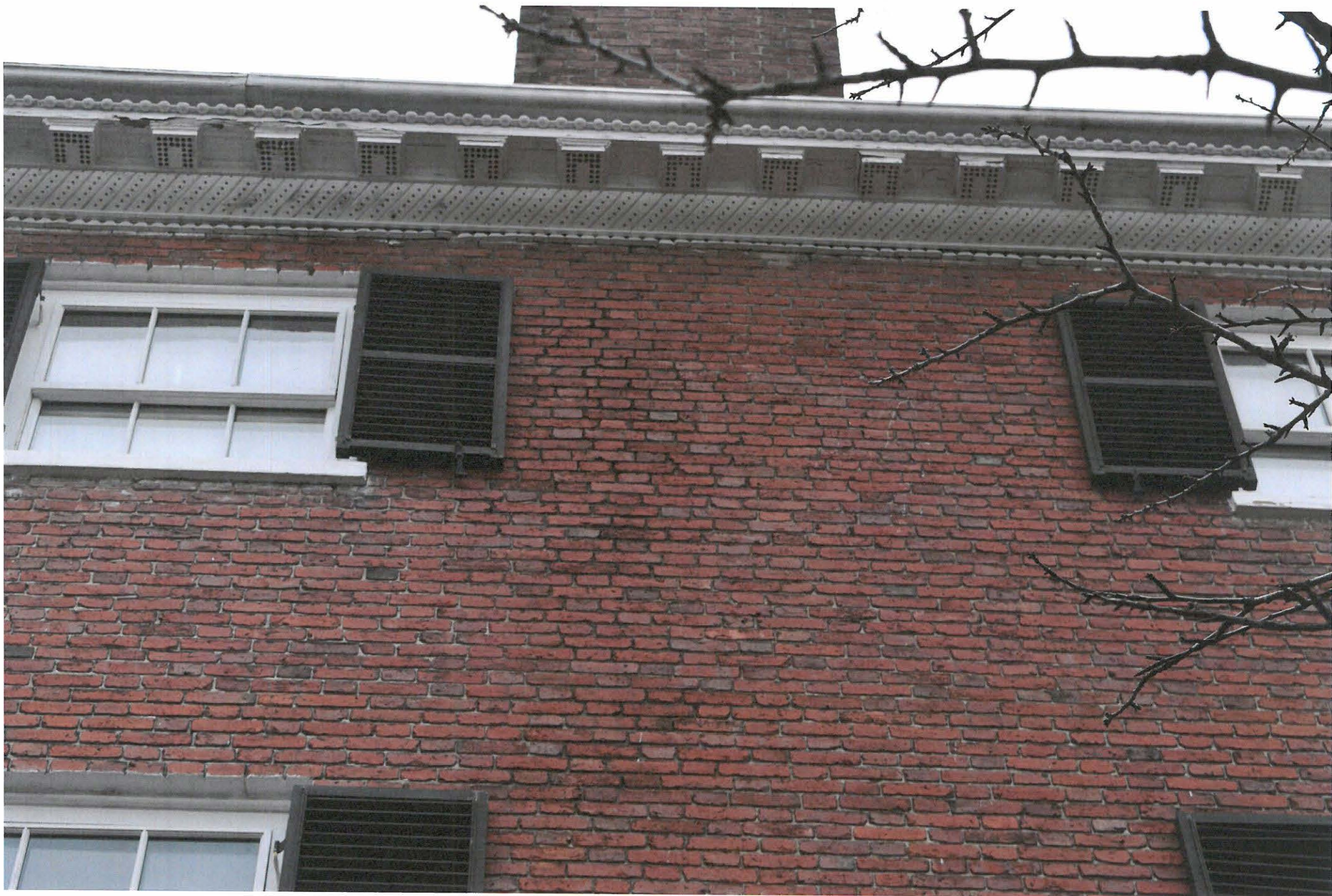
CUSHING HOUSE-CORNICE DETAIL - 98 HIGH ST.