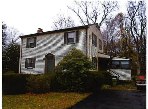
( https://images.vgsi.com/photos/NewburyportMAPhotos/\01\01\19\92.jpg )