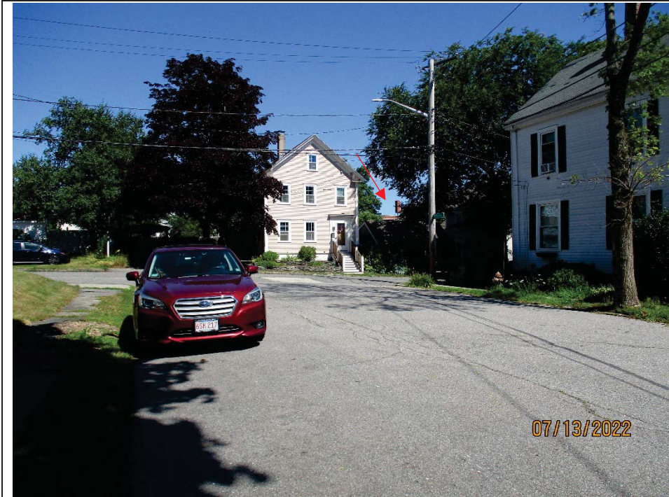
13. View looking northwest towards Subject Property (red arrow) from APE-VE at a distance of approximately 500 feet.

Approved by OMB 3060-1039 See instructions for public burden estimates