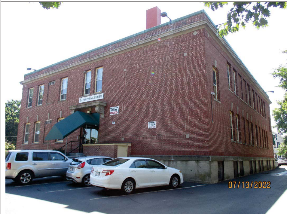
4. View of Subject Property, Albert Currier School (NWB.1674) looking east.

Applicant's Name: T-Mobile USA Project Name: Forrester Prof Bldg (L600) Project Number: 4BNI531C