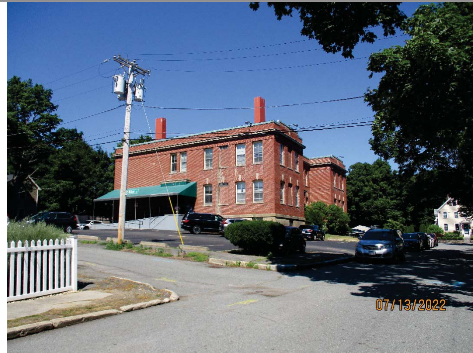
12. View from Newburyport Historic District (NWB.L) looking northwest towards Subject Property (located within district) at a distance of approximately 150 feet.

Applicant's Name: T-Mobile USA Project Name: Forrester Prof Bldg (L600) Project Number: 4BNI531C