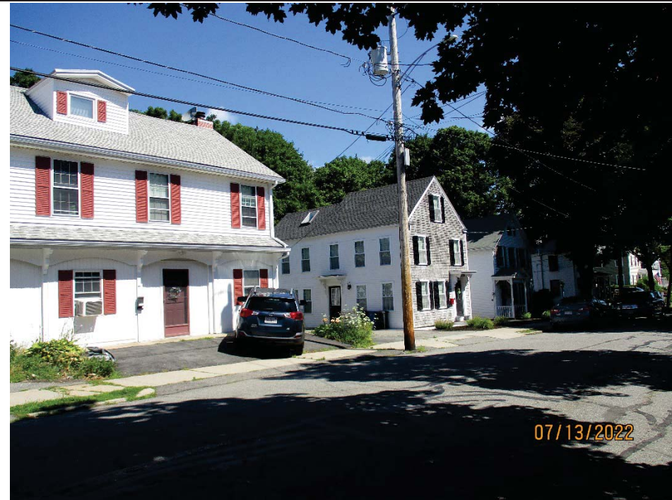
11. View of Newburyport Historic District (NWB.L) looking northeast along Forrester Street.

Approved by OMB 3060-1039 See instructions for public burden estimates