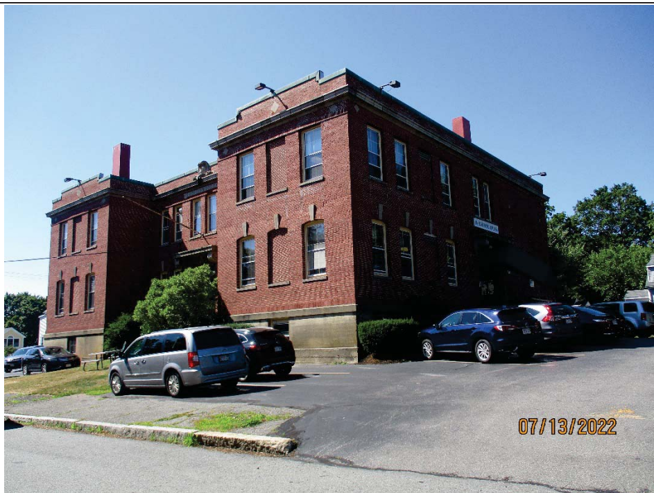
2. View of Subject Property, Albert Currier School (NWB.1674) looking south.

Applicant's Name: T-Mobile USA Project Name: Forrester Prof Bldg (L600) Project Number: 4BNI531C