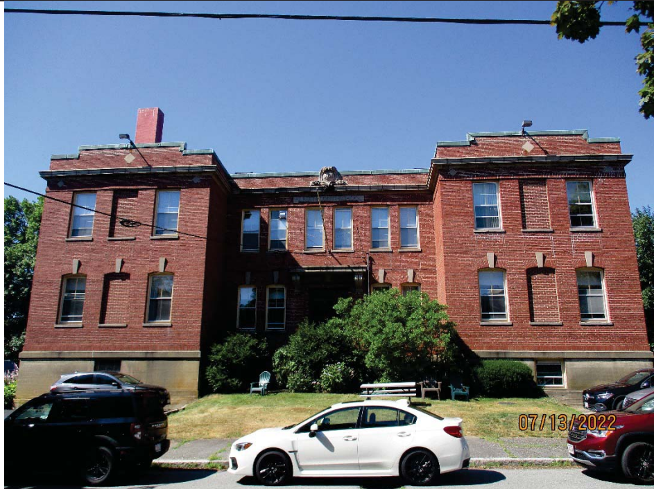
1. View of Subject Property, Albert Currier School (NWB.1674) looking southwest. Located within the Newburyport Historic District, NWB.L/84002411

Approved by OMB 3060-1039 See instructions for public burden estimates