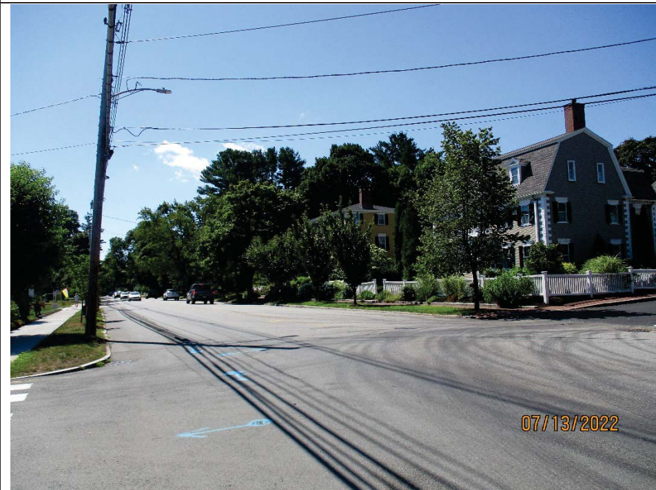
10. View of Newburyport Historic District (NWB.L) looking southeast along High Street.

Applicant's Name: T-Mobile USA Project Name: Forrester Prof Bldg (L600) Project Number: 4BNI531C