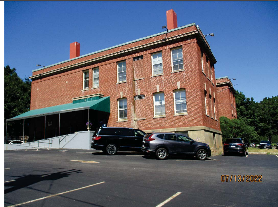
3. View of Subject Property, Albert Currier School (NWB.1674) looking west.

Approved by OMB 3060-1039 See instructions for public burden estimates