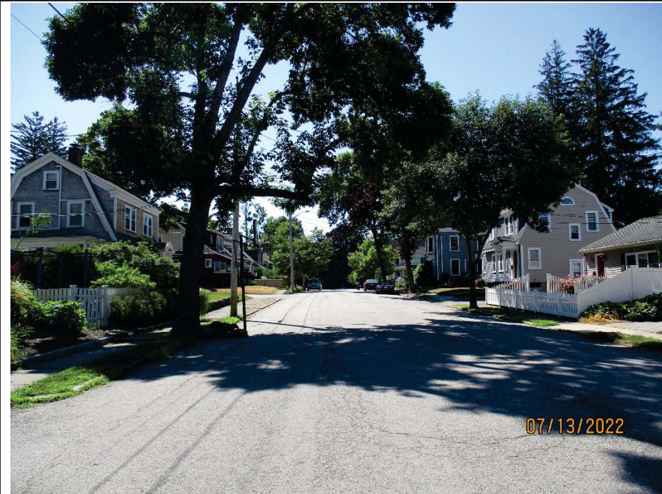
9. View of Newburyport Historic District (NWB.L) looking southeast along Payson Street.

Approved by OMB 3060-1039 See instructions for public burden estimates