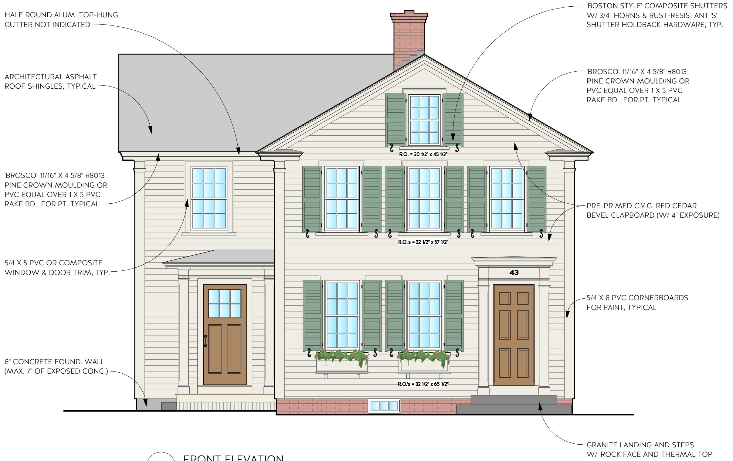
1 FRONT ELEVATION Scale: 1/4" = 1'-0"