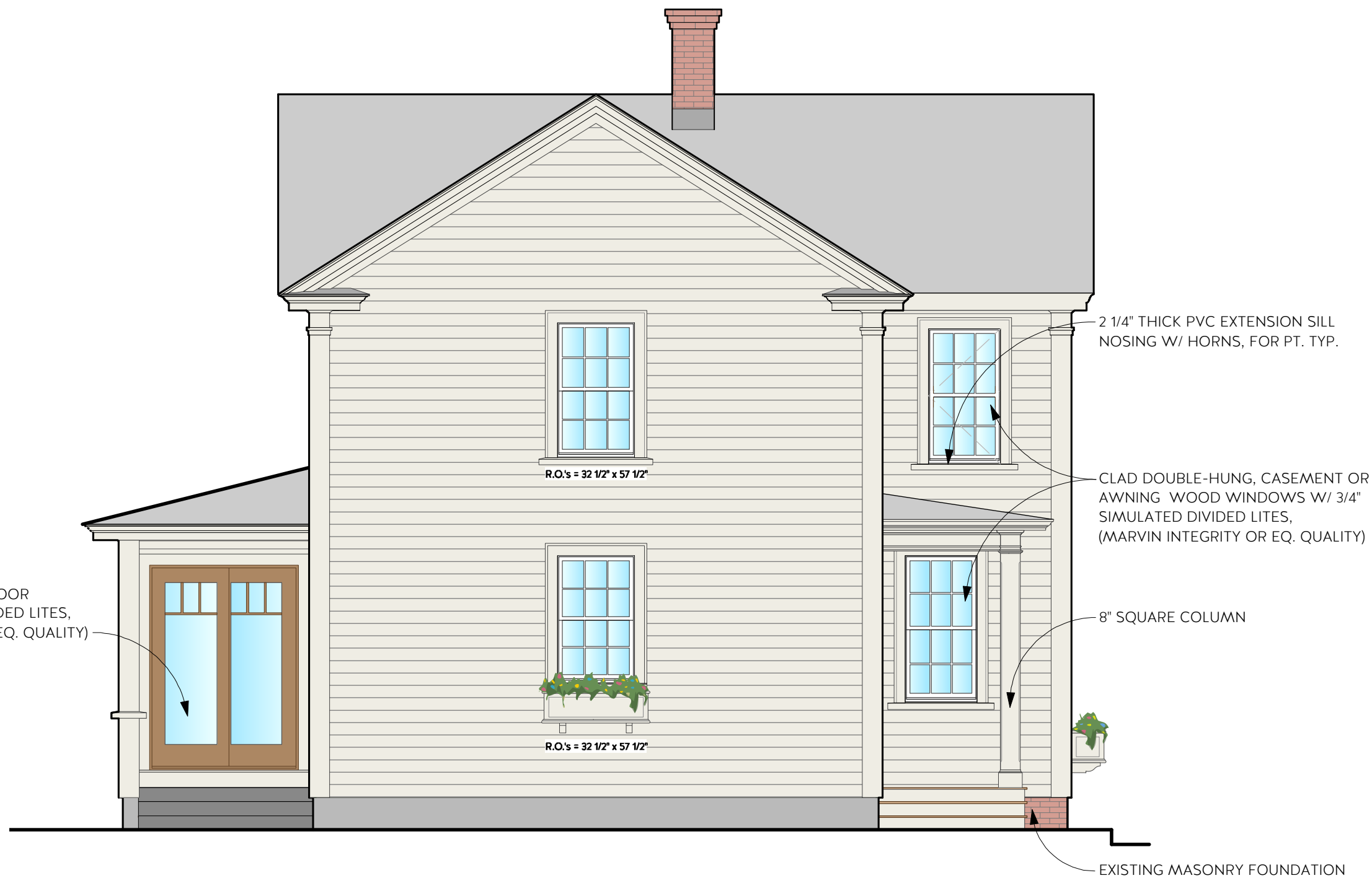
1 LEFT SIDE ELEVATION Scale: 1/4" = 1'-0"

COPYRIGHT 2017 SCOTT M. BROWN, ARCHITECT