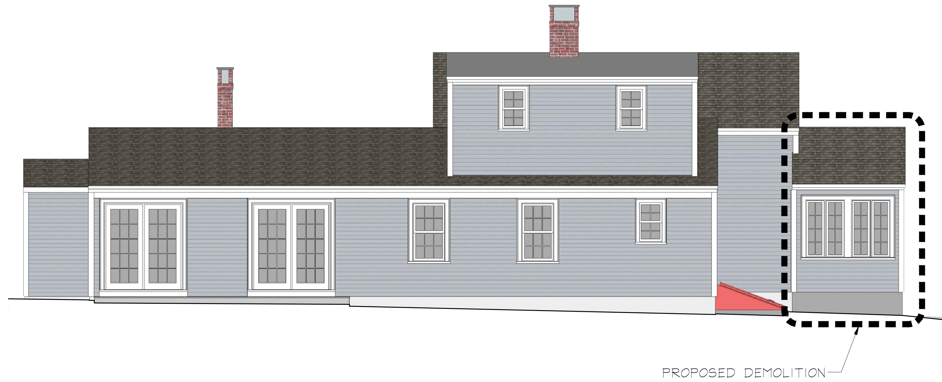
REAR ELEVATION (SOUTHERLY)