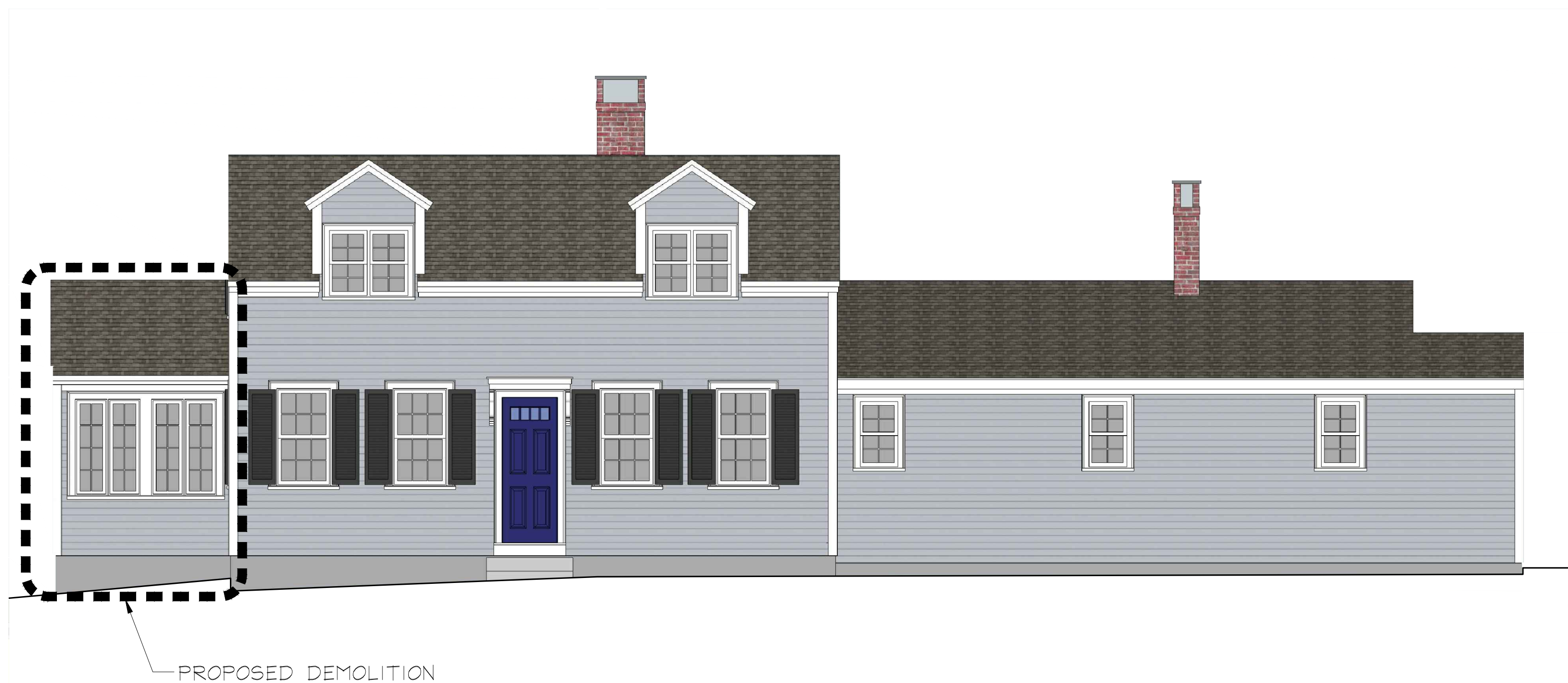
FRONT ELEVATION (NORTHERLY)