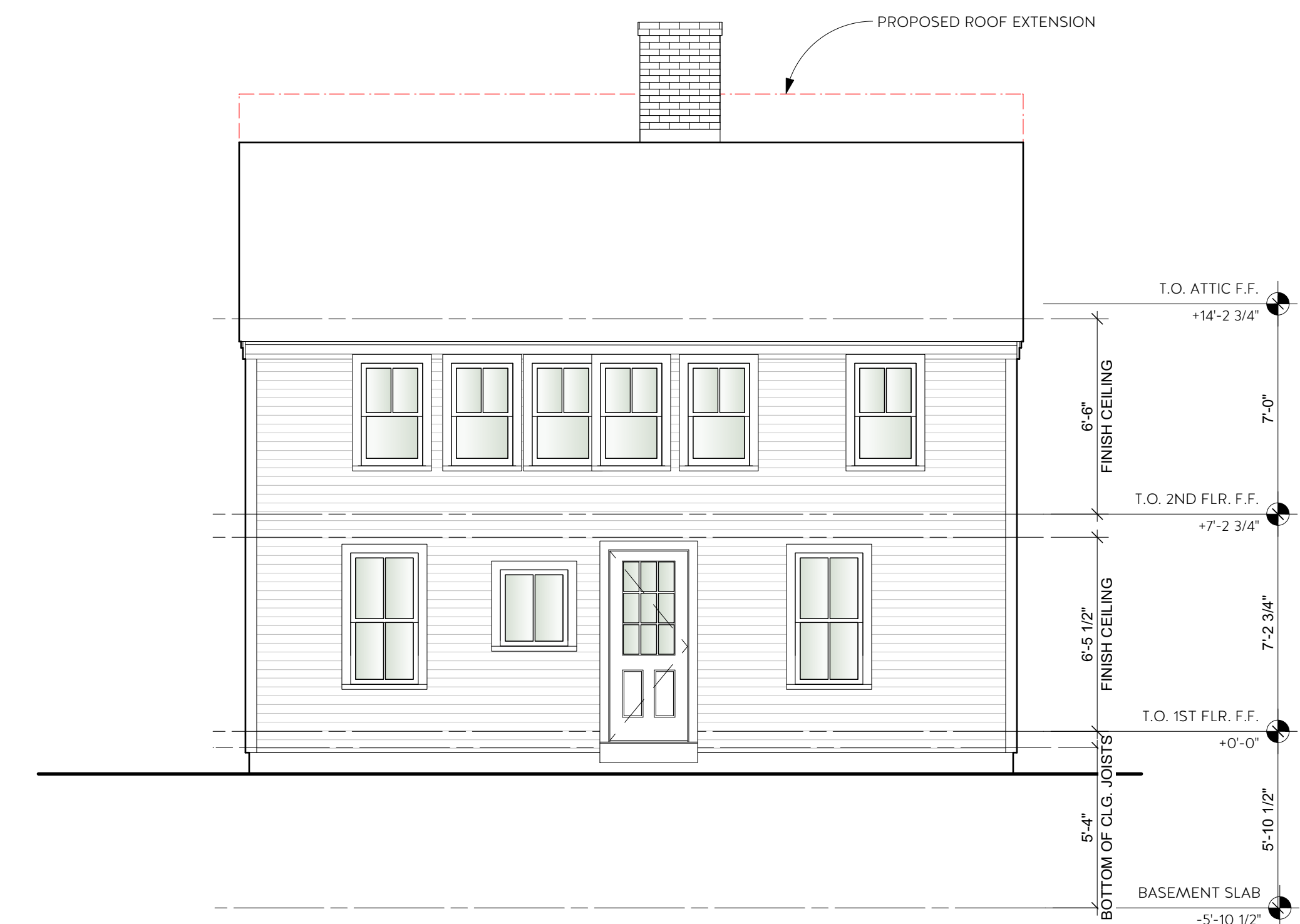
3 REAR ELEVATION Scale: 1/4" = 1'-0"