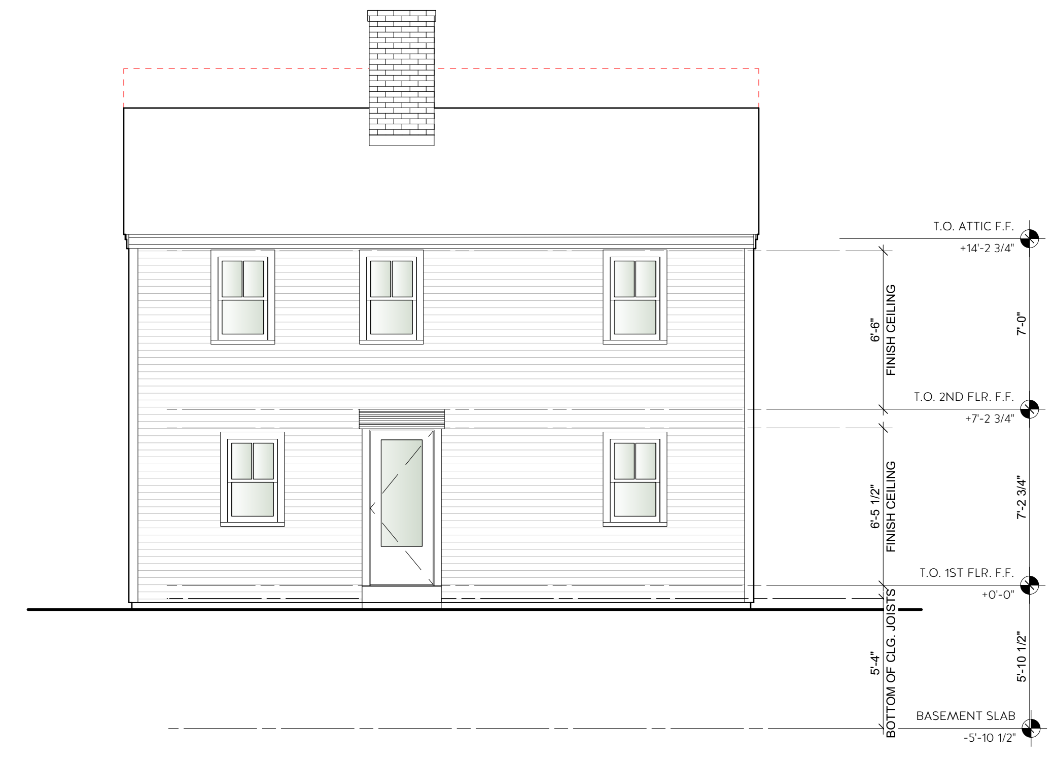
1 FRONT ELEVATION Scale: 1/4" = 1'-0"