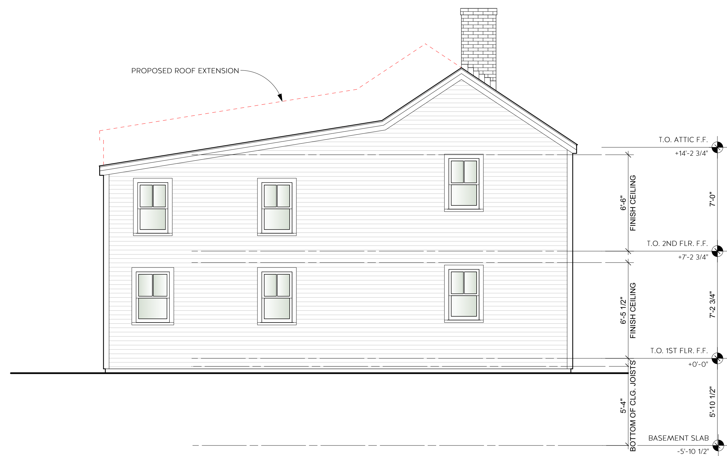
2 LEFT ELEVATION Scale: 1/4" = 1'-0"