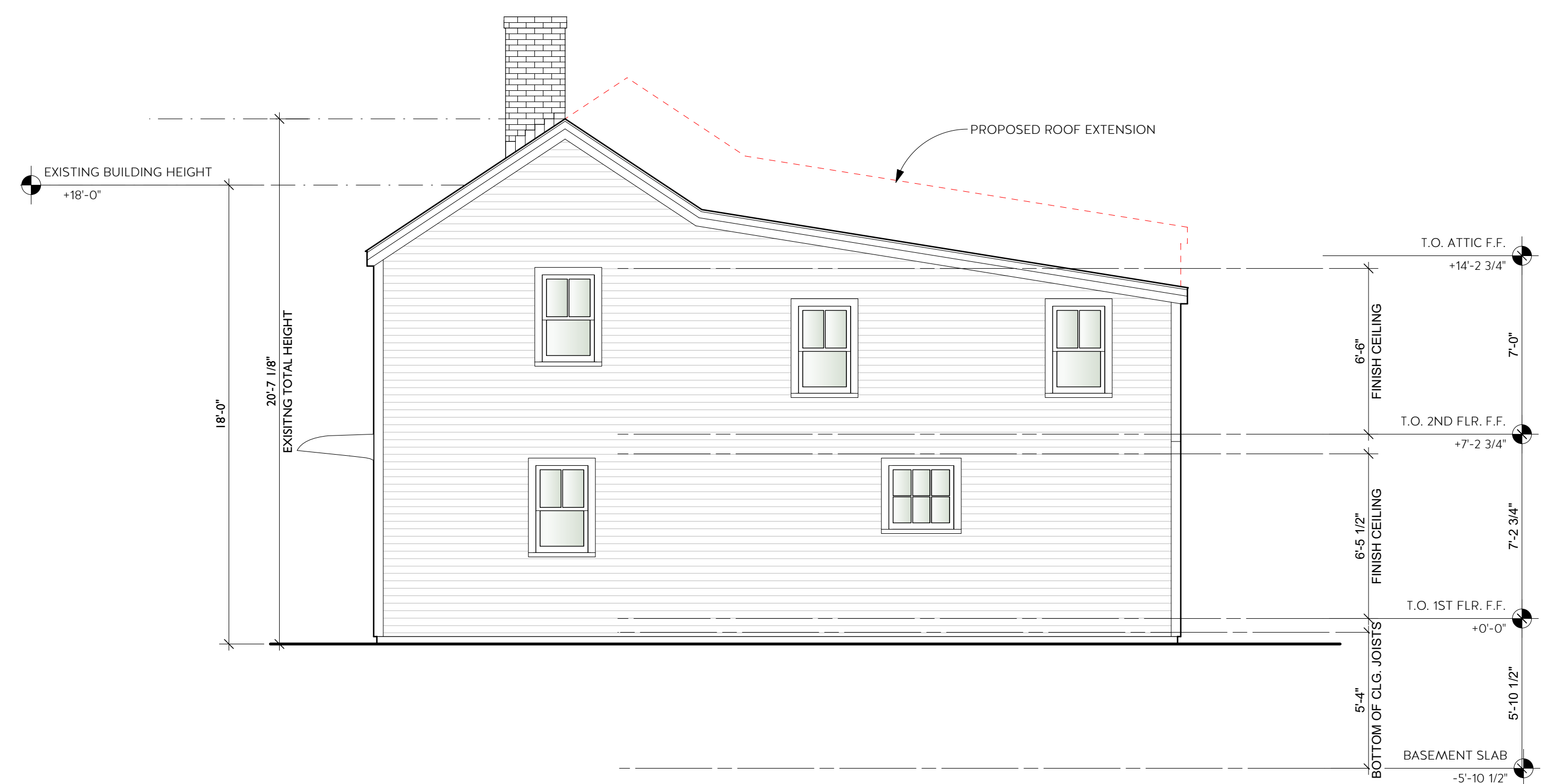
4 RIGHT ELEVATION Scale: 1/4" = 1'-0"