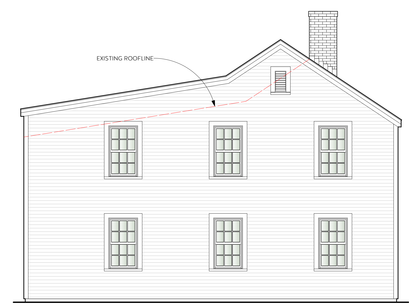
2 PROPOSED LEFT SIDE ELEVATION Scale: 1/4" = 1'-0"