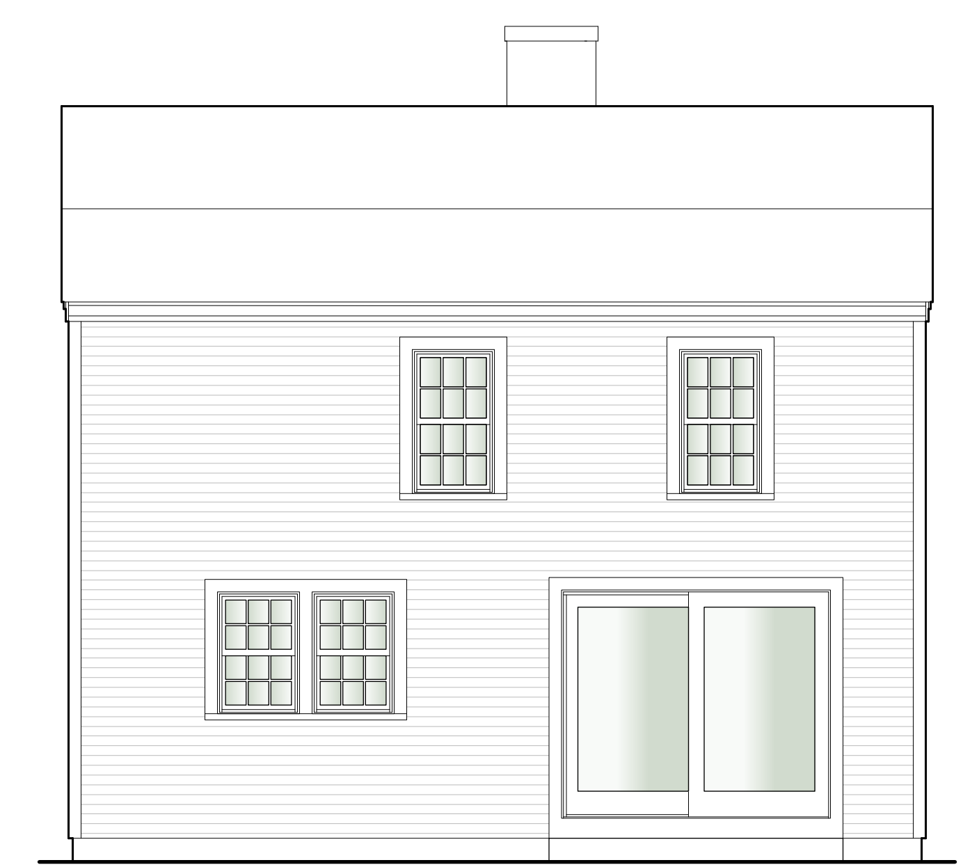
3 PROPOSED REAR ELEVATION Scale: 1/4" = 1'-0"