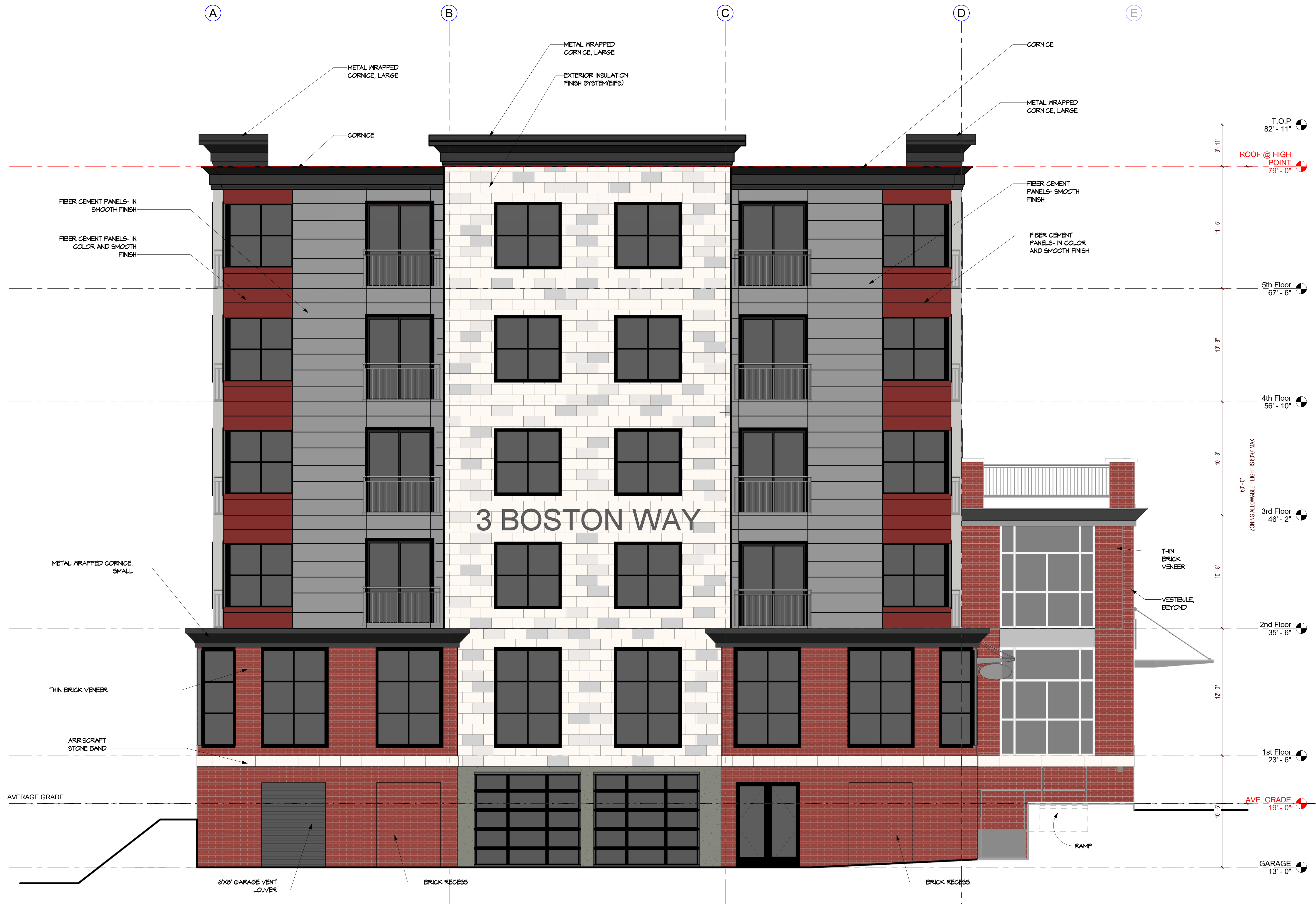
1 EAST ELEVATION SCALE: 1/4" = 1'-0"