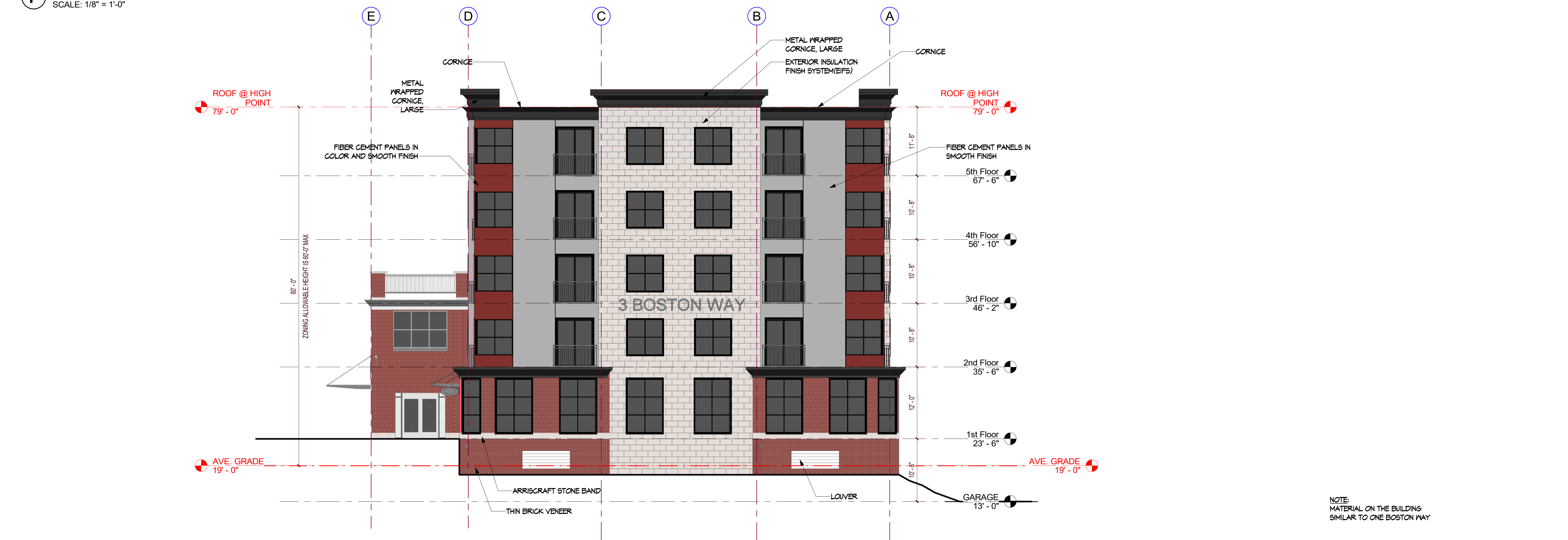
2 West SCALE: 1/8" = 1'-0"