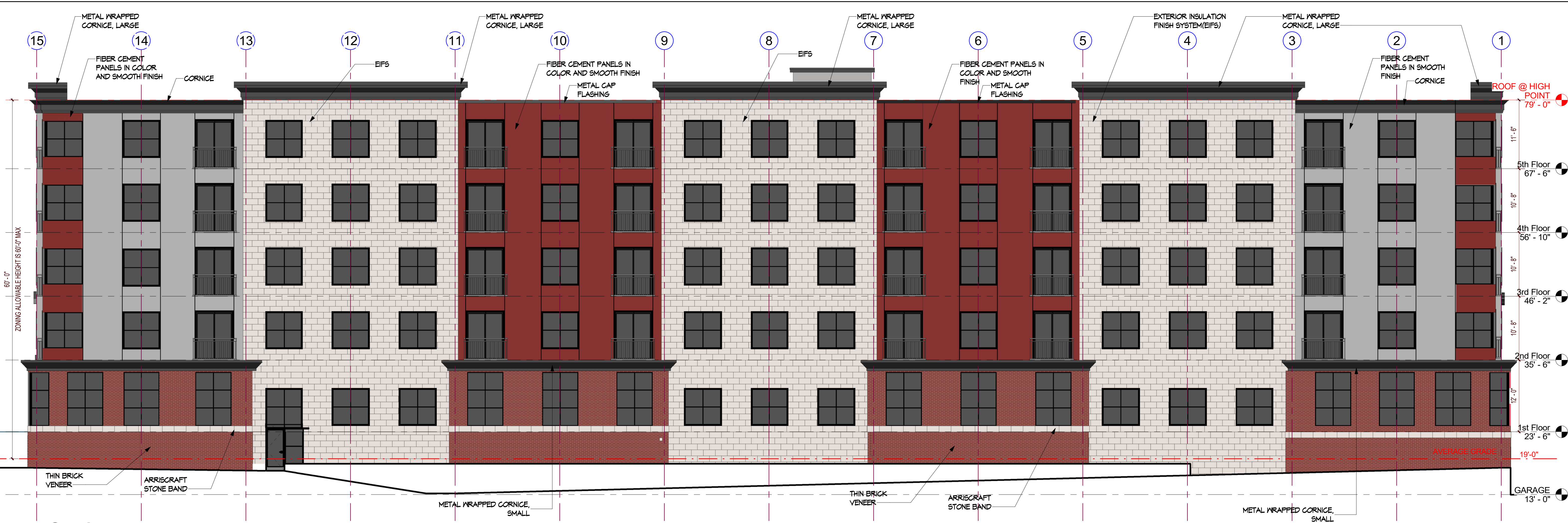
1 South SCALE: 1/8" = 1'-0"