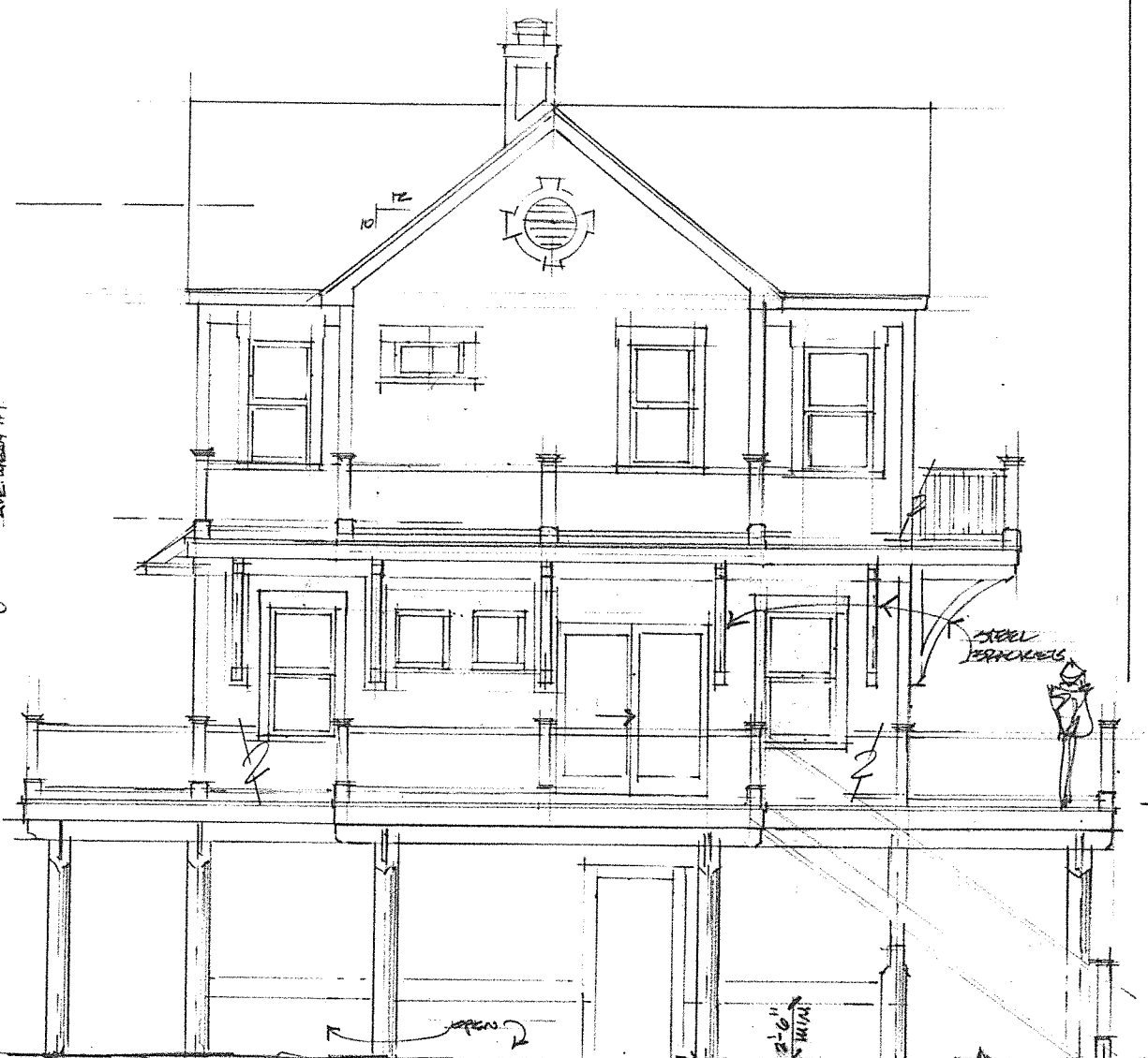
RIGHT SIDE ELEVATION 1/4" = 1'-0"

REV. MAY 29, 2021 REV. MAY 19, 2021 REV. MAY 11, 2021 MAY 3, 2021