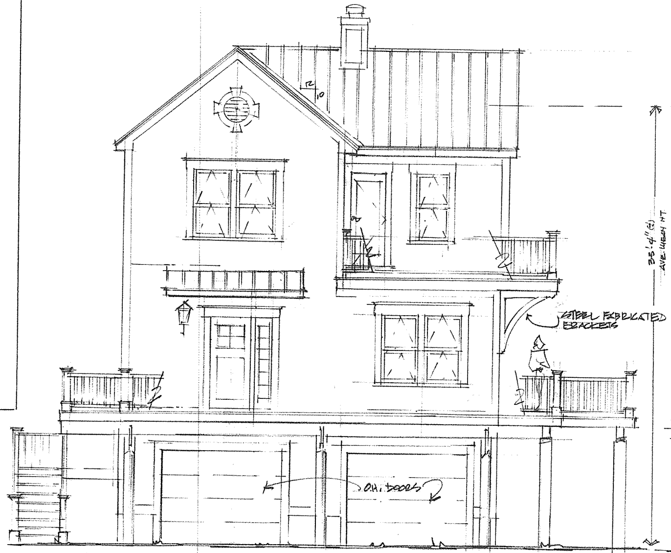
FRONT (STREET) ELEVATION 1/4" = 1'-0"