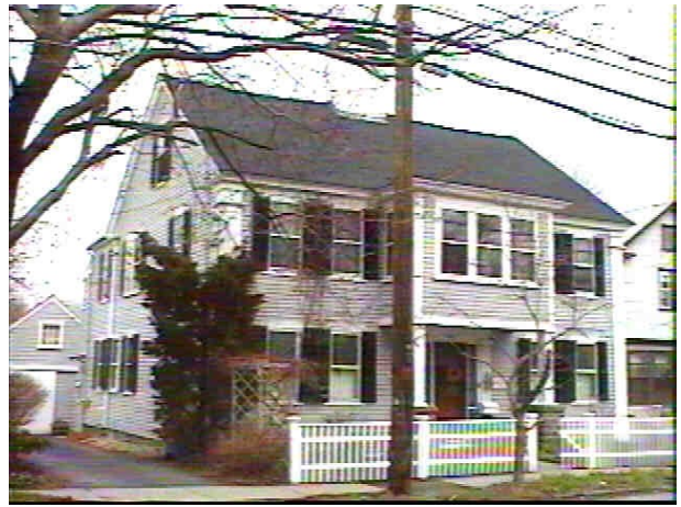
( http://images.vgsi.com/photos/NewburyportMAPhotos/\00\00\06\09.jpg )