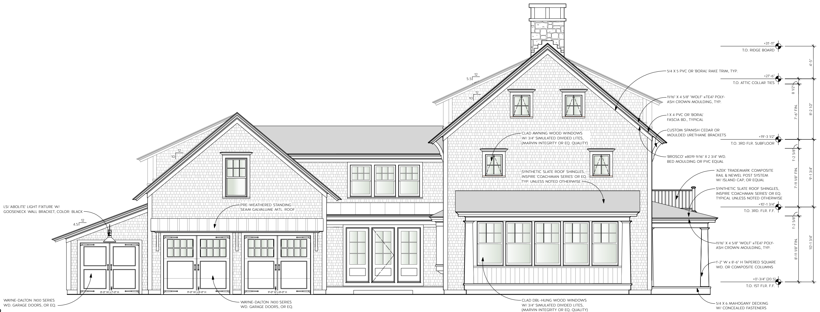
1 WEST ELEVATION (FRONT ELEVATION) SCALE: 1/4" = 1'-0"