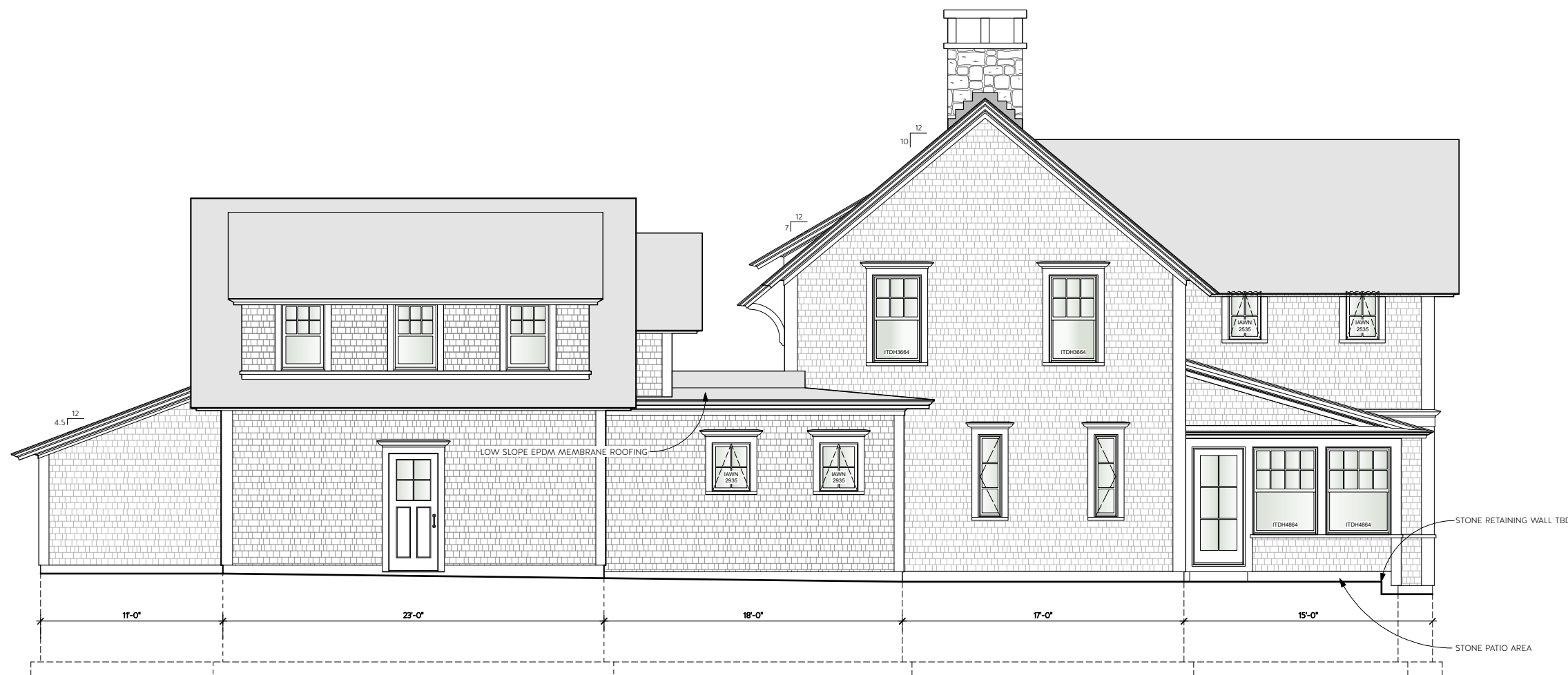
2 WEST ELEVATION (RIGHT SIDE ELEVATION) SCALE: 1/4" = 1'-0"