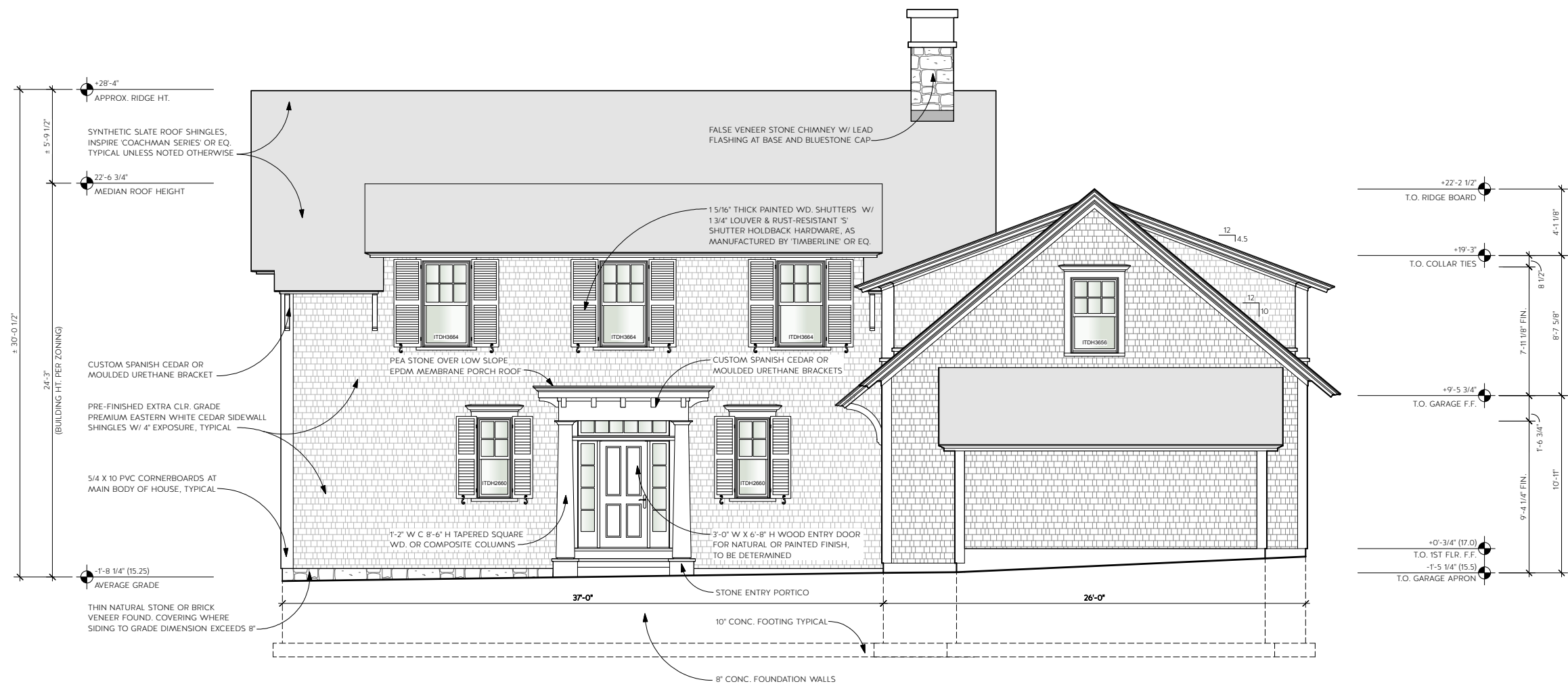
2 NORTH ELEVATION (FRONT ELEVATION) SCALE: 1/4" = 1'-0"