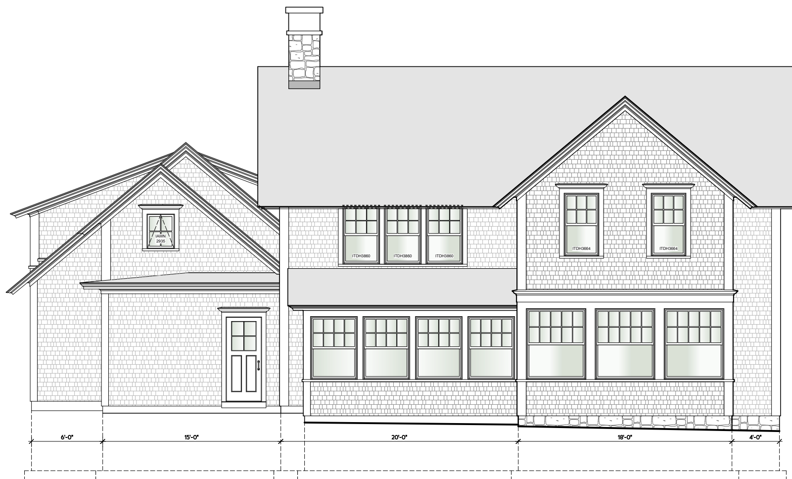
1 SOUTH ELEVATION (REAR ELEVATION) SCALE: 1/4" = 1'-0"