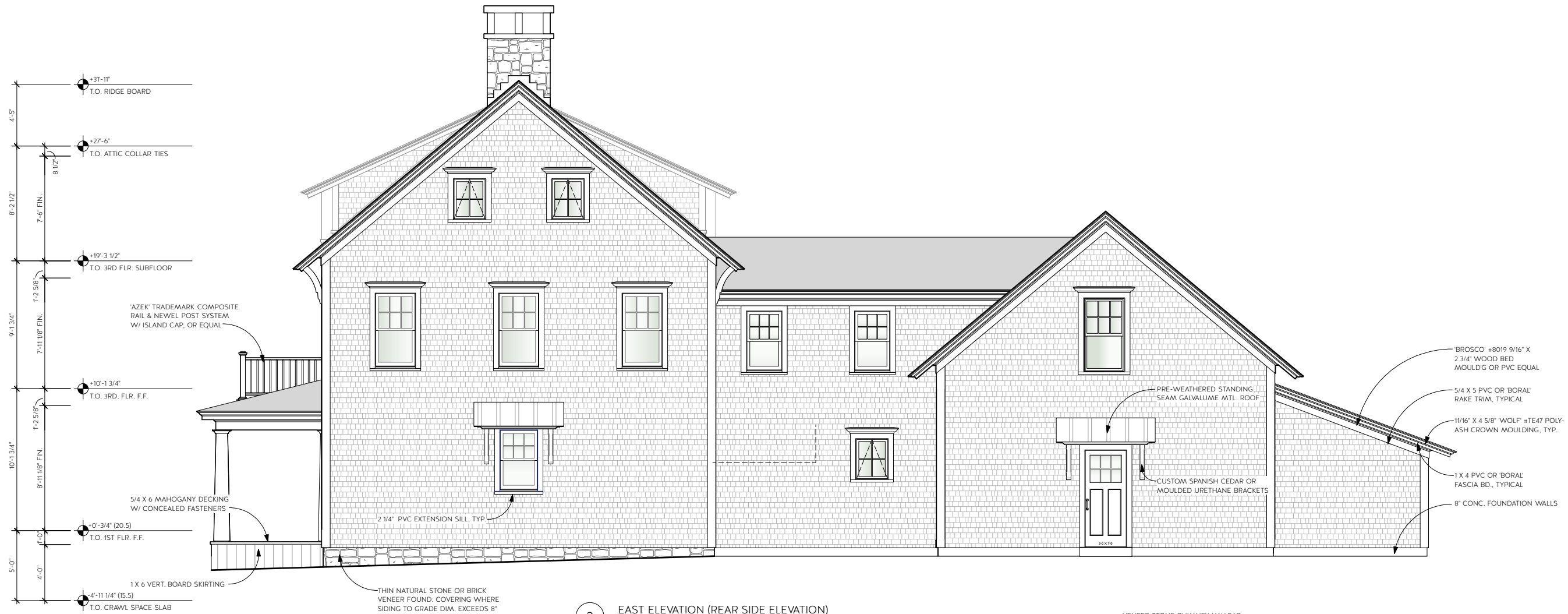
2 EAST ELEVATION (REAR SIDE ELEVATION) SCALE: 1/4" = 1'-0"