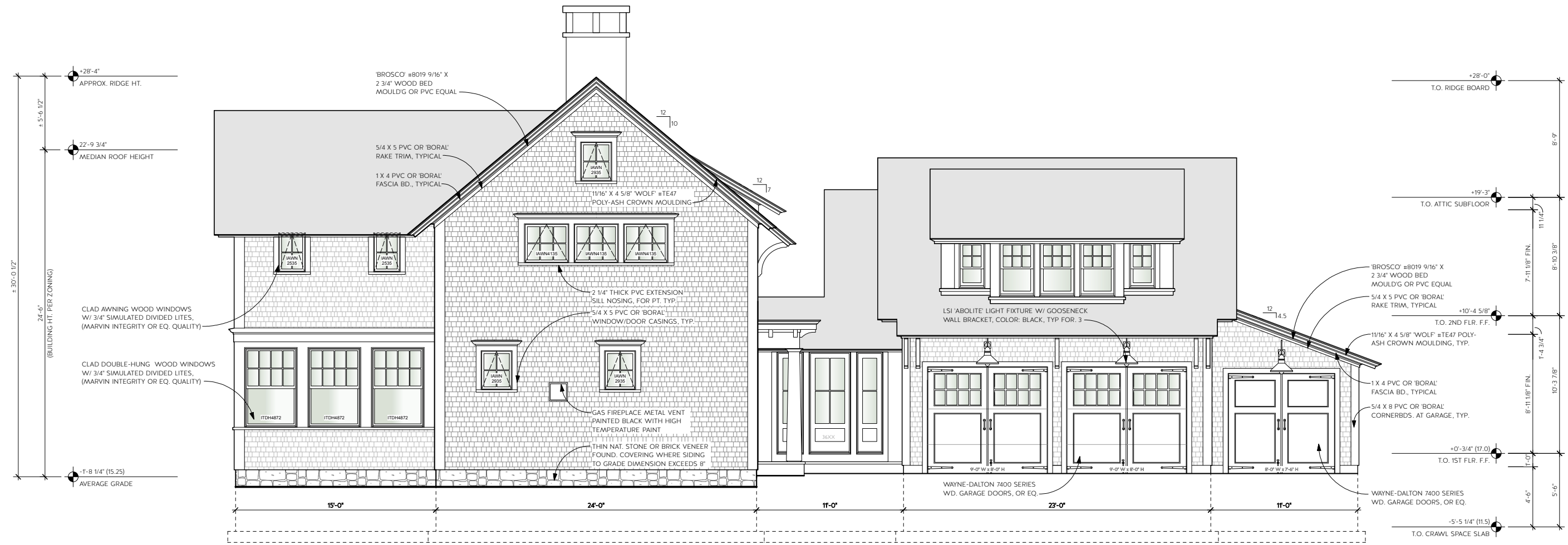
2 EAST ELEVATION (LEFT SIDE ELEVATION) SCALE: 1/4" = 1'-0"