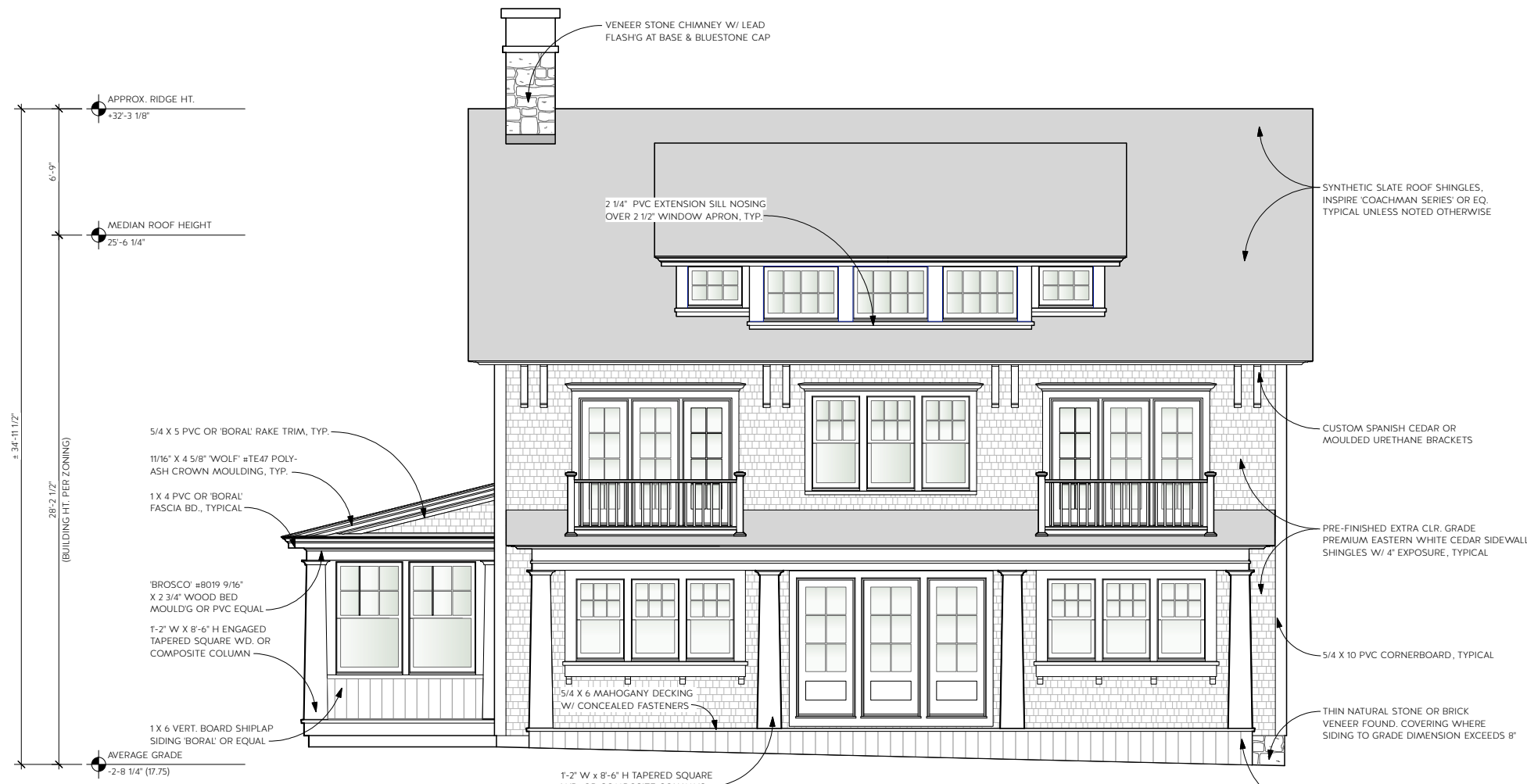
2 SOUTH ELEVATION (RIGHT SIDE ELEVATION) SCALE: 1/4" = 1'-0"