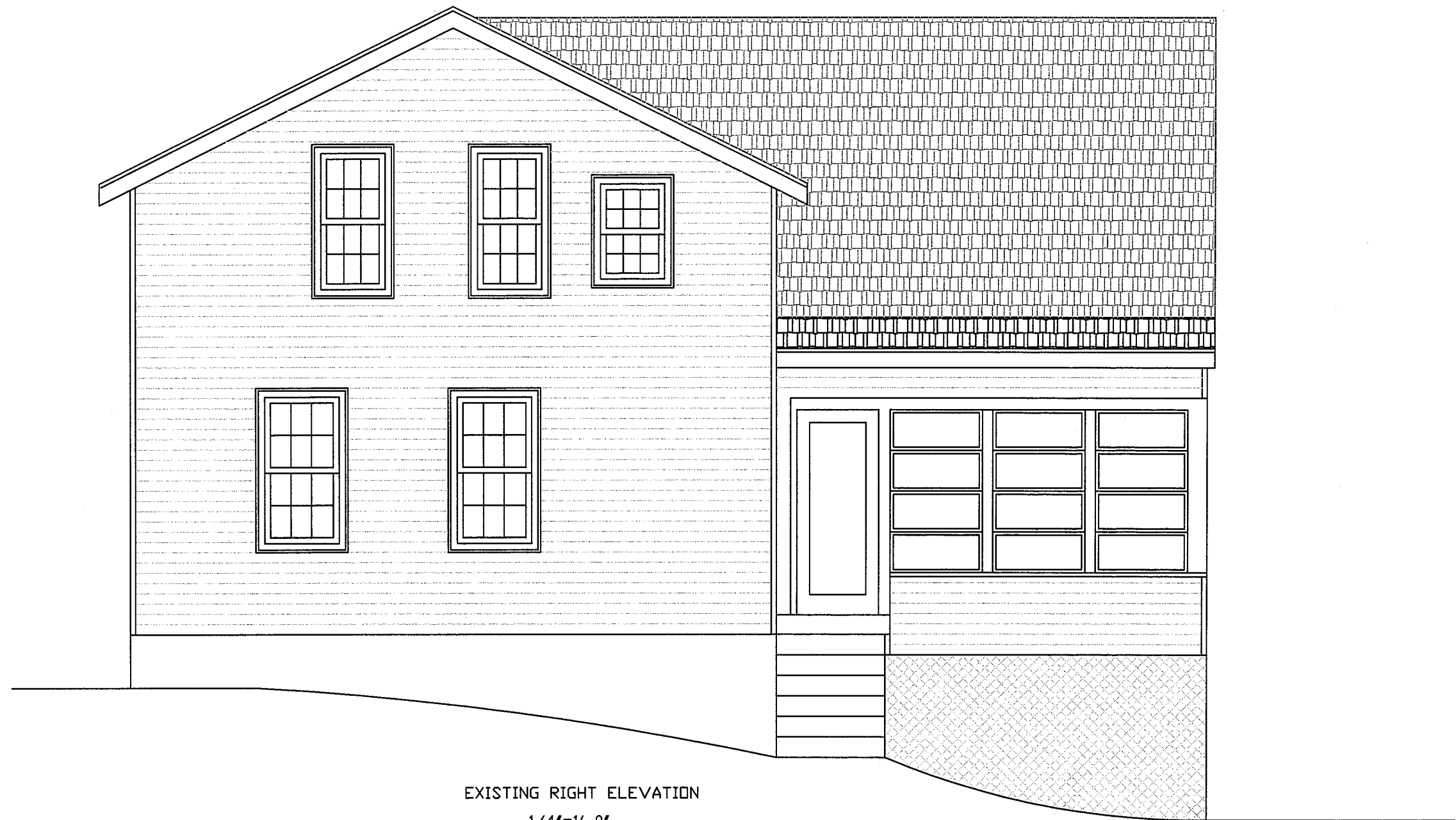
EXISTING RIGHT ELEVATION 1/4"=1'-0"