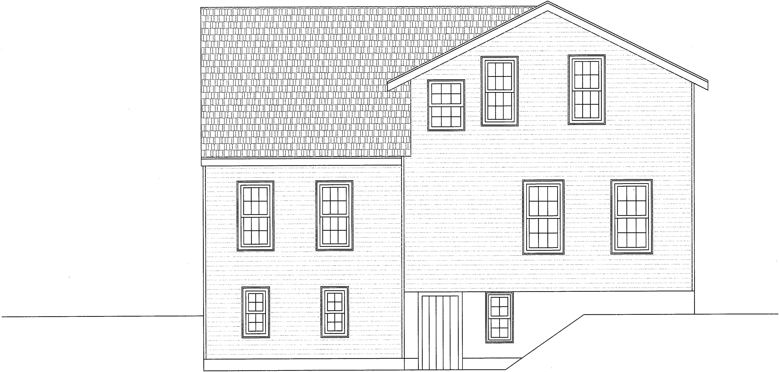
EXISTING LEFT ELEVATION