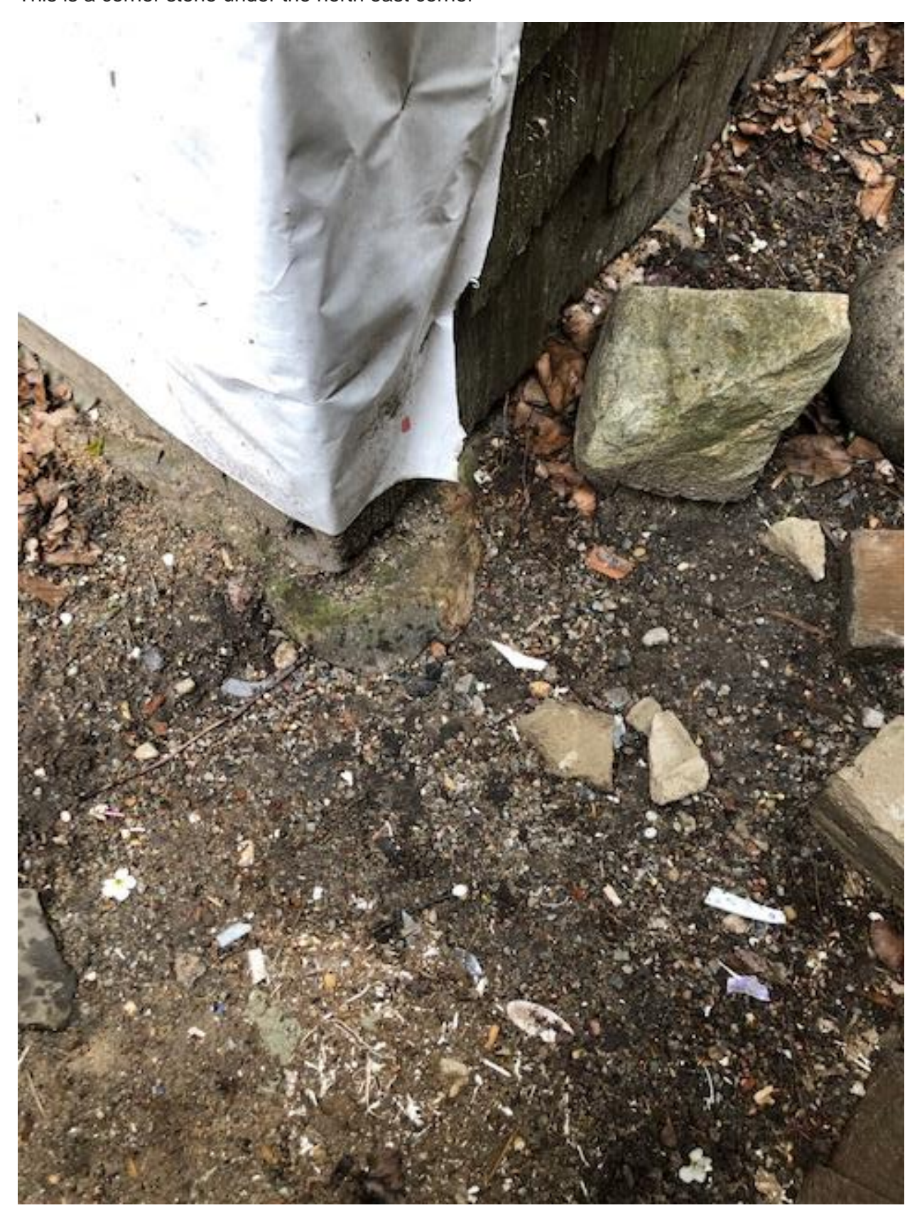
This is a corner stone under the north east corner