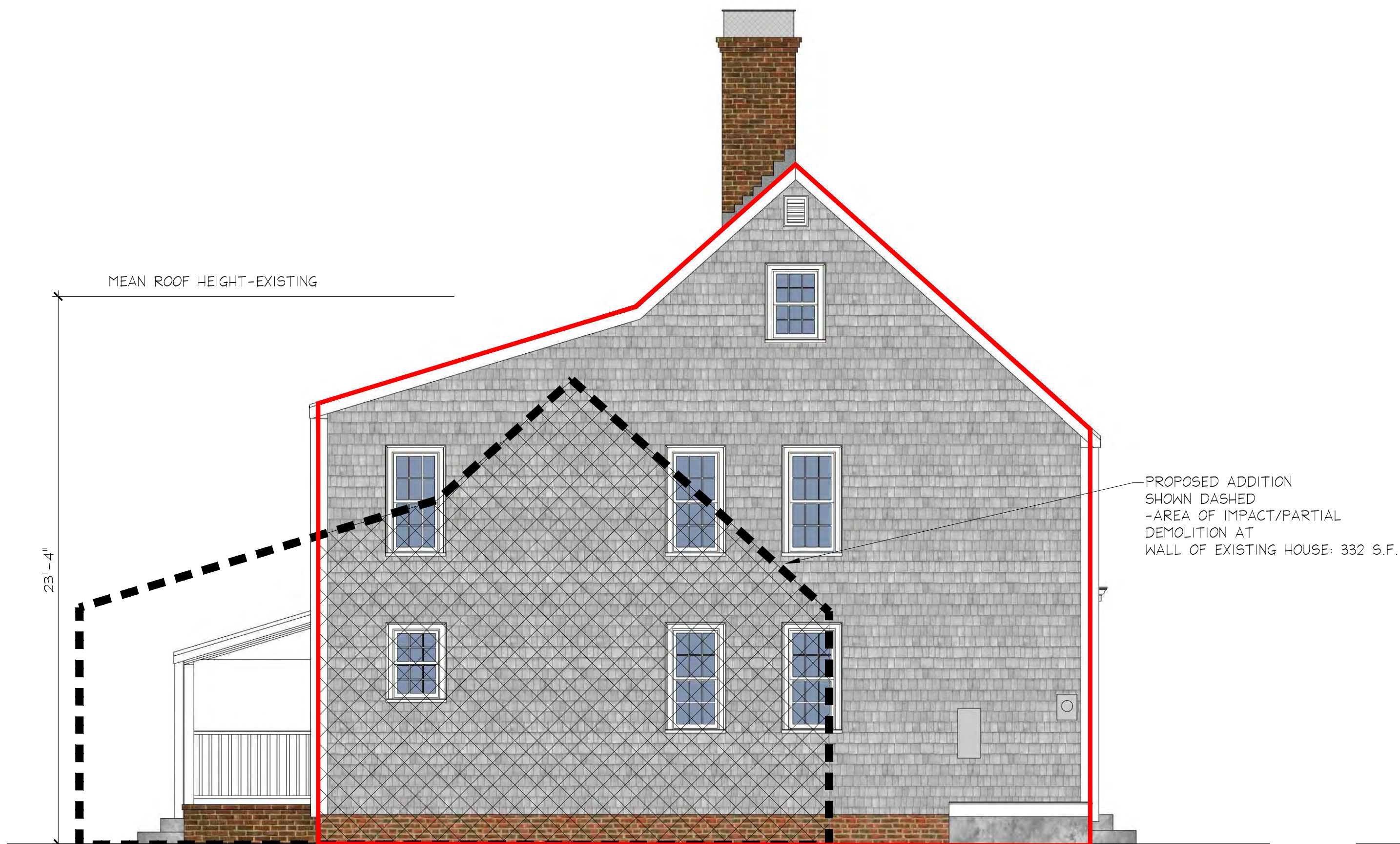
LEFT SIDE EXISTING WALL AREA: 753 S.F. OUTLINED IN RED