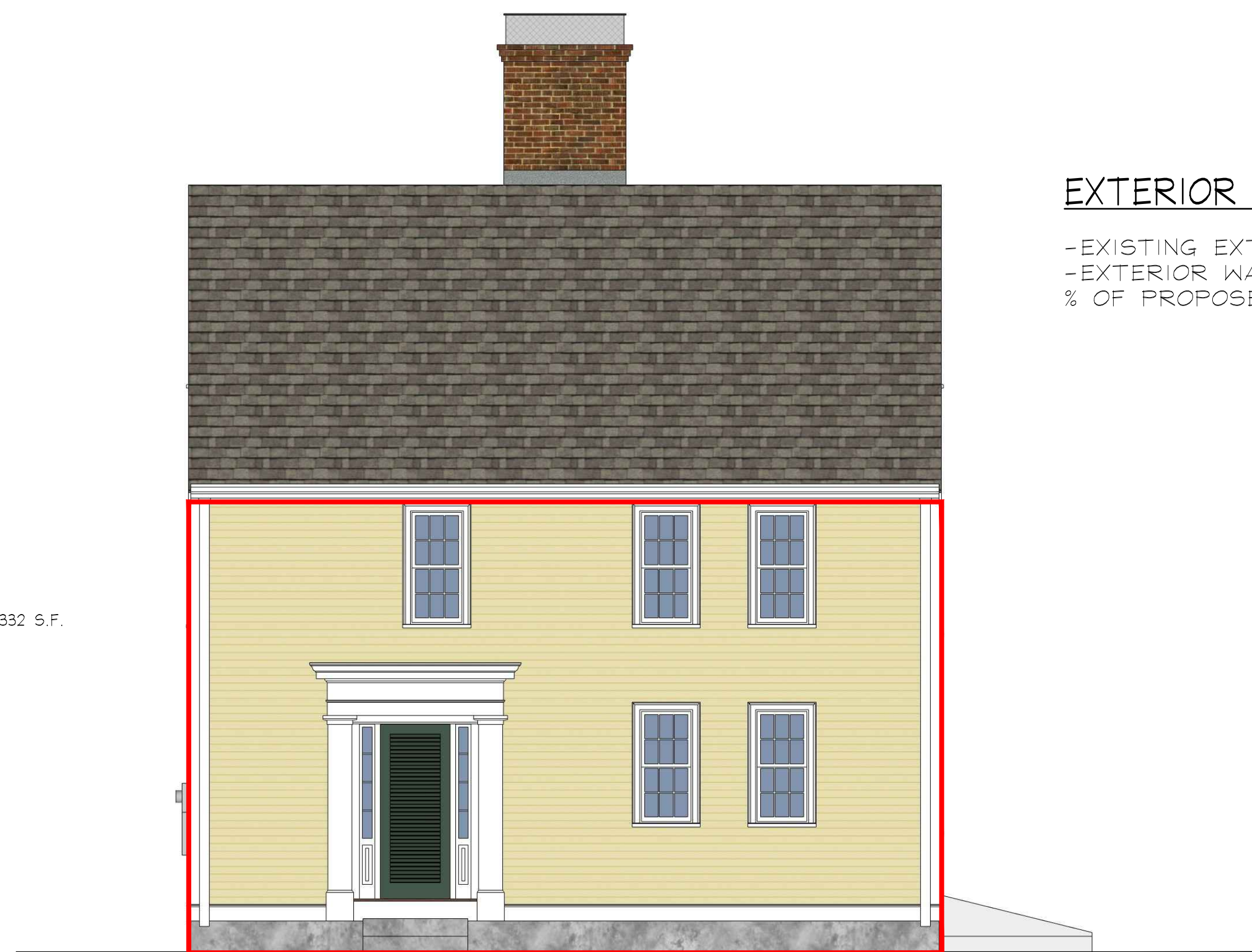
FRONT ELEVATION EXISTING WALL AREA: 484 S.F. OUTLINED IN RED