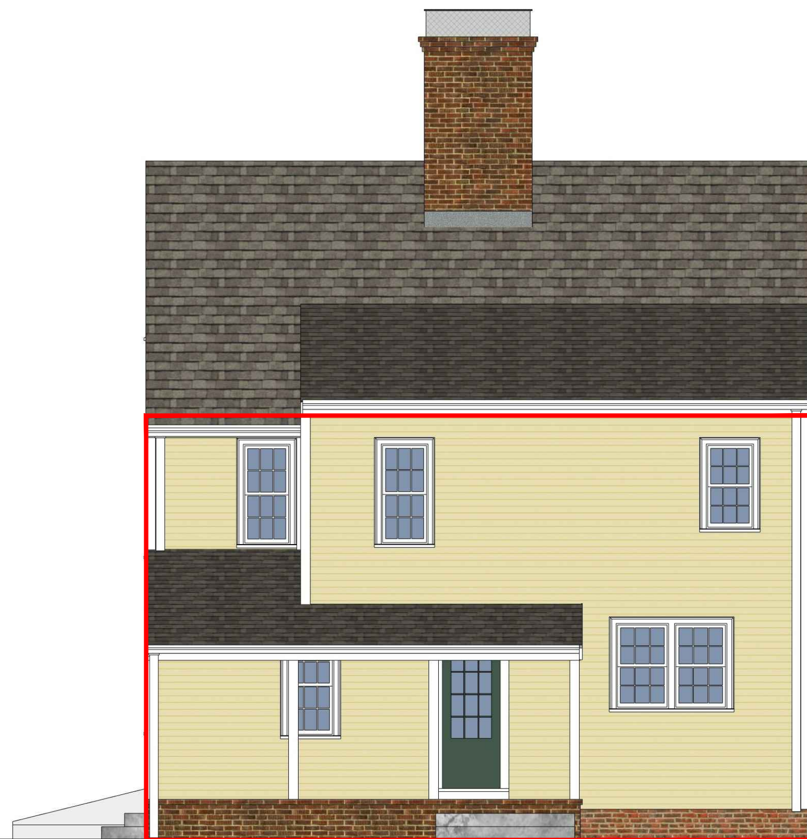
REAR ELEVATION EXISTING WALL AREA: 484 S.F. OUTLINED IN RED