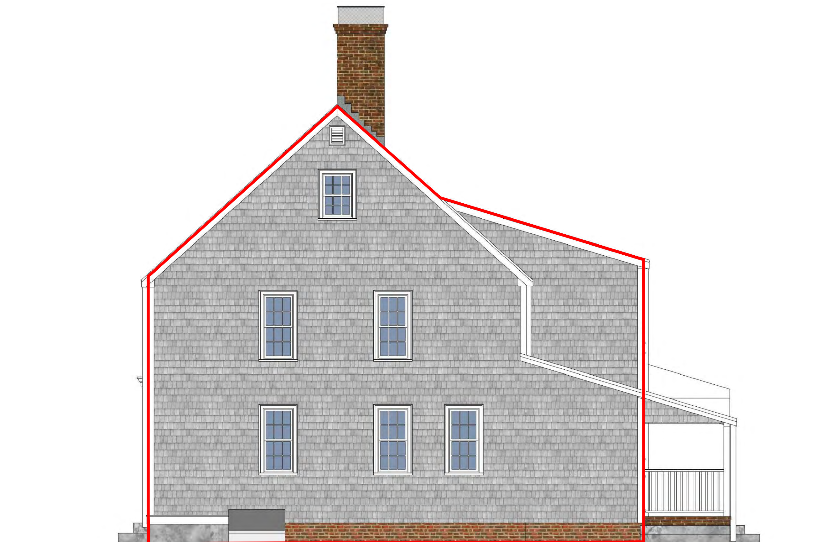
RIGHT SIDE EXISTING WALL AREA: 753 S.F. OUTLINED IN RED