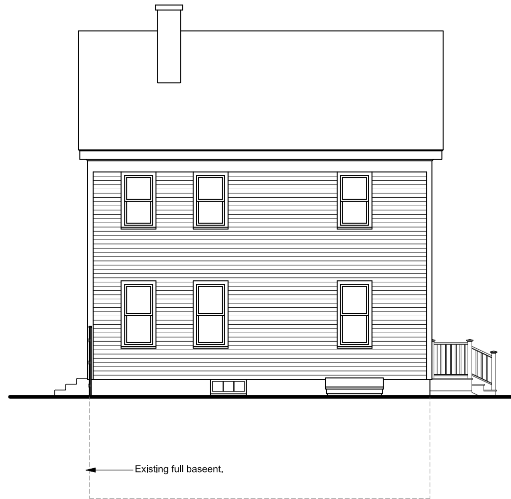
20 SIDE ELEVATION | EXISTING SCALE: 1/8" = 1'-0"