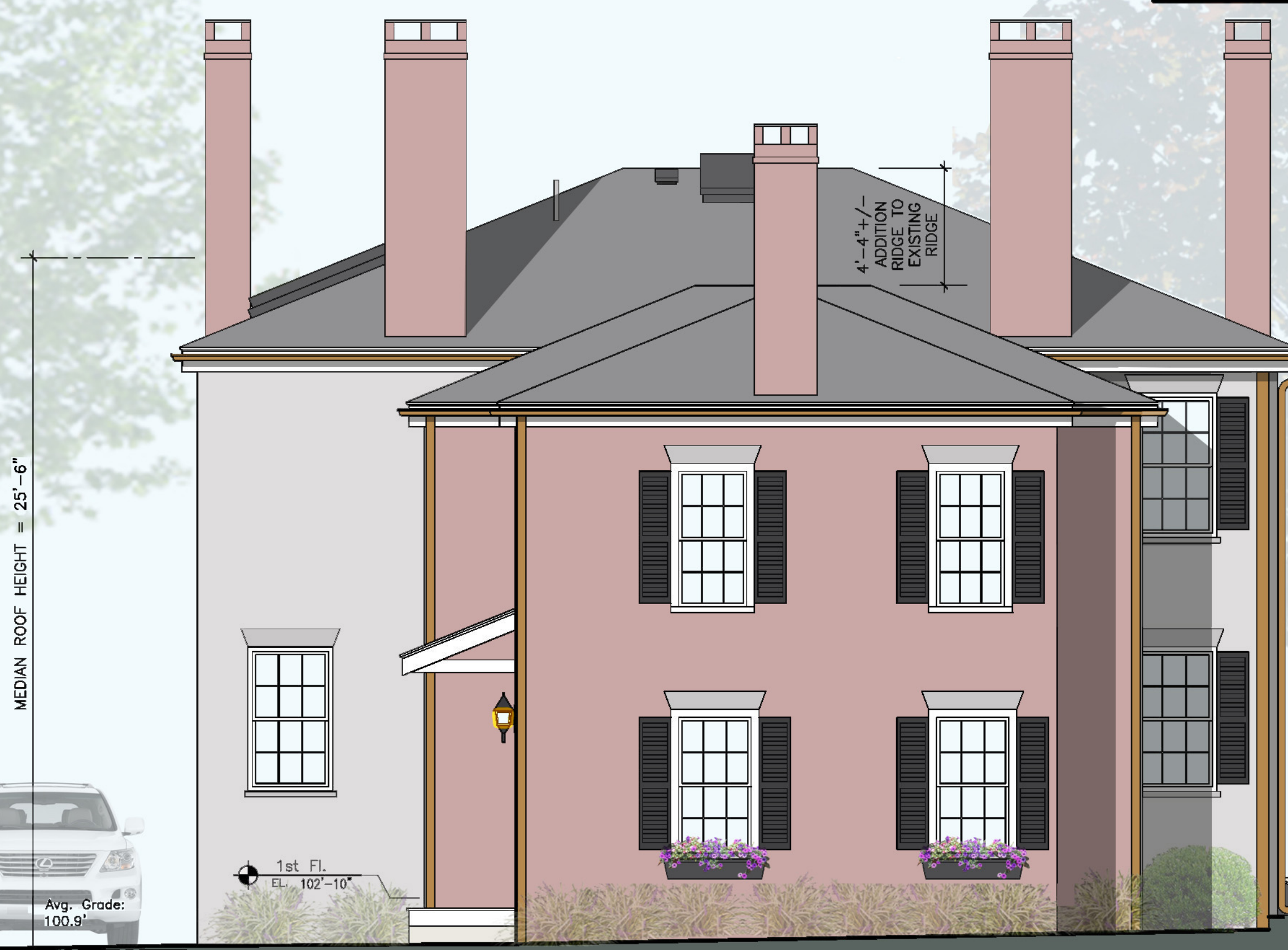
2 West Elevation A-2.1 Scale: 1/4"=1'-0"

Tektoniks Architects 17 Larchmont Road Salem, Massachusetts 01970 tel. 617.816.3555 www.tektoniksarchitects.com