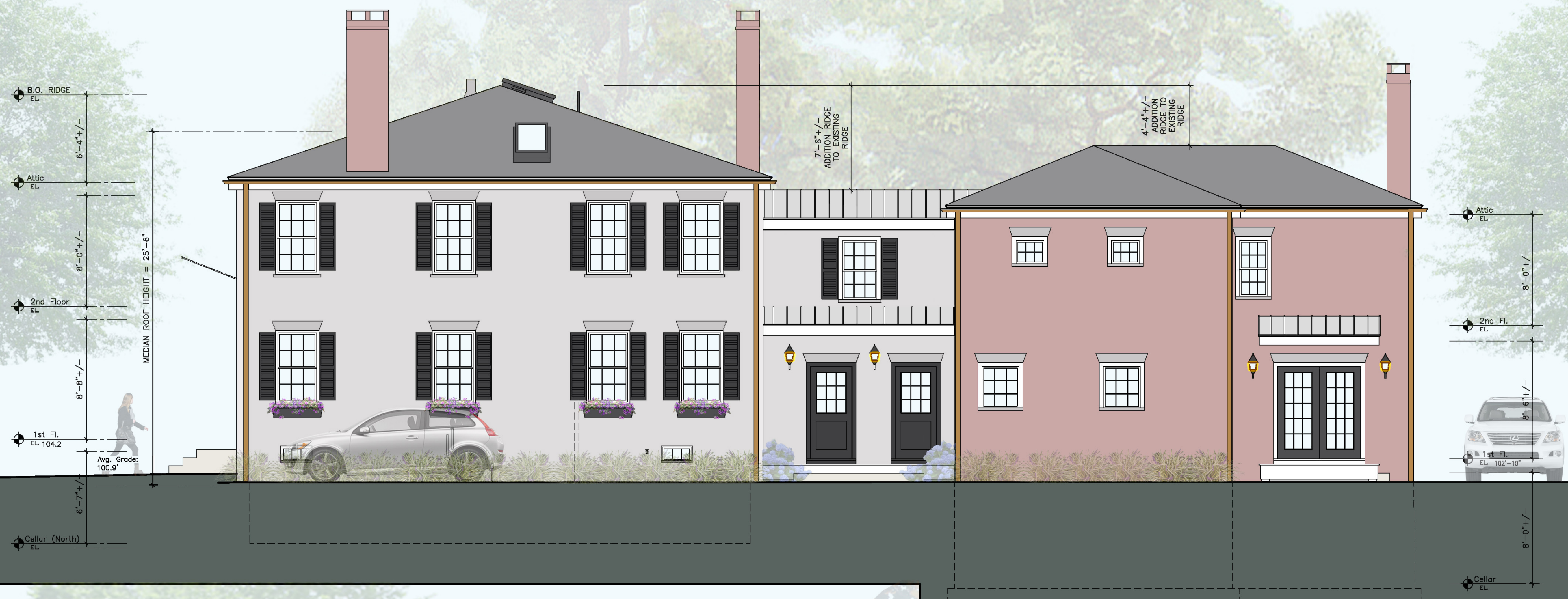
1 North Elevation A-2.1 Scale: 1/4"=1'-0"