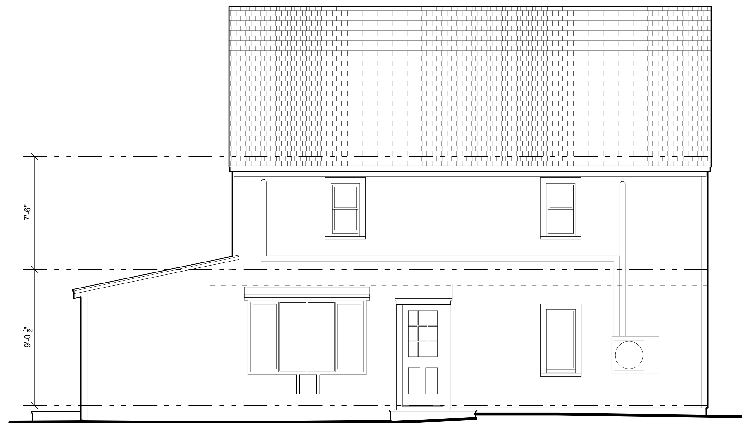
Existing North Elevation Scale: 1/4" = 1'-0"