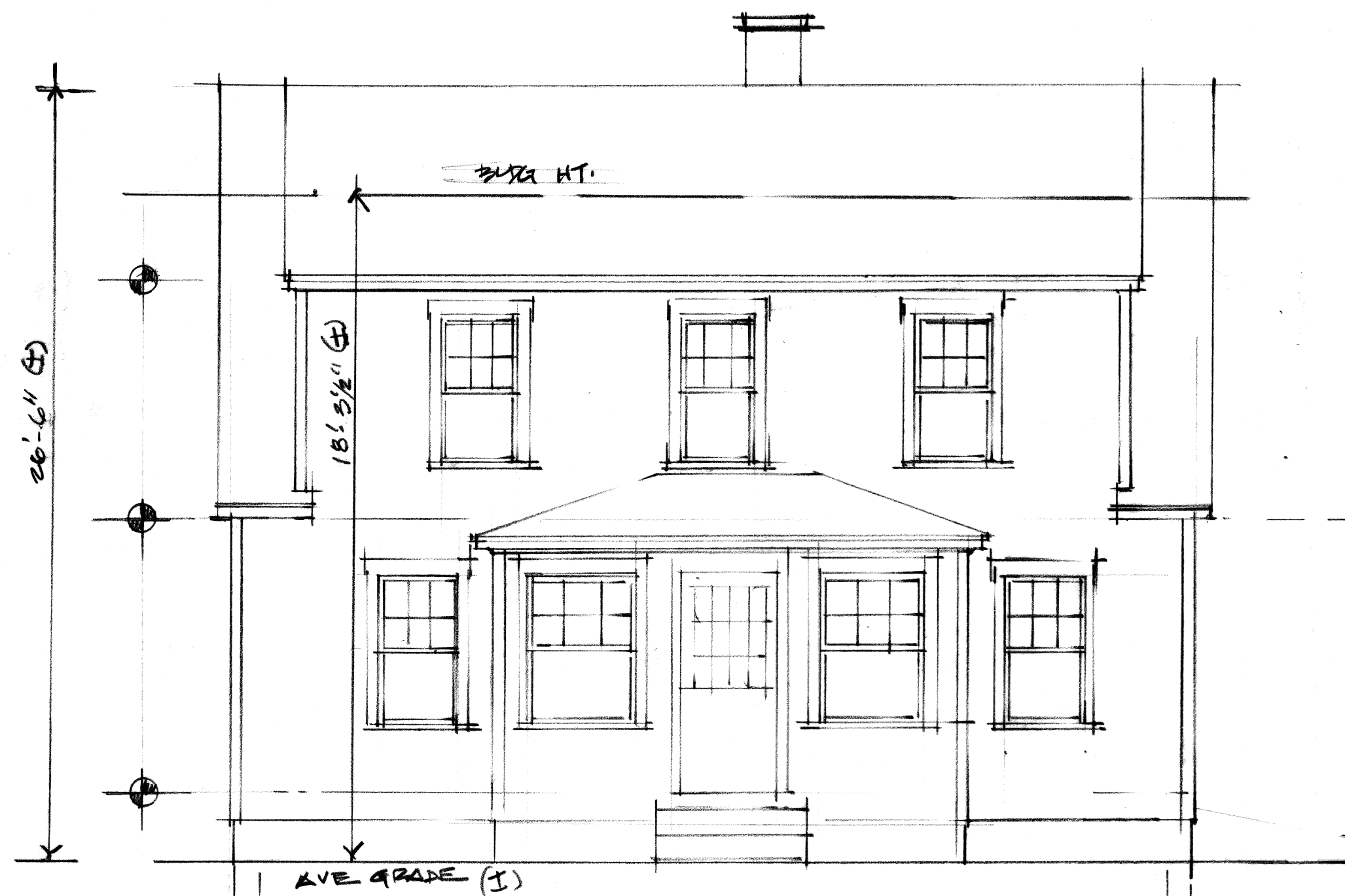
FRONT ELEVATION 1/4" = 1'-0"