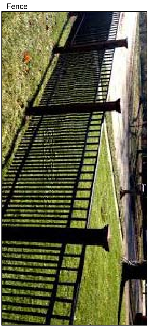
Fence Aluminum Picket Fence - Perimeter