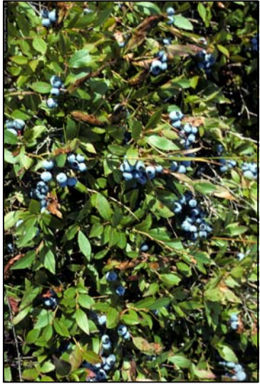
Low Bush Blueberry