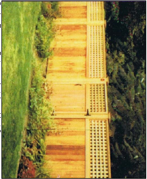
Cedar Fence - Between Lot 1 and Lot 2