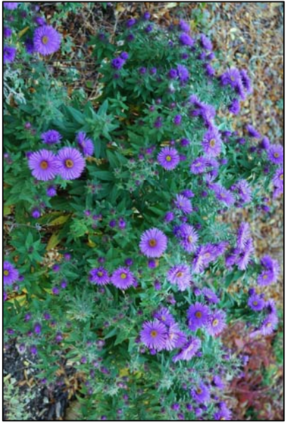
New England Aster