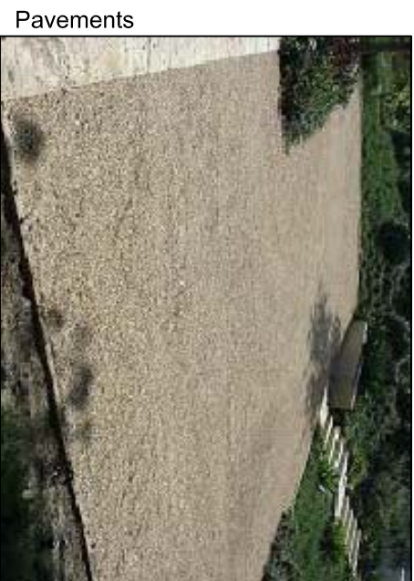
Pavements Chip Seal Driveway