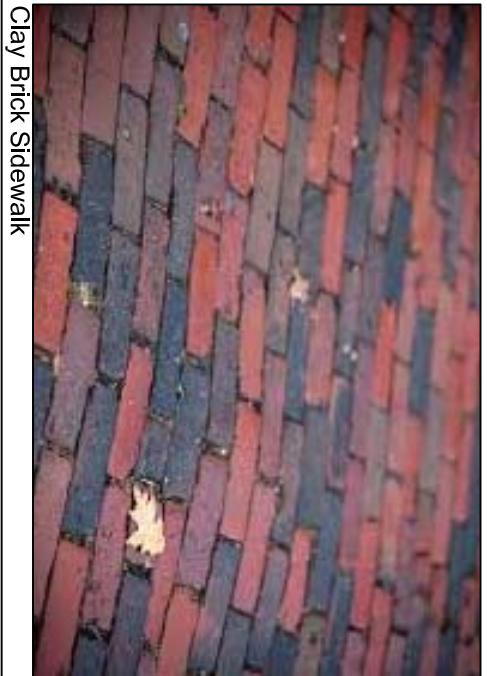
Clay Brick Sidewalk