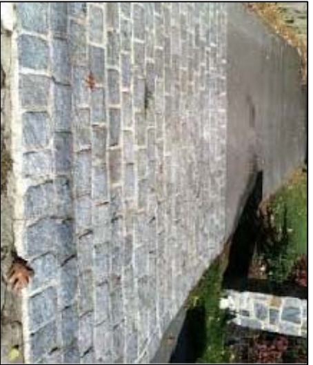
Granite Cobblestone Driveway Apron