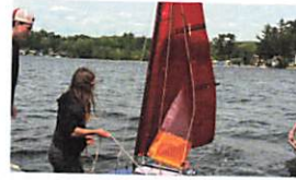
BUILDING SAILING ROBOTS INNOVATION