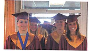
ONWARD, FORWARD NHS GRADS CLIPPER PRIDE