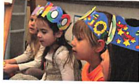
CELEBRATING THE 100TH DAY TRADITION