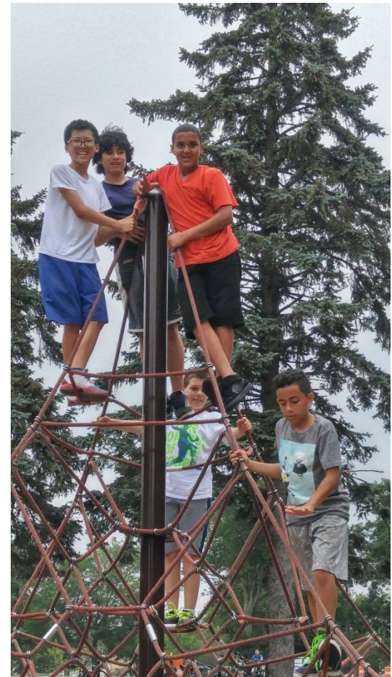
Hazelwood Park, New Bedford