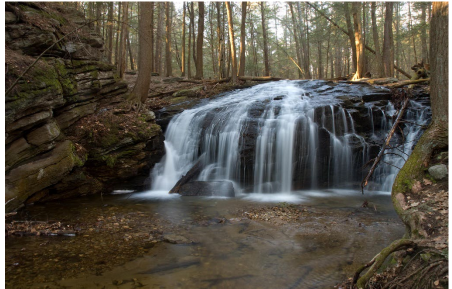
Holland Glen Forest, Belchertown