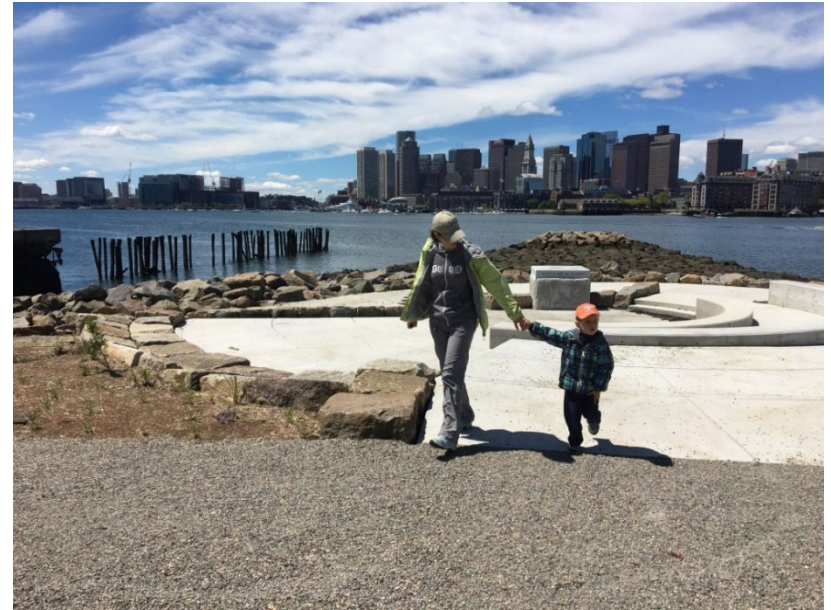
LoPresti Park, Boston