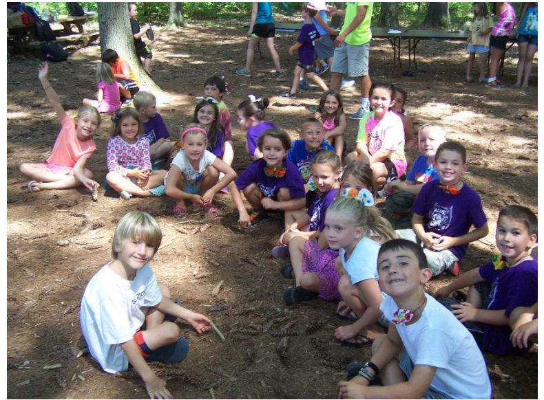
Camp Paradise, Beverly