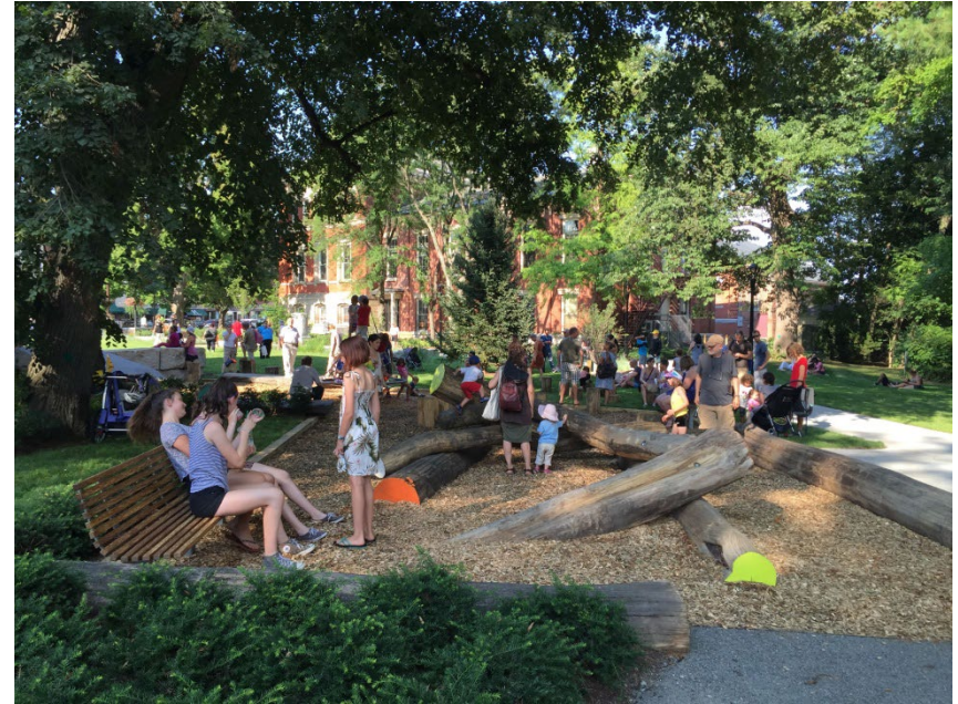
Pulaski Park, Northampton