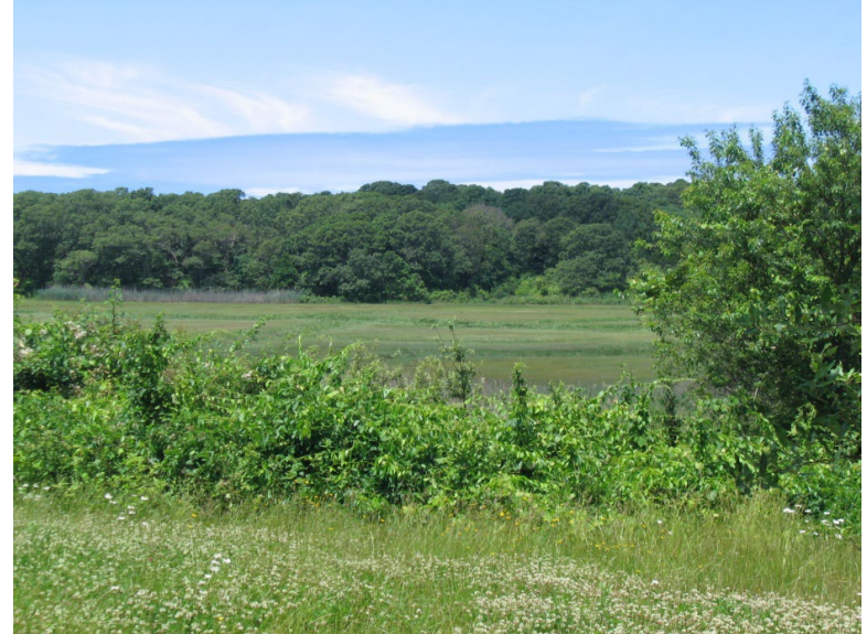
Punkhorn Parklands, Brewster