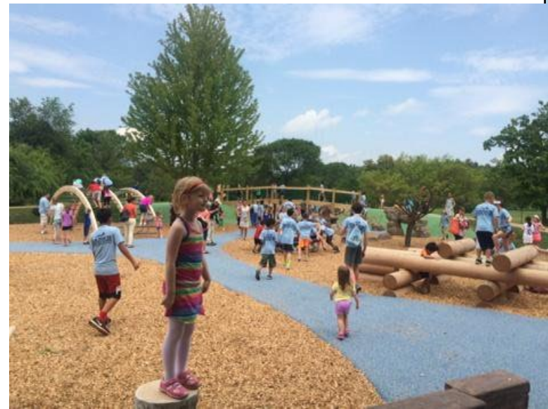
Cushing Memorial Park, Framingham