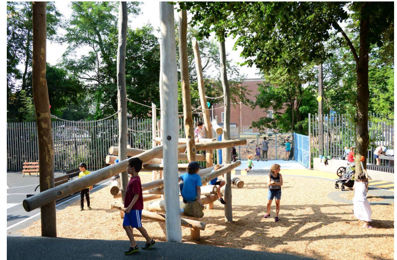
Hoyt-Sullivan Park, Somerville