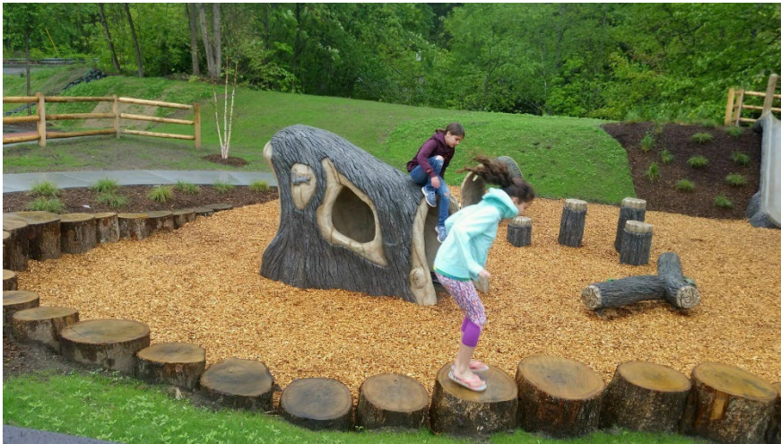
Erving Riverfront Park