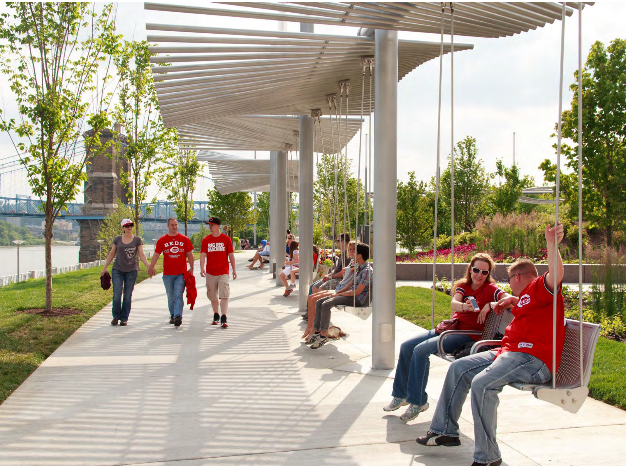
SMALE RIVERFRONT PARK - CINCINNATI OHIO