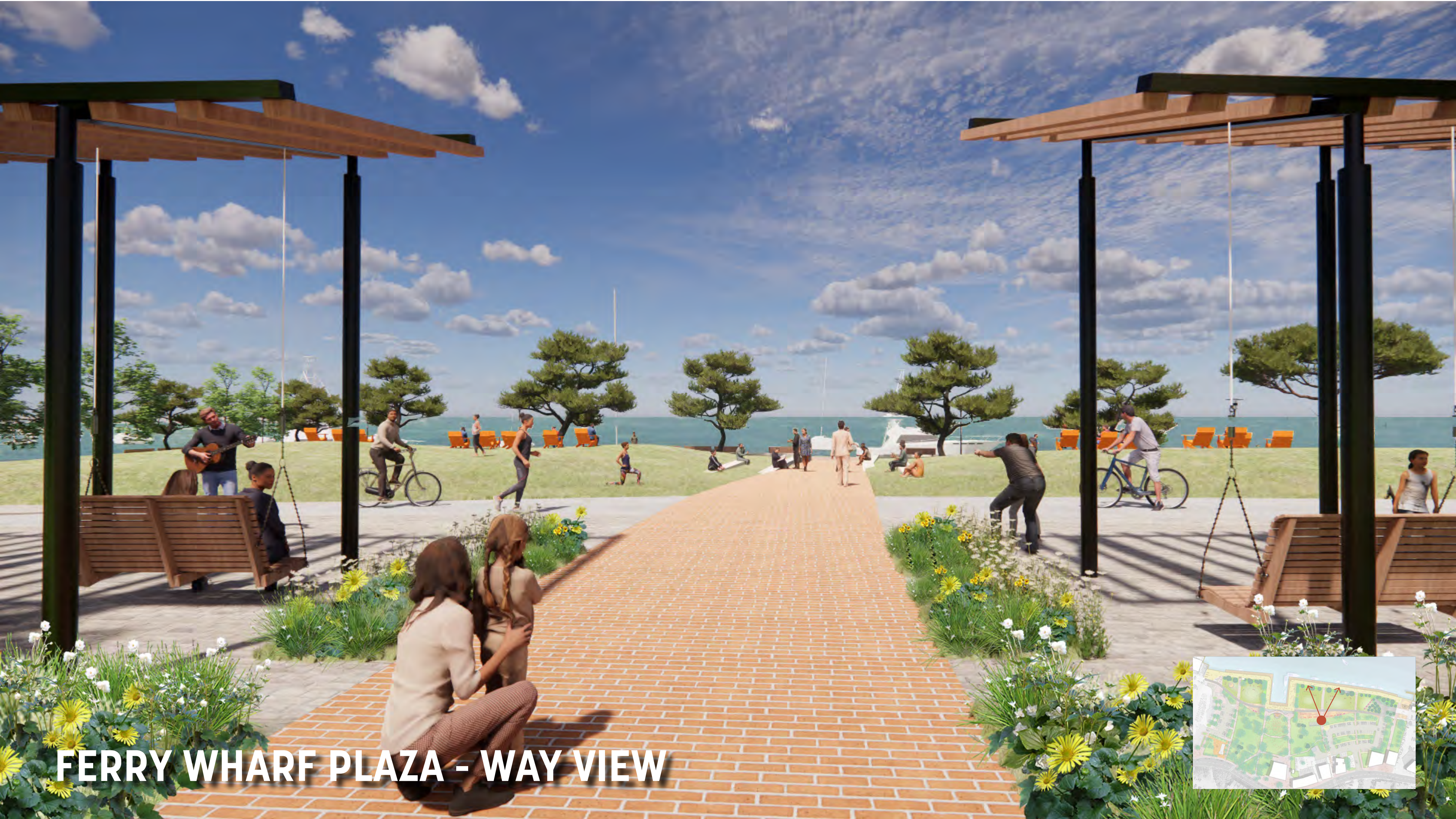
FERRY WHARF PLAZA - WAY VIEW