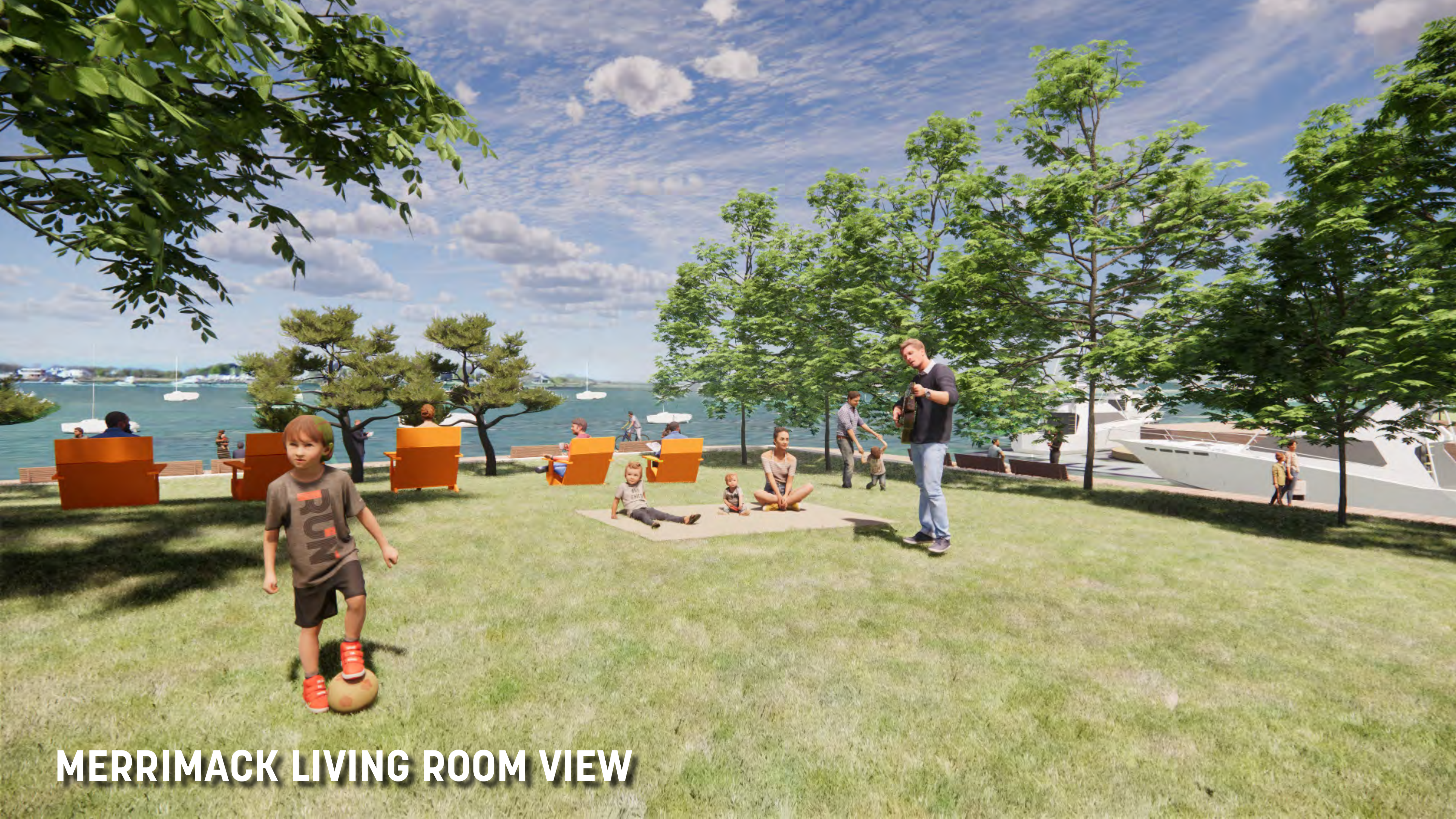
MERRIMACK LIVING ROOM VIEW