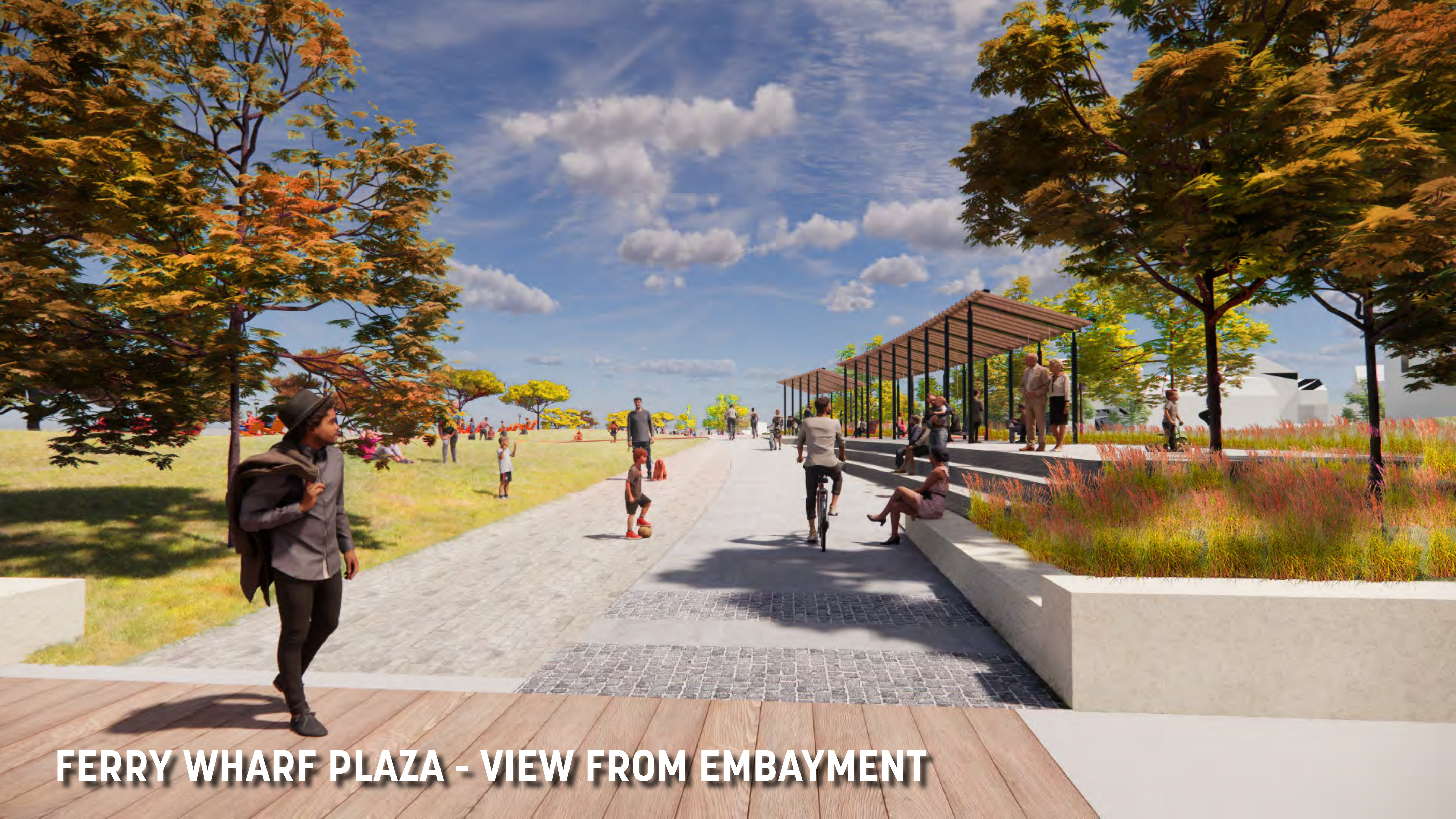
FERRY WHARF PLAZA - VIEW FROM EMBAYMENT