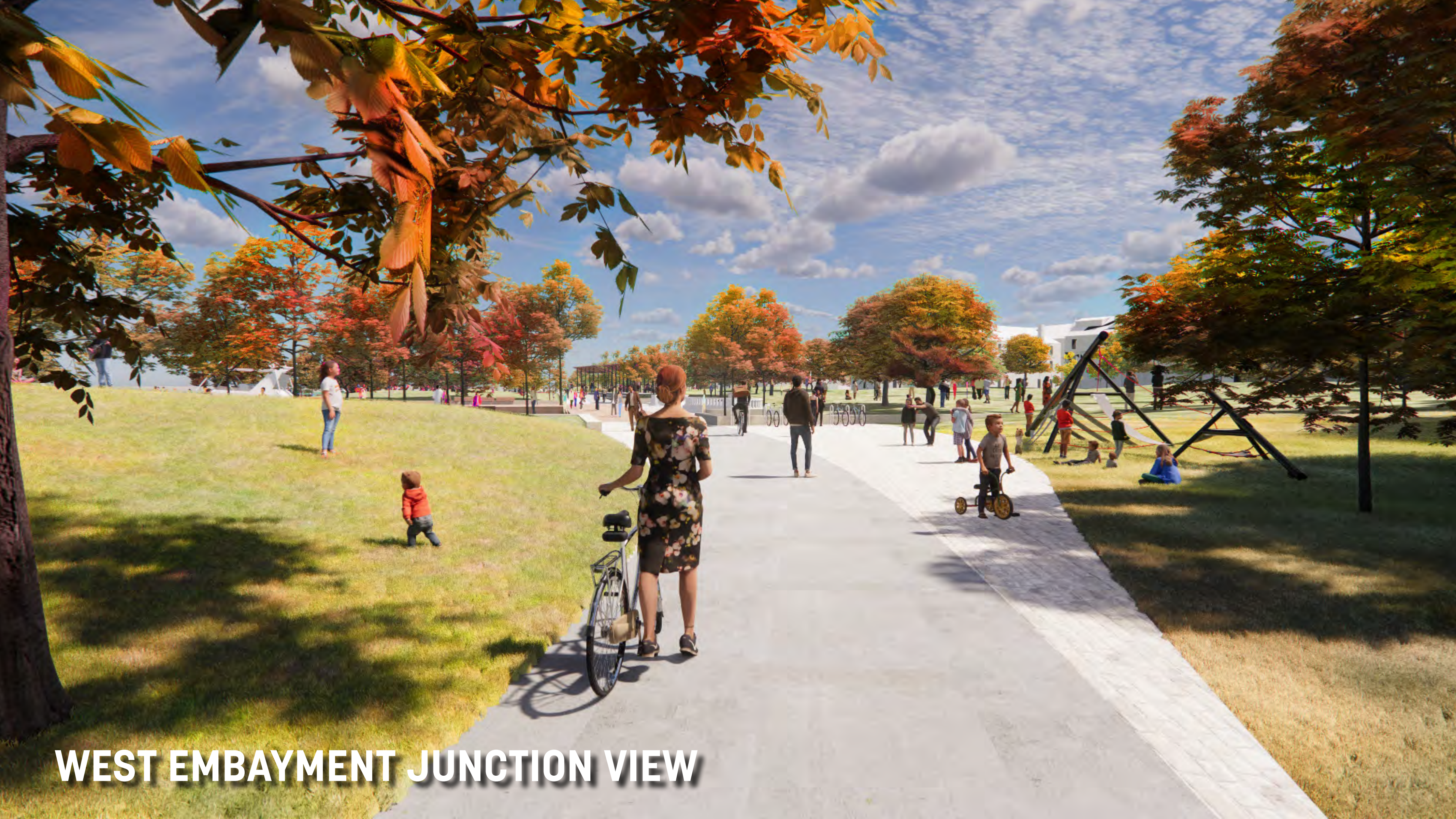
WEST EMBAYMENT JUNCTION VIEW