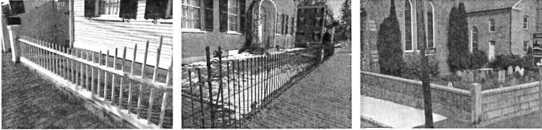
(Simpler historic fence and site wall designs.)

In all cases, solely the SPGA may approve heights in excess of five feet (5'-0") for those fences or site walls visible from a public way, public park or playground, or the Merrimack River.