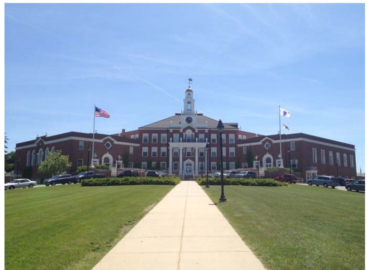
Newburyport High School