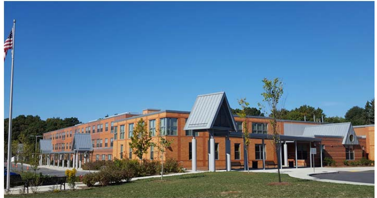
Bresnahan School