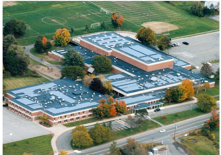
Nock/Molin School