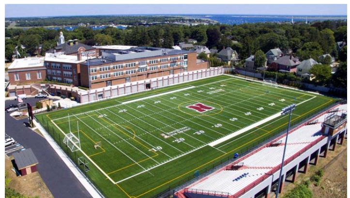
World War Memorial Stadium

In the spring of 2014, the City deemed the track at Fuller Field unsafe and off-limits for competitive events due to crumbling subsurface, erosion of top surface, and poor drainage leaving a void to the entire fitness and sports community of Newburyport. The Newburyport Parks Department received a FY2017 grant from the Community Preservation Act, which was coupled with several other funding sources ranging from private donations to municipal appropriations, to improve the facility. This improvement and renovation project includes a reconfigured, 8-lane, all-weather, 400-meter, oval running track with new long jump, triple jump, pole vault systems, shot-put landing area, shot-put pad, and discus pad with cage. Additionally, this project enlarged the natural grass field in the center of the track, installed wiring for future lighting and scoreboard, installed new fencing and concrete walkways, and improved overall drainage of the site. A future phase of the project will improve the parking and drop-off area, construct a 500-seat grandstand, and a press box.