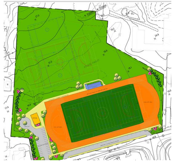
Plan for Bradley Fuller Field Plan drawn by Huntress Associates, Inc.

In the spring of 2014, the City deemed the track at Fuller Field unsafe and off-limits for competitive events due to crumbling subsurface, erosion of top surface, and poor drainage leaving a void to the entire fitness and sports community of Newburyport. The Newburyport Parks Department received a FY2017 grant from the Community Preservation Act, which was coupled with several other funding sources ranging from private donations to municipal appropriations, to improve the facility. This improvement and renovation project includes a reconfigured, 8-lane, all-weather, 400-meter, oval running track with new long jump, triple jump, pole vault systems, shot-put landing area, shot-put pad, and discus pad with cage. Additionally, this project enlarged the natural grass field in the center of the track, installed wiring for future lighting and scoreboard, installed new fencing and concrete walkways, and improved overall drainage of the site. A future phase of the project will improve the parking and drop-off area, construct a 500-seat grandstand, and a press box.