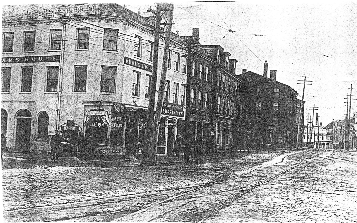
36-38 Market Square visible at left, early 20th c. (note 1/1 windows)