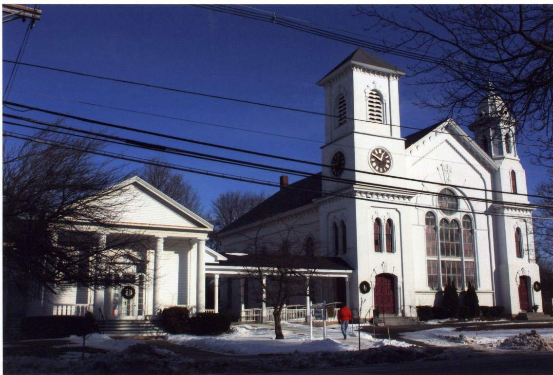
2010 - FISKE CHAPEL + BELLEVILLE MEETING HOUSE