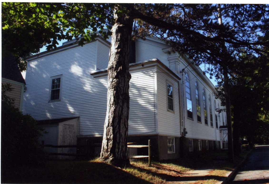
2010 - FISKE MEMORIAL CHAPEL + PARISH HALL - REAR