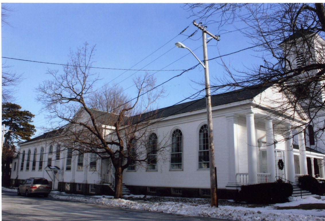
2010 - FISKE MEMORIAL CHAPEL + PARISH HALL - NORTH SIDE