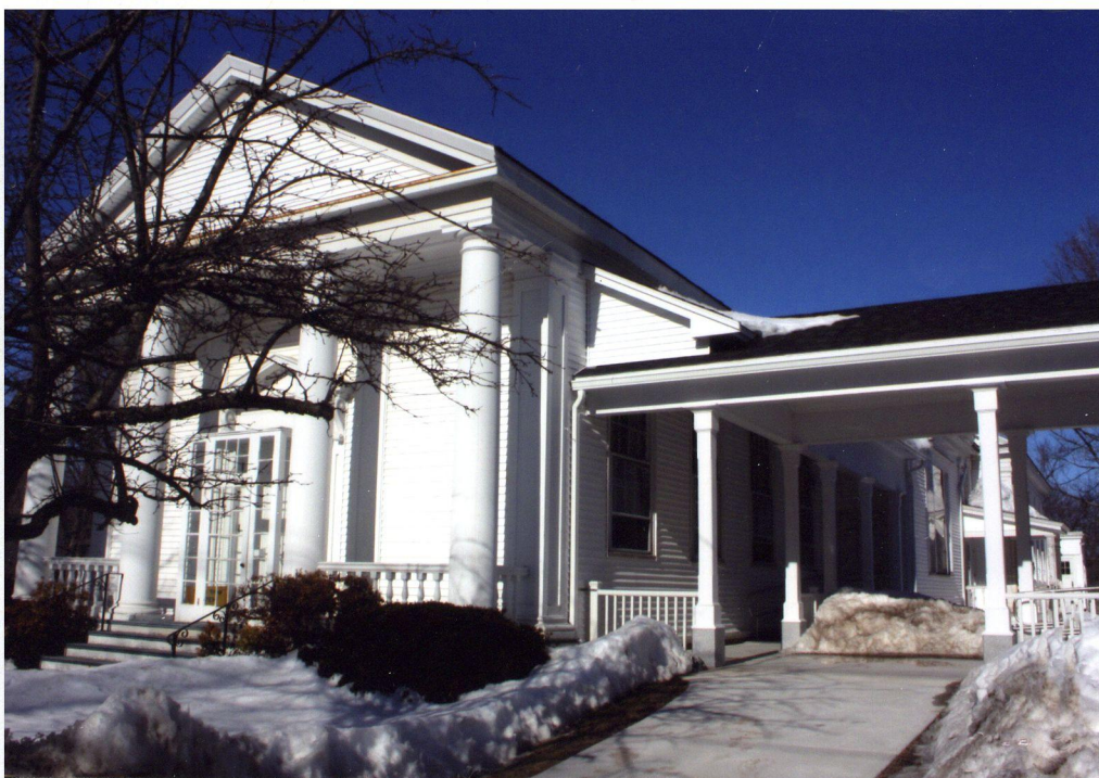
Photo 2: Fiske Chapel/Parish Hall with Connector to Meetinghouse, Southeast Elevation