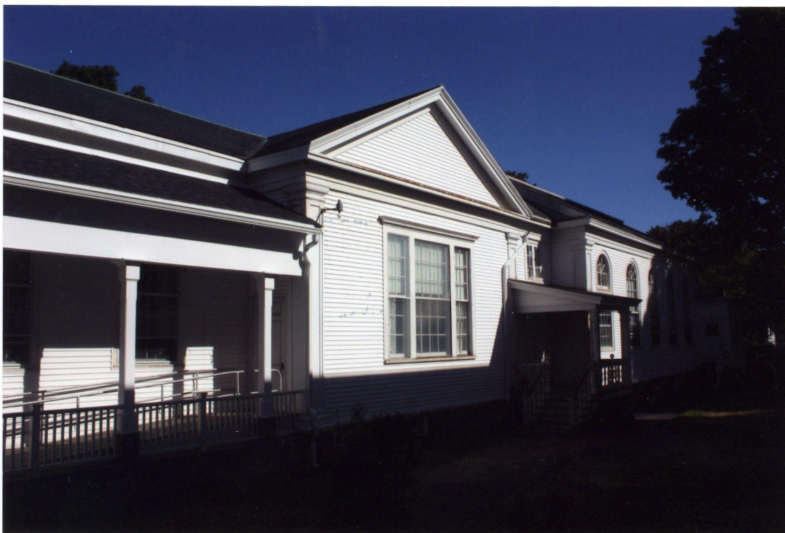
2010 - FISKE MEMORIAL CHAPEL + PARISH HALL - SOUTH SIDE