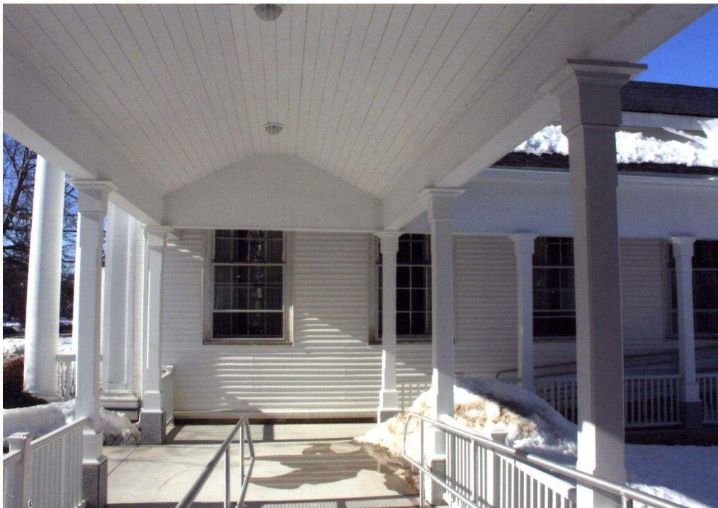
Photo 3: Fiske Chapel/Parish Hall with Connector to Meetinghouse, East Detail Elevation