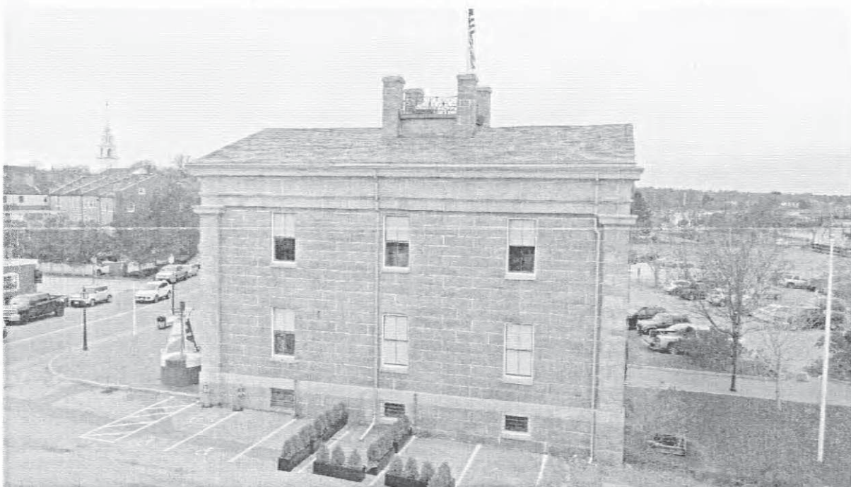
2. 11/14/2019 View of east façade