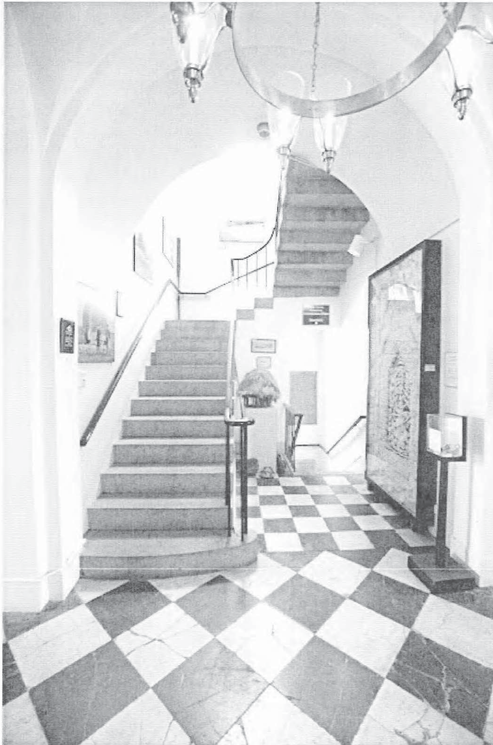
7. 6/2//2009 Interior Hanging Stair/Marble Floor, Carl Tremblay