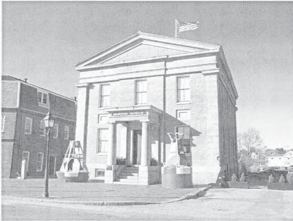
1. 3/18/2019 View of south façade, Gregory Colling