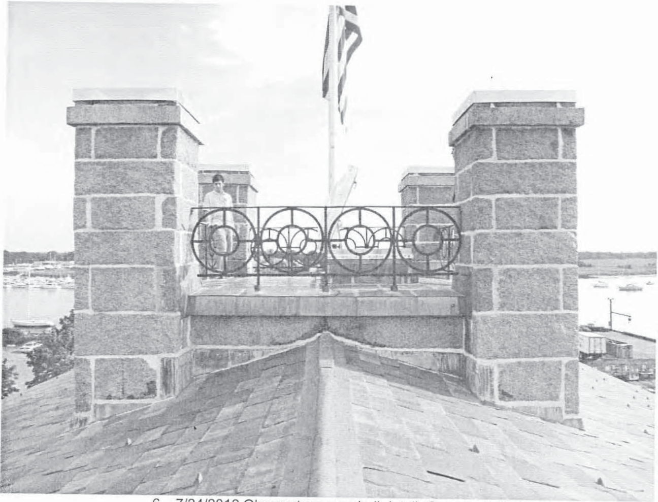
6. 7/24/2013 Observatory guardrail detail, Gregory Colling