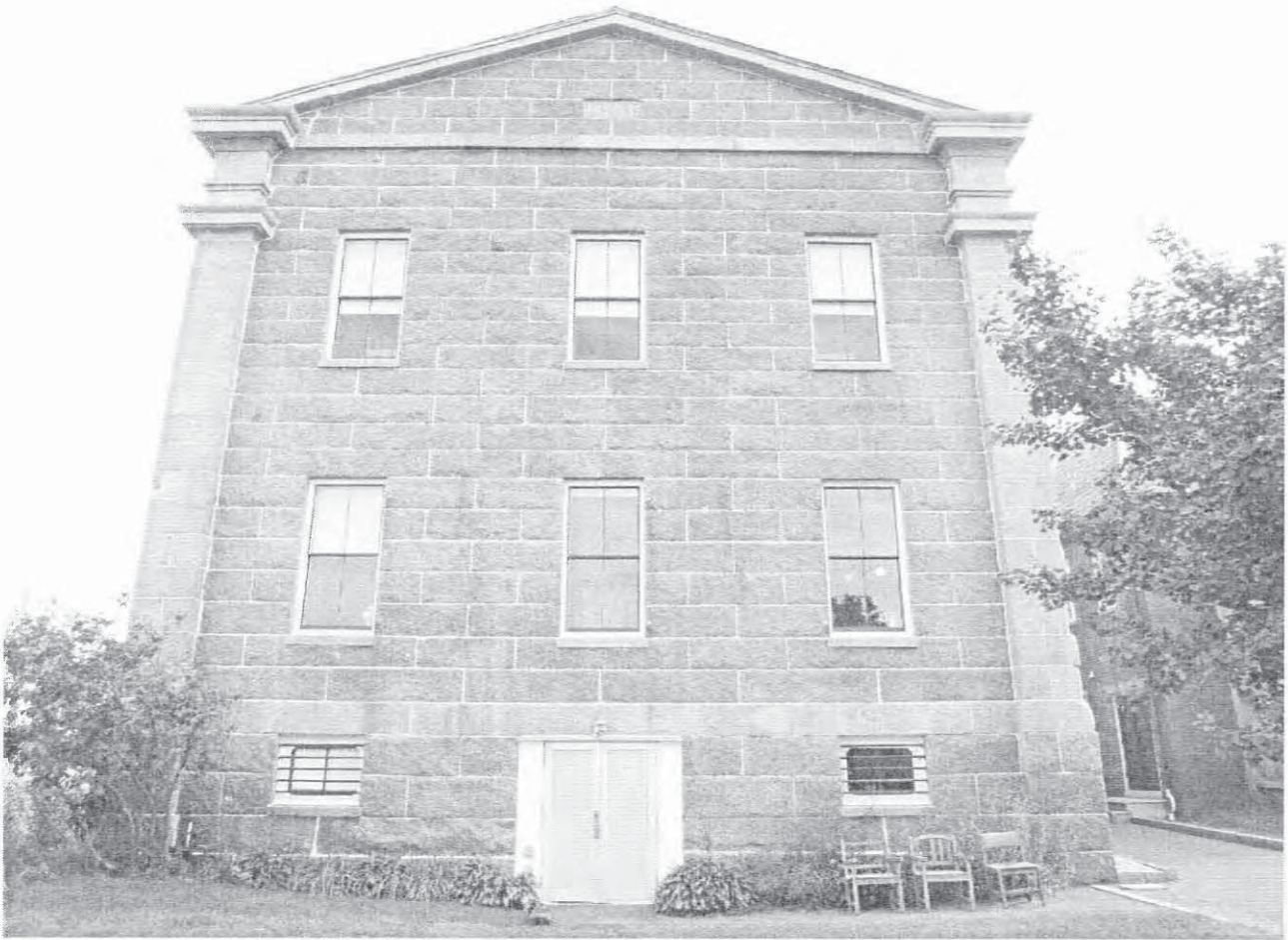
3. 7/27/2013 View of north façade, Gregory Colling