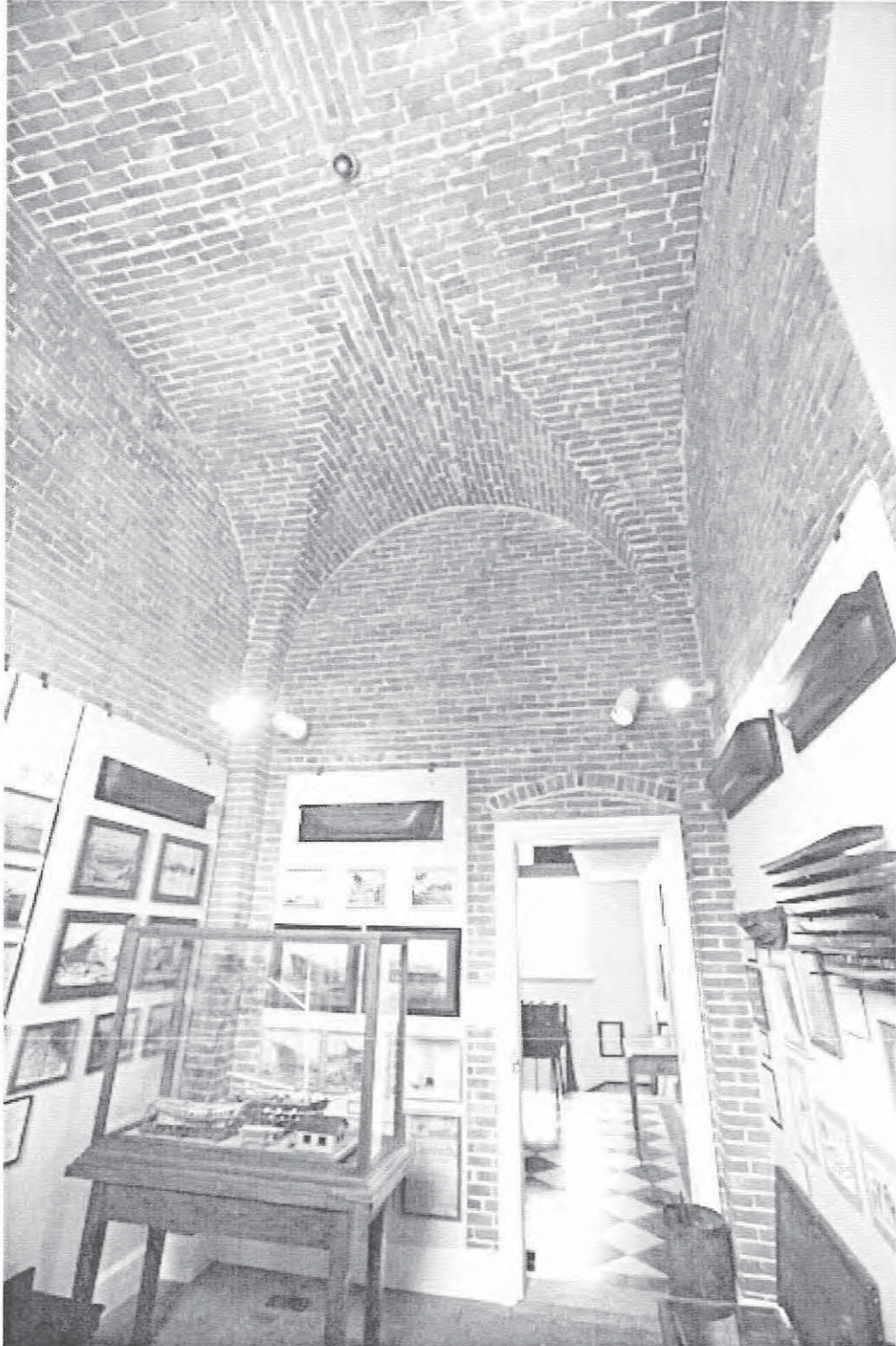
9. 6/2//2009 Second floor groin vault (Baker Gallery), Carl Tremblay