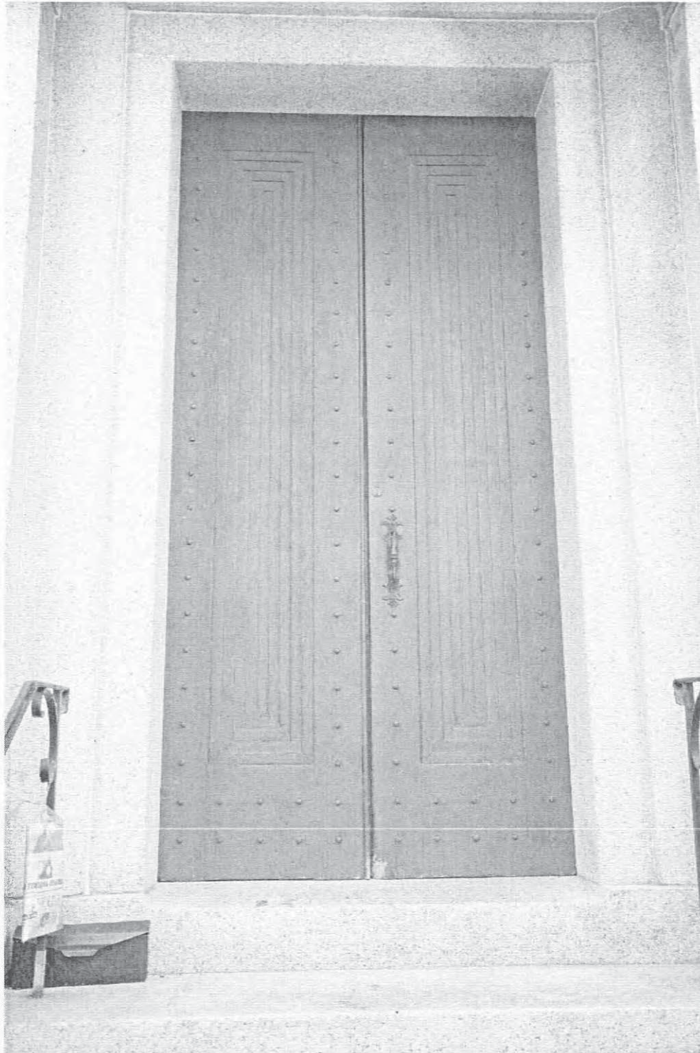
5. 3/16/2019 Water Street Entry Door Detail, Bill Finch