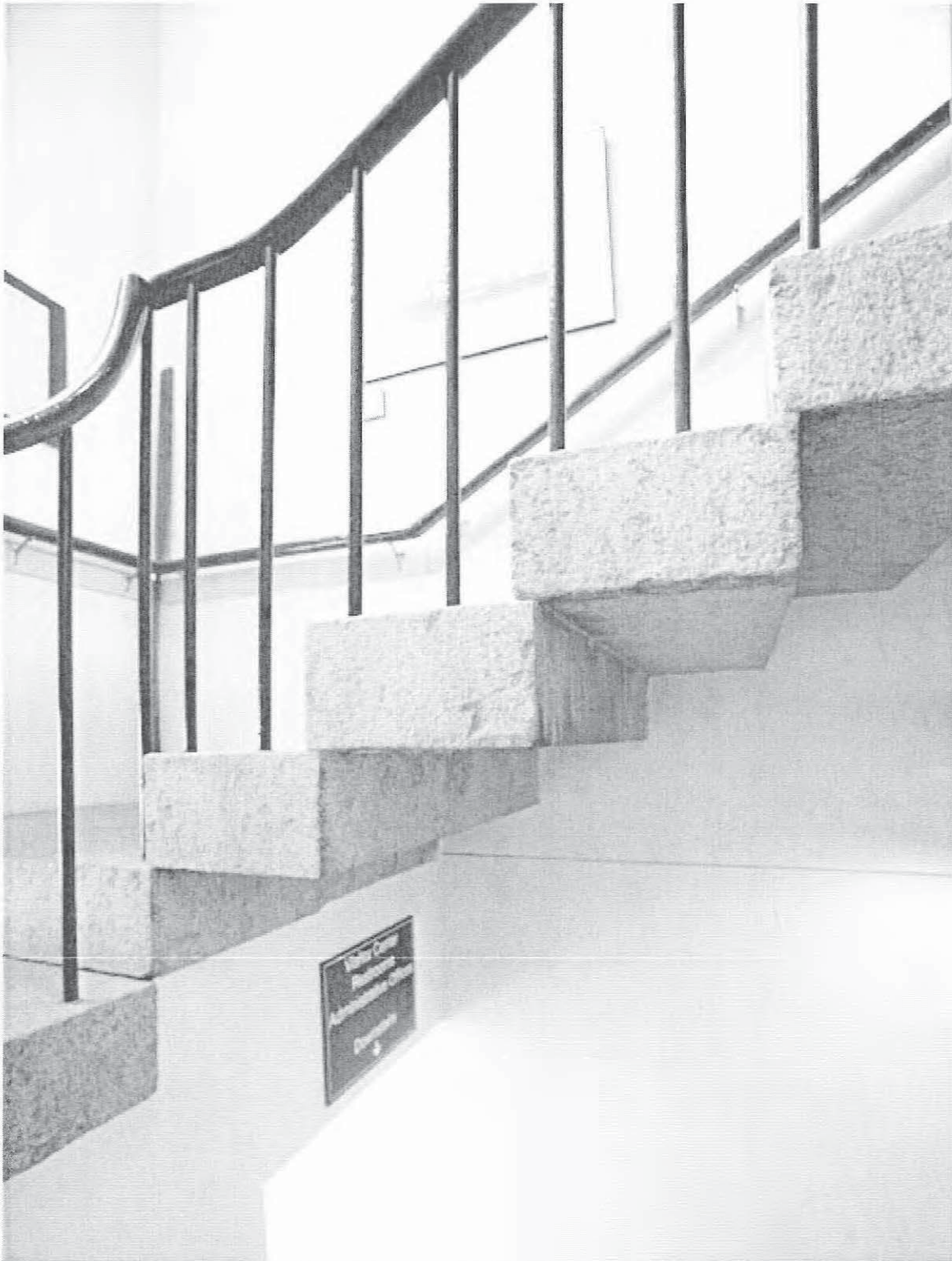
8. 6/2//2009 Interior Hanging Stair Detail, Carl Tremblay