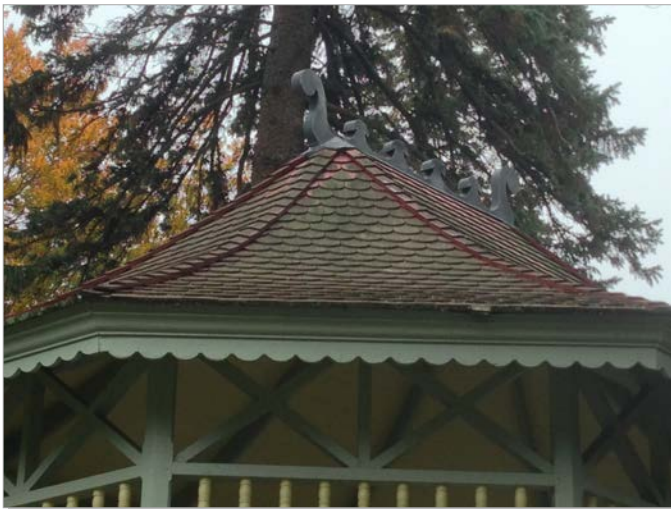
Wooden shingles on the historic gazebo need pressure washing and repainting