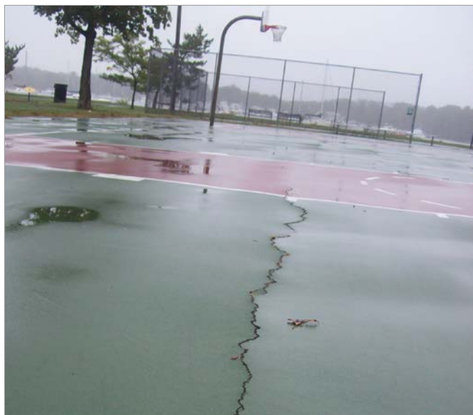
Cracks on basketball court pose a safety hazard to players.