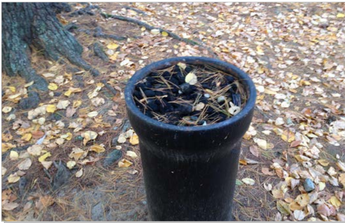
An old grill base collects trash and encourages use of fire where fires are prohibited - should be removed.