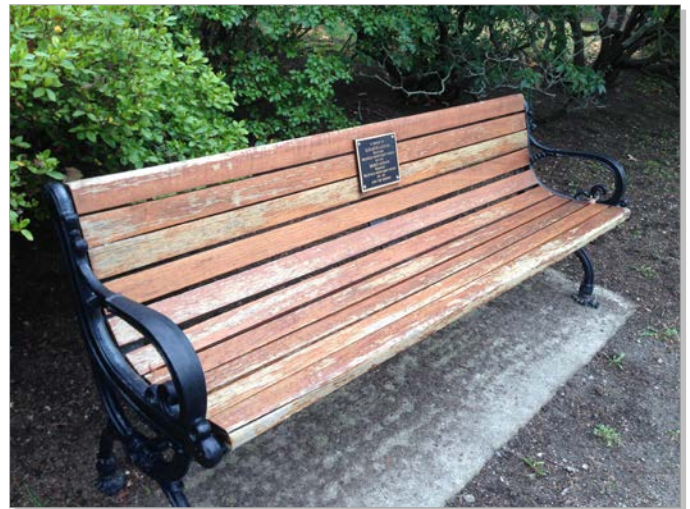
Some park benches need refinishing.