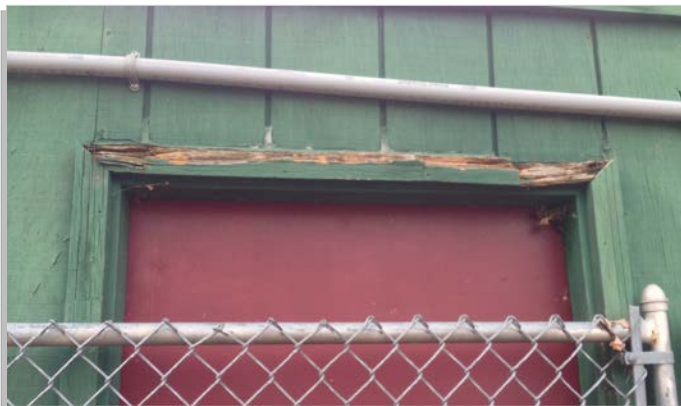
Storage-utility shed needs some woodwork repair and repainting.