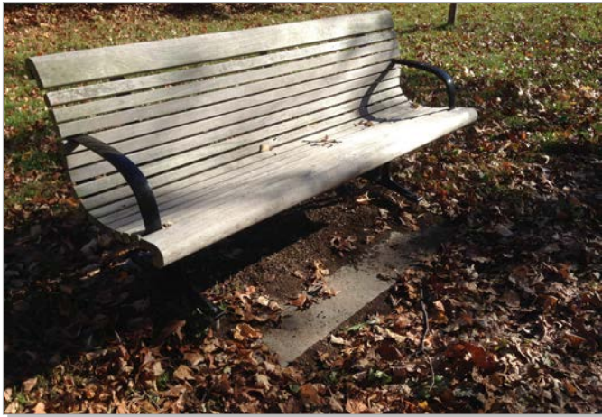
Benches need a new base of wood chips and refinishing.