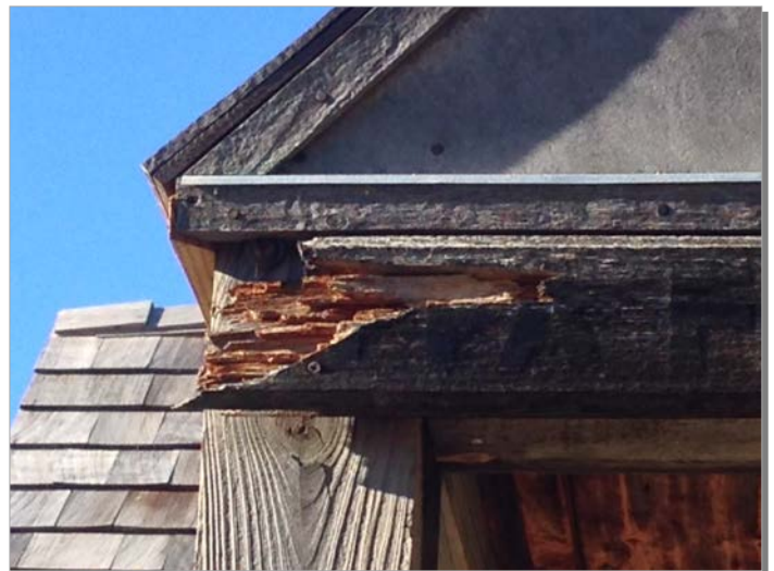
Sandbox structure needs additional structural repairs.