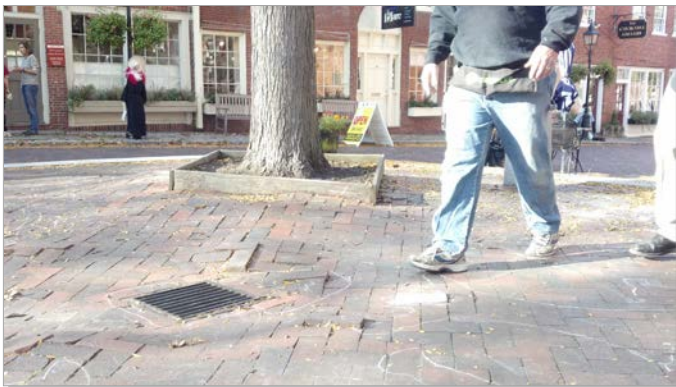
Aging brickwork presents tripping hazards throughout the area.