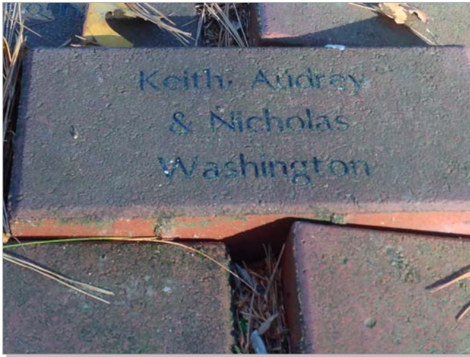
Several dislodged bricks in the walkway, like the one above, present tripping hazards.