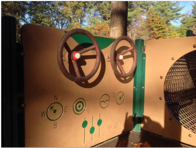
Some portions of the climbing structures have been repainted, but many components still need cleaning and touch up paint.