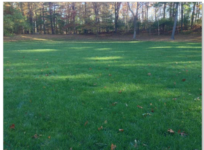
The field, renovated in partnership with Newburyport Youth Soccer Association, continues to look well-maintained.