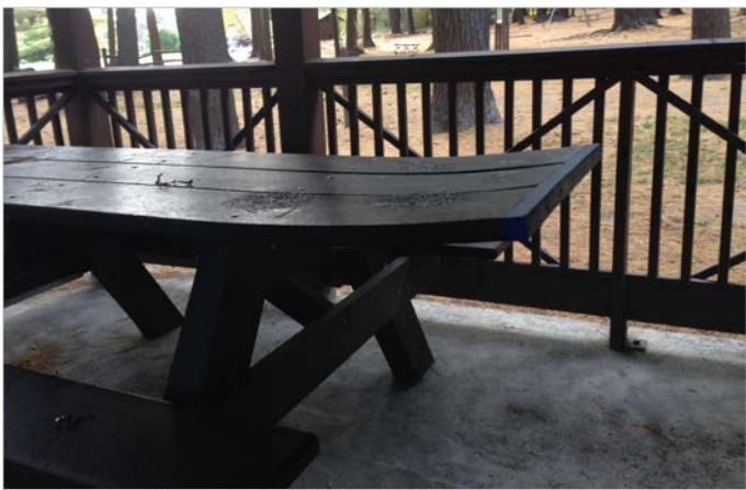
Synthetic planks on this and other picnic tables and benches are warped and need replacing.