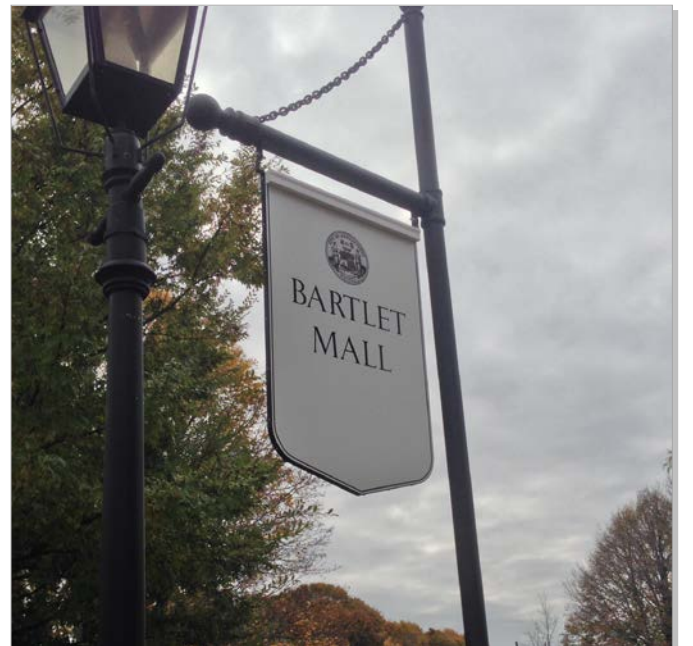
Park signs were replaced with grant funding from The Mayor Gayden W. Morrill Charitable Foundation.