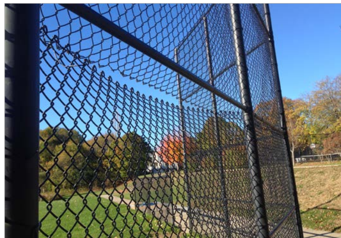
Backstop needs some fence repair.