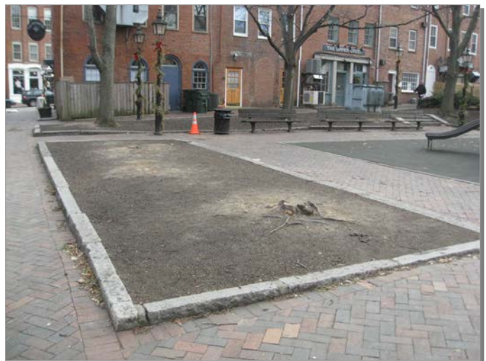
Removal of park vegetation leaves the area looking bare and unattractive.

The historic fountain has not functioned for several years due to an inadequate filtration system and problems with storm water contamination. A new project in coordination with the Office of Planning and Development aims to improve filtration and area storm water drainage to make the fountain functional. The project will also add interactive components to the fountain deck and make other repairs and enhancements to the site.