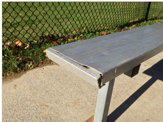
Damaged dugout bench presents cutting hazard.