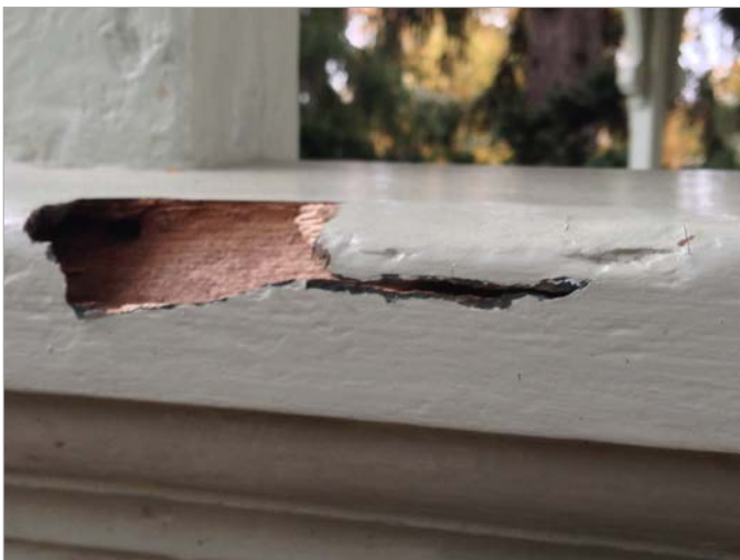
A portion of the gazebo sill is rotted and needs replacing.