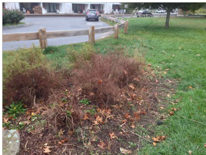
Several dead plantings need to be replaced in a garden bordering the off leash lawn area.