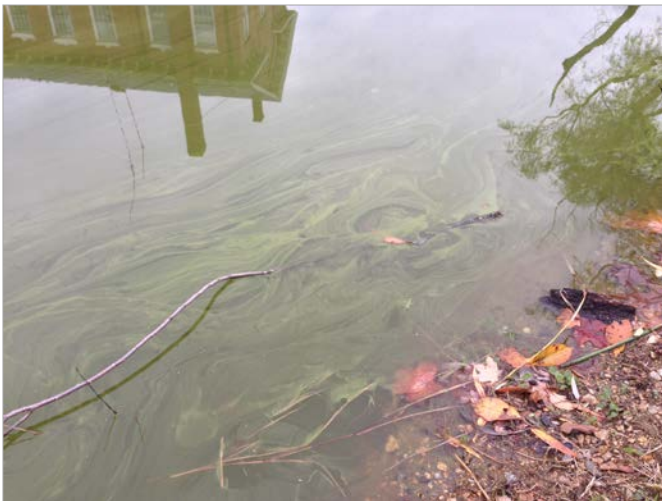
Above: A feasibility study revealed that the Frog Pond appears to be suffering from eutrophication-induced poor water quality, as indicated by the presence of extended blooms of blue-green algae.