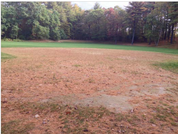
The baseball infield is full of weeds and needs an overhaul. The backstop was removed due to its deteriorated state.