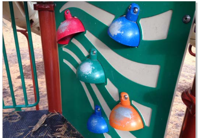
Portions of the central climbing structure need touch up paint.