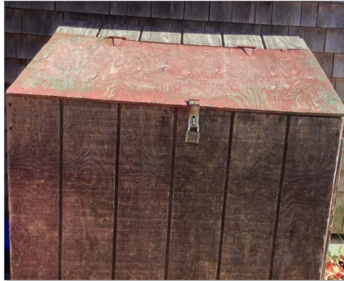
A storage box next to the shed needs painting and a new lid.