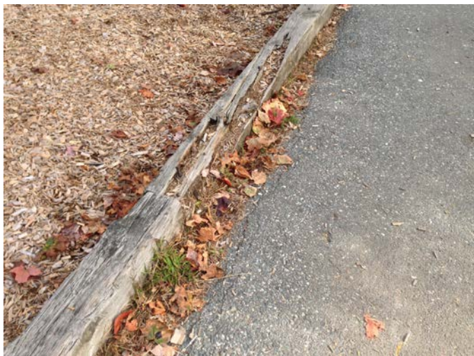
While many landscape ties were replaced, further work needs to be done to address rotting ties.