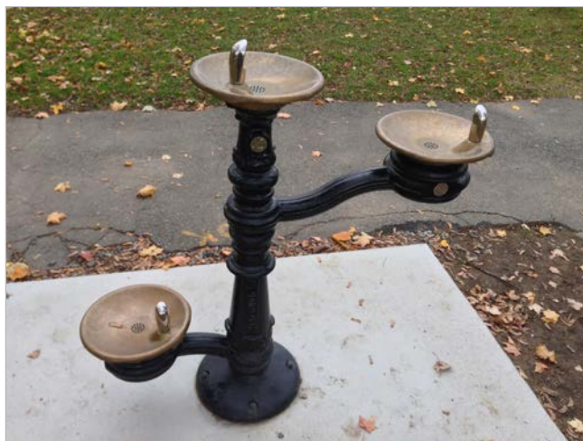
A new bubbler serves parks users of all sizes including its canine visitors.