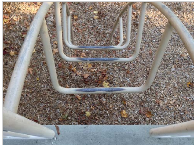
Some portions of the climbing structure have been touched up but more touching up remains.