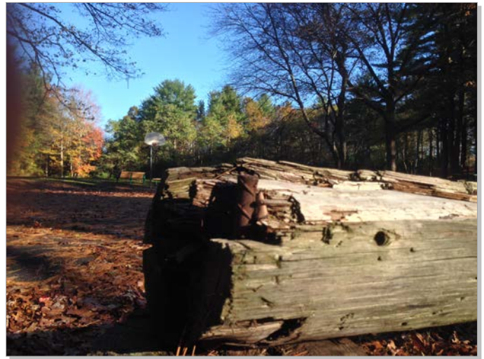
Landscaping timbers that border the parking lot are rotted with exposed rebar presenting a protrusion hazard, need replacement.