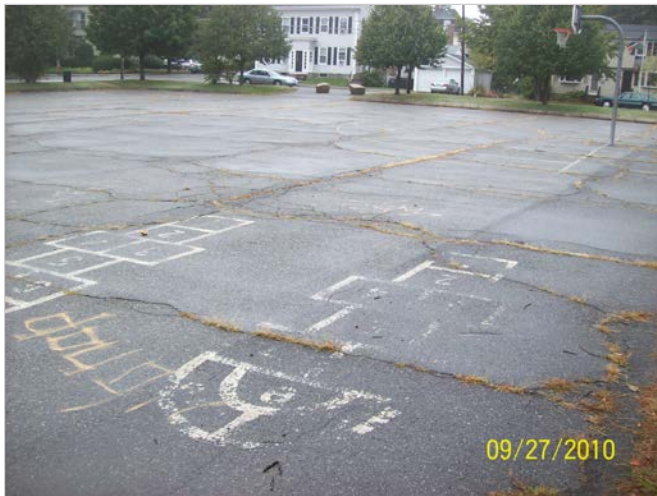
Asphalt basketball court and play area is in need of resurfacing and re-lining.