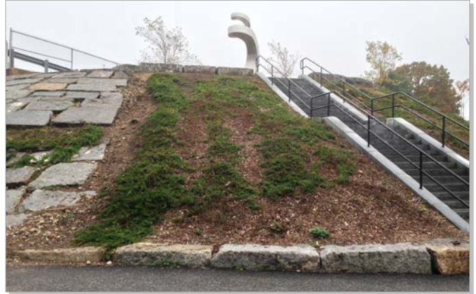
Increased maintenance of sloped planting areas improves appearance of the trail's problem areas.