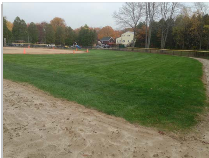
Fields are in good shape (above). Pioneer League has invested $300,000 into fields, irrigation, infields, fencing and new dugouts (below). Beginning in spring 2009, they completed one field a year through spring 2011.