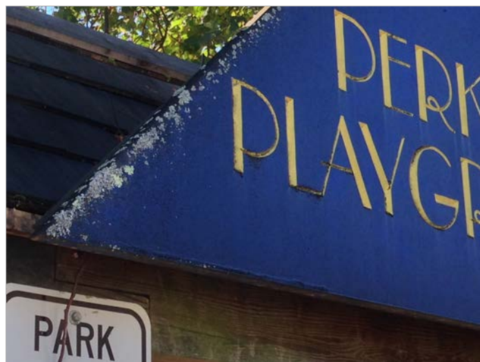
The declining sand box structure and park entrance cupola were shored up, given new decking and new shake shingle roofs, but the park entrance sign still needs replacement.