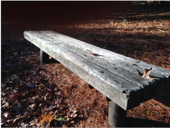
A bench by the basketball court is dilapidated and needs replacement.