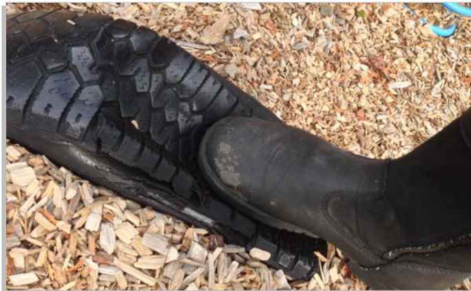
One rubber-tire bumper is deflated under the see-saw and needs to be replaced.