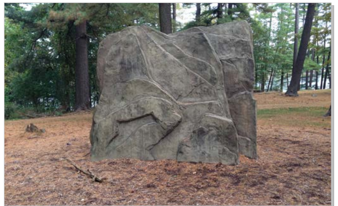
Additional wood fiber safety surfacing is needed around all play structures.