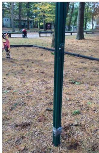
One sound tube is broken off. Photo on left shows what it should look like. On right is what remains of the damaged play piece.