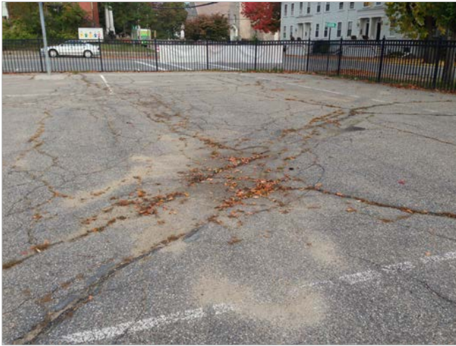
Above: A basketball court which doubles as winter parking is in serious need of resurfacing and restriping.