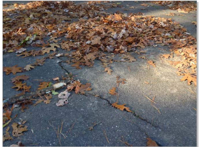
Cracks in the basketball court present safety concerns for players.