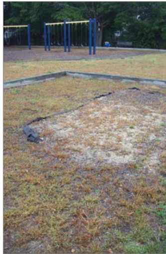
Missing play structures (right) and ragged landscaping gives the park an un-cared for look.