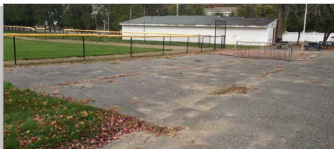
Clubhouse needs renovation and asphalt needs resurfacing throughout the park.