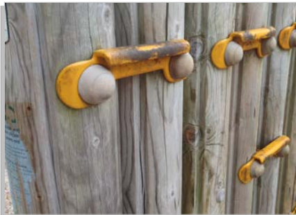
Play structures could use cleaning and paint touch up.