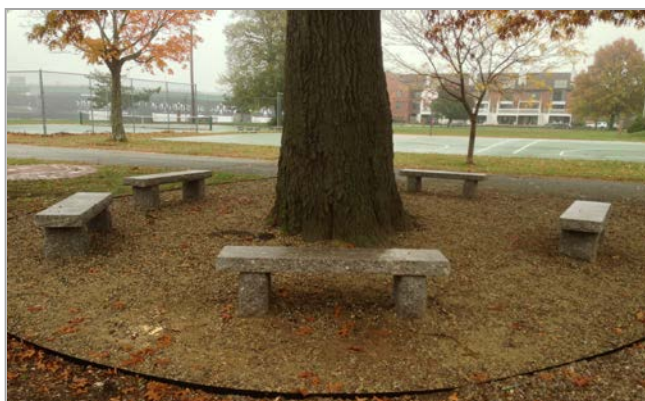
Granite benches that posed a safety hazard were re-set in a newly landscaped seating area.