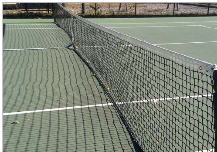
New tennis were recently donated.