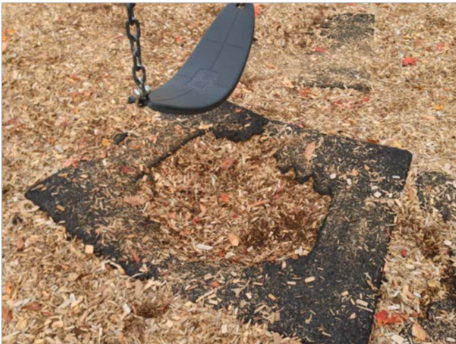
Above: Swing mats are deteriorated and need replacement.