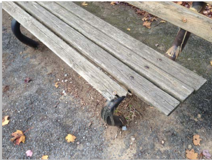
Dilapidated benches are unattractive and present a safety hazard.