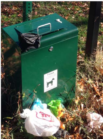
Above left: pet waste management contract may need to be increased to keep up with demand. Above right: bollards need touch up paint.