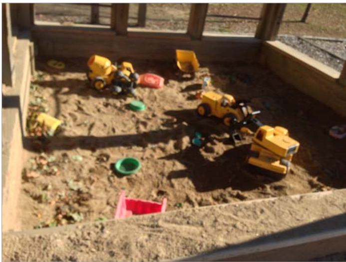
Sandbox needs a fresh supply of sand.