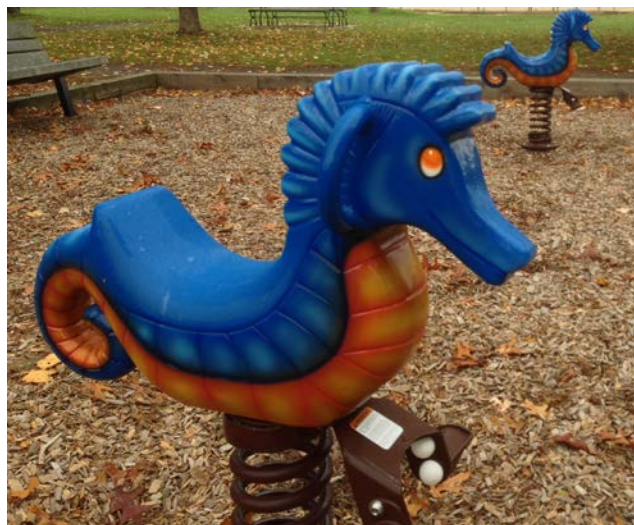
Two new seahorse spring toys replaced missing play equipment.