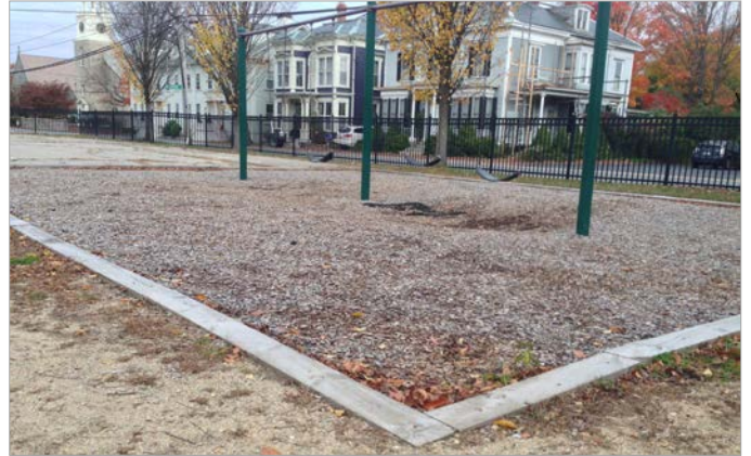
Replaced broken and dangerous playground edging with new landscape ties.