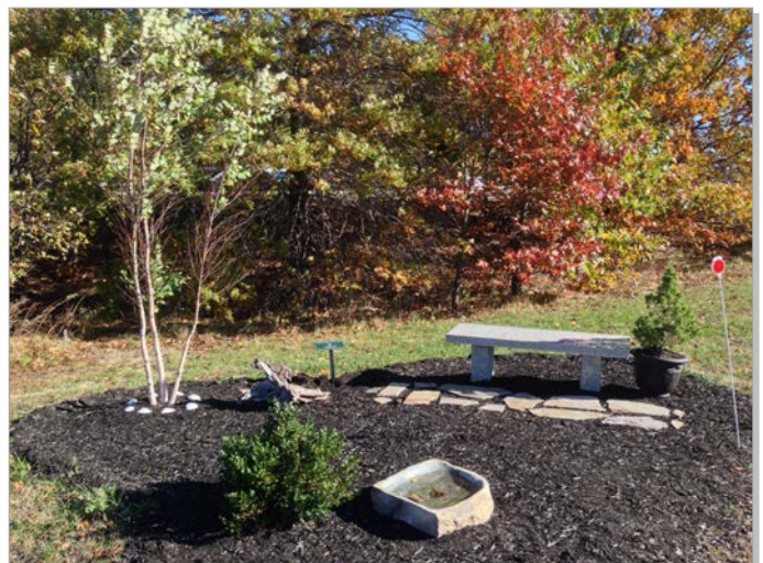
Support-a-Spot program resulted in new gardens and an improved Parker Street gateway garden thanks to volunteer labor and financial donations.