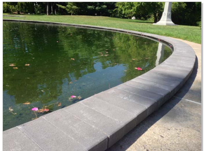
Deteriorated Lily Pond curbing was replaced with grant funding.