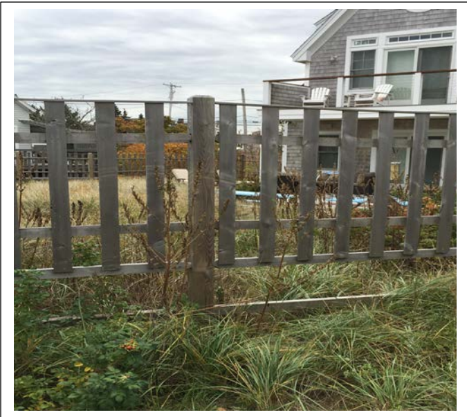
Modified Stockade (Picket could be modified similarly)