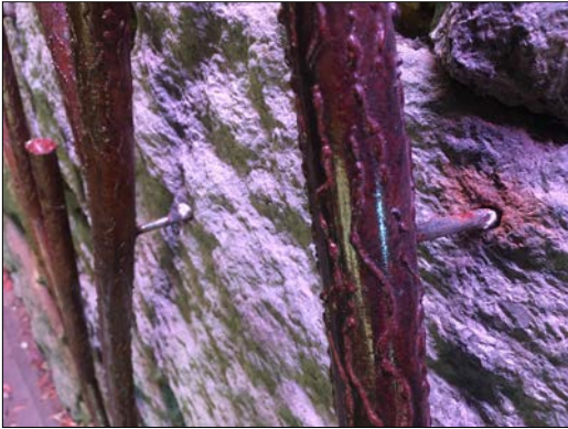
One of the underpass “walk in the deep” sculptures (branching coral) has been pulled out of the granite wall