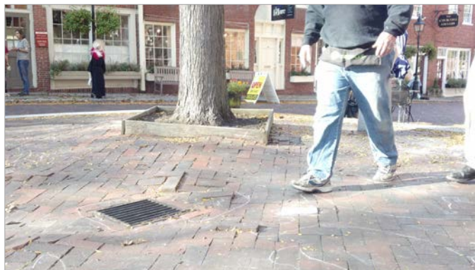
ABOVE: Aging brickwork presents tripping hazards throughout the area.