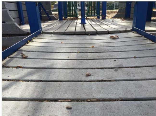
Warped ramp slats impede play structure accessibility.