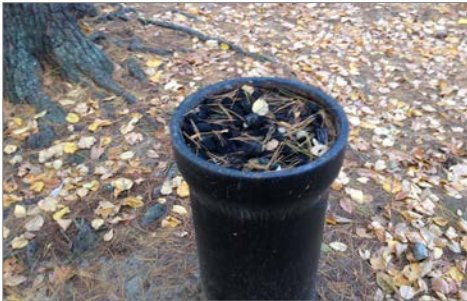
An old grill base collects trash and encourages use of fire where fires are prohibited - should be removed.