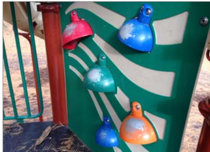
Portions of the central climbing structure need touch up paint.