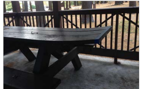
Synthetic planks on this and other picnic tables and benches are warped and need replacing.