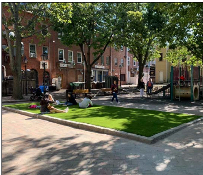
A dirt lot where trees had been removed was replaced with synthetic turf.