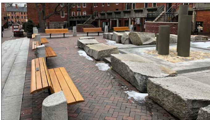
Six more new benches have been installed on Inn Street around the fountain and in the Byron's Court area.