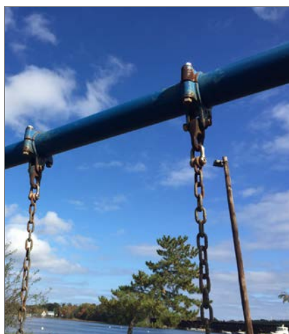
Rusting hardware is typical at a playground of this age and will be replaced.