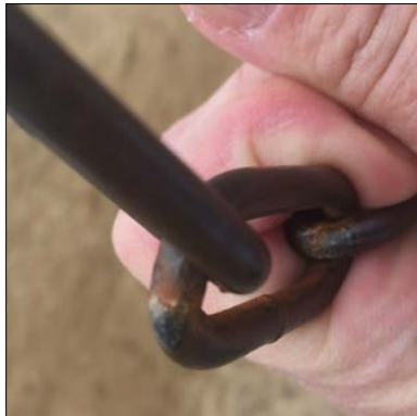
Aging swing chains need replacement