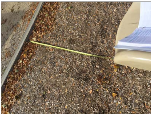
Slide use zone is non-compliant with federal safety standards and should be corrected.