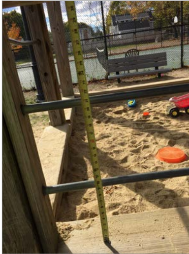
Sandbox needs added guardrails to meet federal safety guidelines.