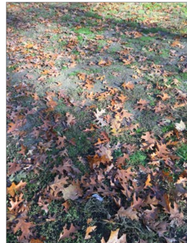
Front lawn was badly damaged by construction activities for the Merrimac Street roundabout project. Lawn renovations still on hold based on available resources.