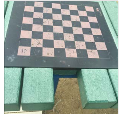
Game table needs repairs and new game surface.