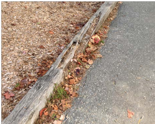
While many landscape ties were replaced, further work needs to be done to address rotting ties.