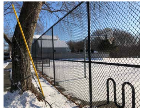
Chain link fence at basketball court repaired.