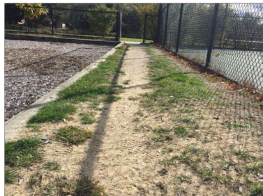
(Above and left) Beacon Avenue sidewalk and walkways within the park need replacement to improve accessibility.