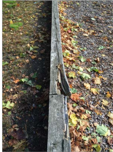
Several landscape ties need to be replaced.