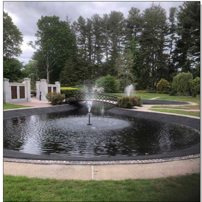
ABOVE: Staff completely renovated the Lily Ponds in 2019 including total replacement of all underground & pump house plumbing and resurfacing and sealing of bowls. BELOW: Staff, volunteers and inmate crews have spearheaded ongoing bed maintenance.