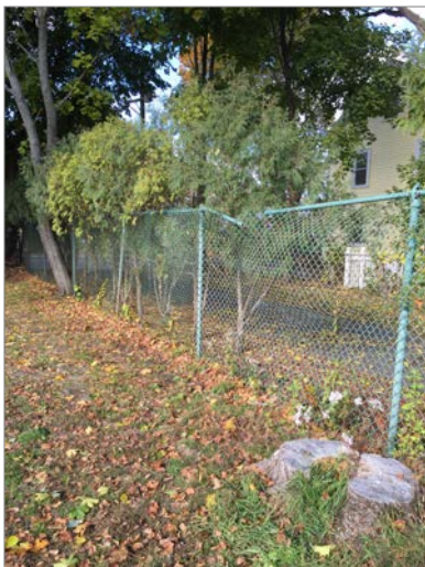
Dilapidated chain link fence needs repair and/or replacement.