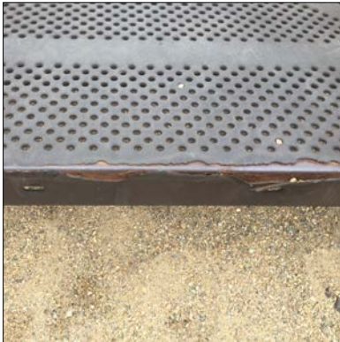
Aging painted surfaces can present sharp edges, need sanding & painting.