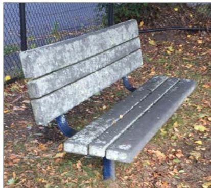
Benches cleaned. ABOVE: Before. BELOW: After.