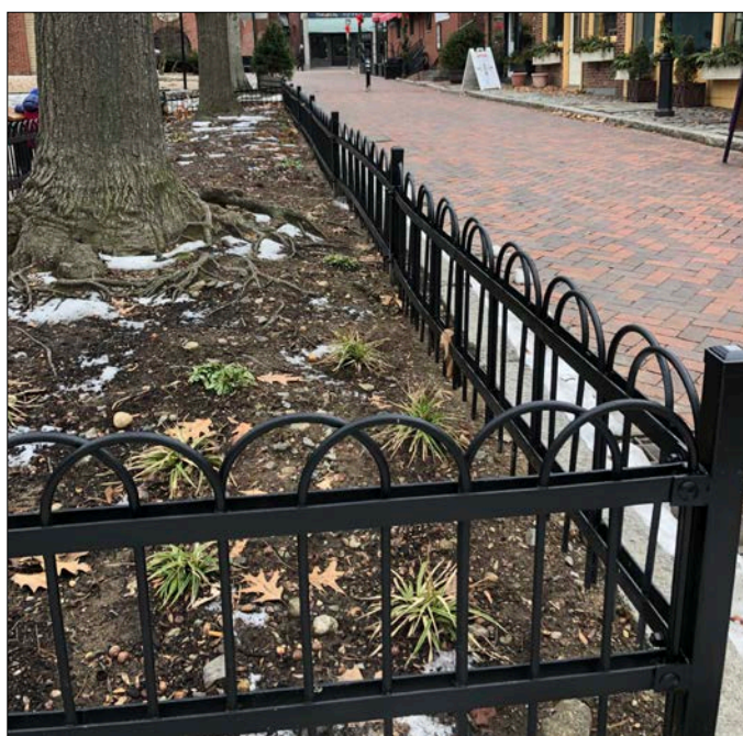
A new landscape fence protects new plantings around playground.