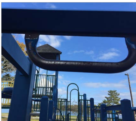
Touch up painting of playground equipment is an ongoing task at all playgrounds.