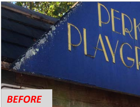
Park sign restored. ABOVE: Before. BELOW: After.