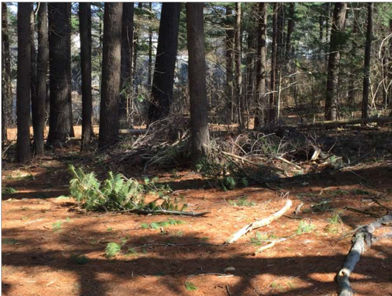
Trees are in constant need of care especially at Moseley Woods where there are so many of them. The Parks Department addresses prioritized needs identified by the tree management plan as well as unanticipated tree hazards.