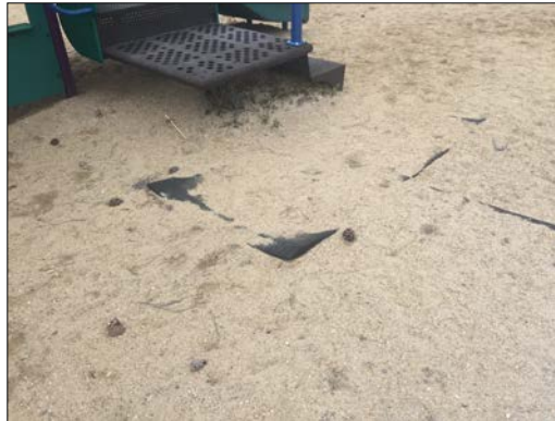
Added safety surfacing will also address a tripping hazard presented by exposed geotextile.