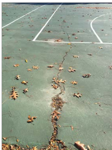
Cracks on basketball court pose a safety hazard to players.