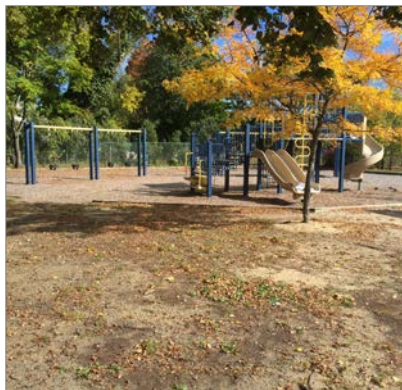
The lawn is sparse throughout the playground area and needs renovation.