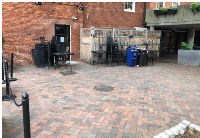
Extensive brickwork and drainage improvement was done by private donation to one plaza area. Parks Dept has also made improvements to the elevated walkway, stairwells and columns.