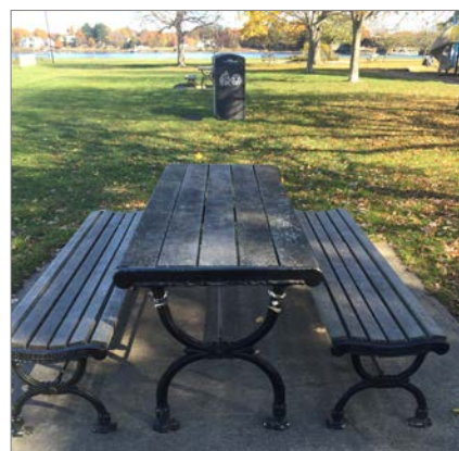
Picnic tables need refinishing.