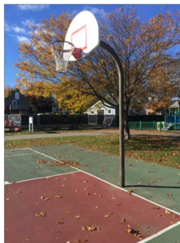
Basketball nets as installed are almost in play and dangerous. They should be replaced with 4' necks to move the pole off the court and pads added to the poles.