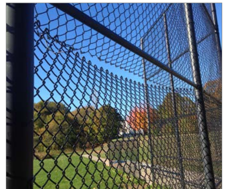
Ballfield backstop needs repairs, touch up painting.