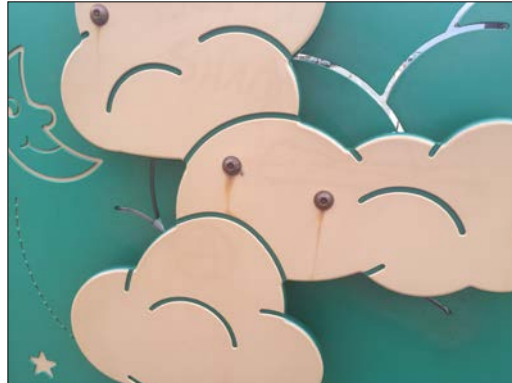
The ocean front location is tough on wear and tear of hardware.